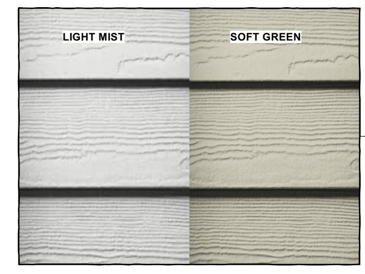
Hardie Plank Composite Weather Boards Example shades - final colour to be agreed.