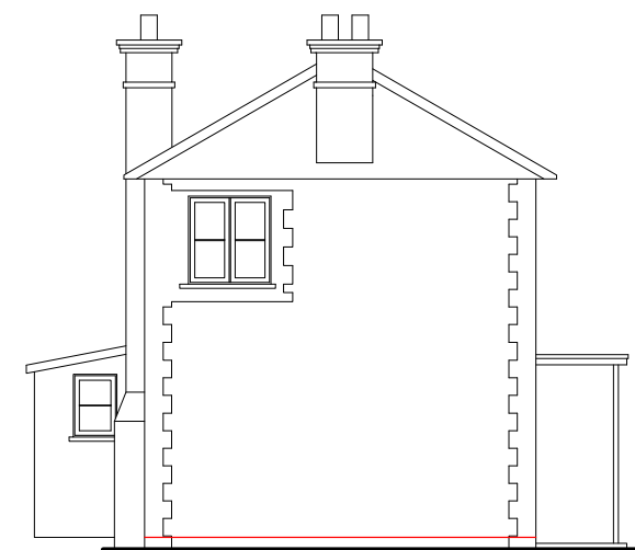
EXISTING SIDE (NE) ELEVATION