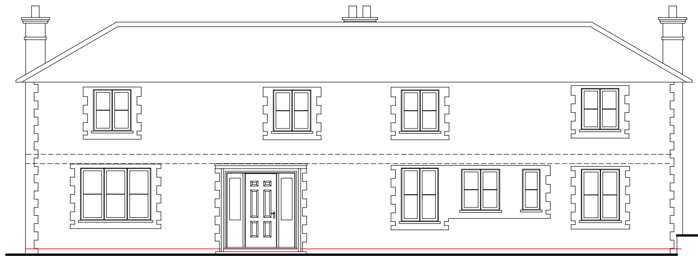
EXISTING FRONT (NW) ELEVATION