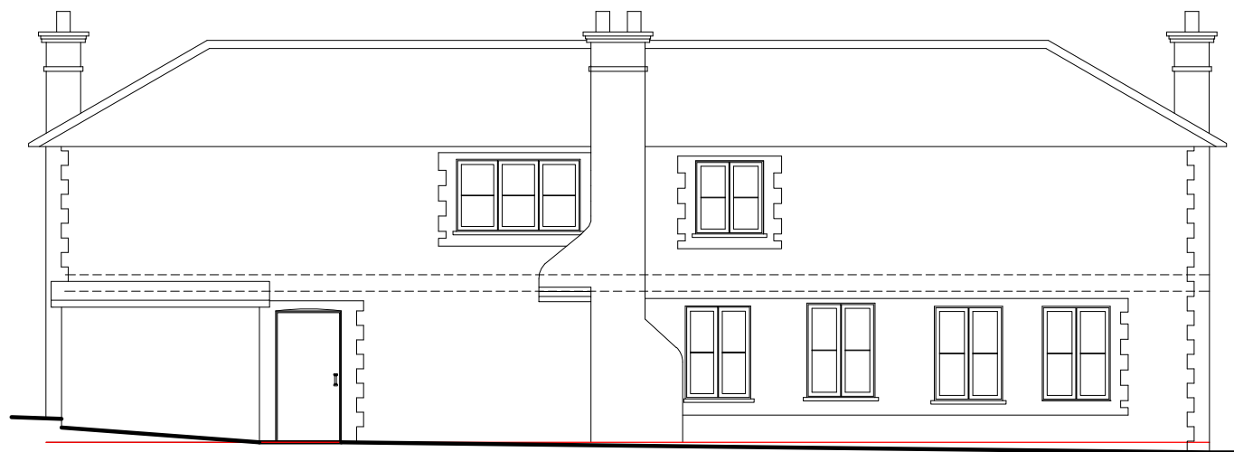
EXISTING REAR (SE) ELEVATION