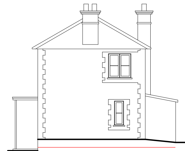
EXISTING SIDE (SW) ELEVATION