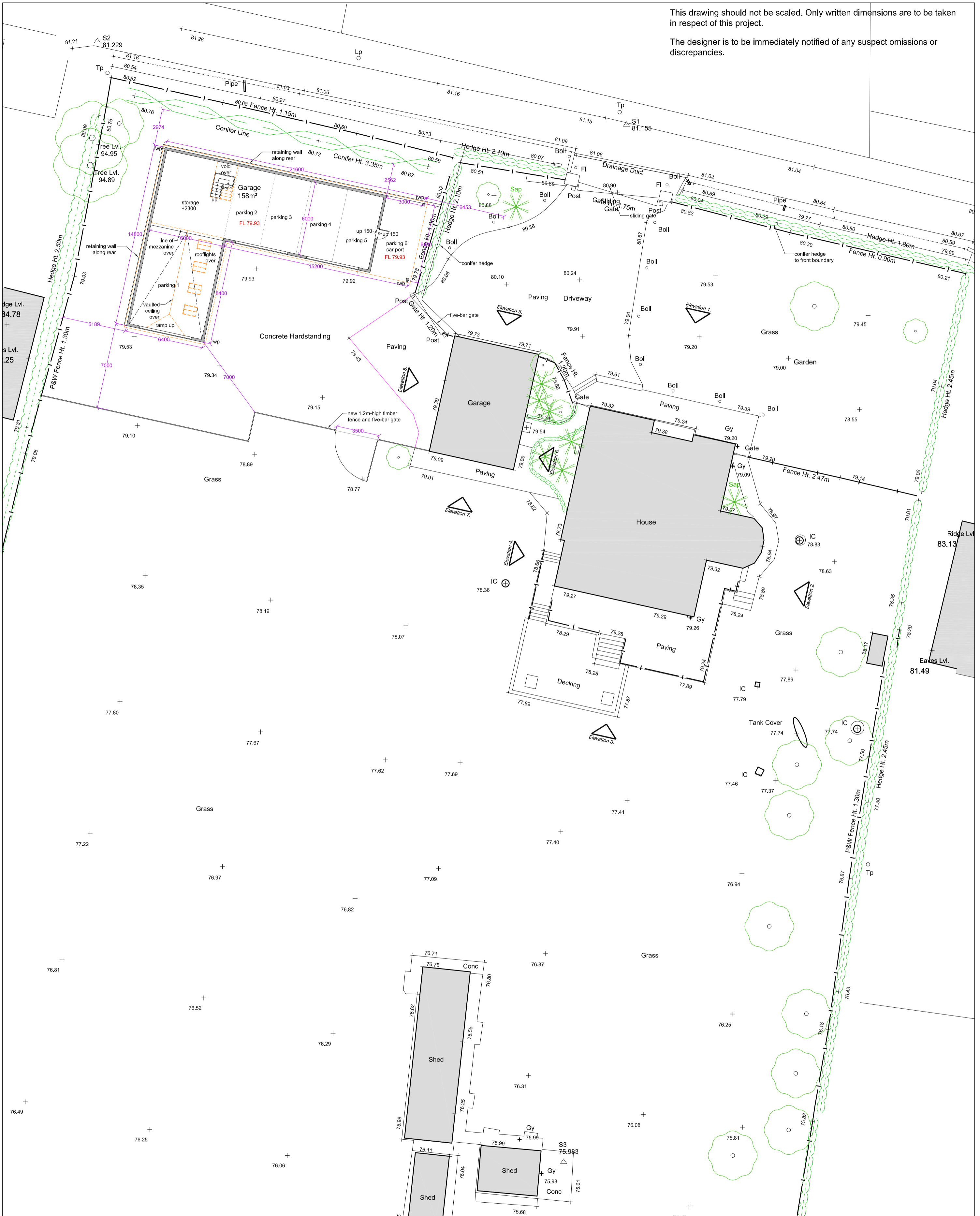
Proposed Partial Site Plan @ 1 : 200

The designer is to be immediately notified of any suspect omissions or discrepancies.