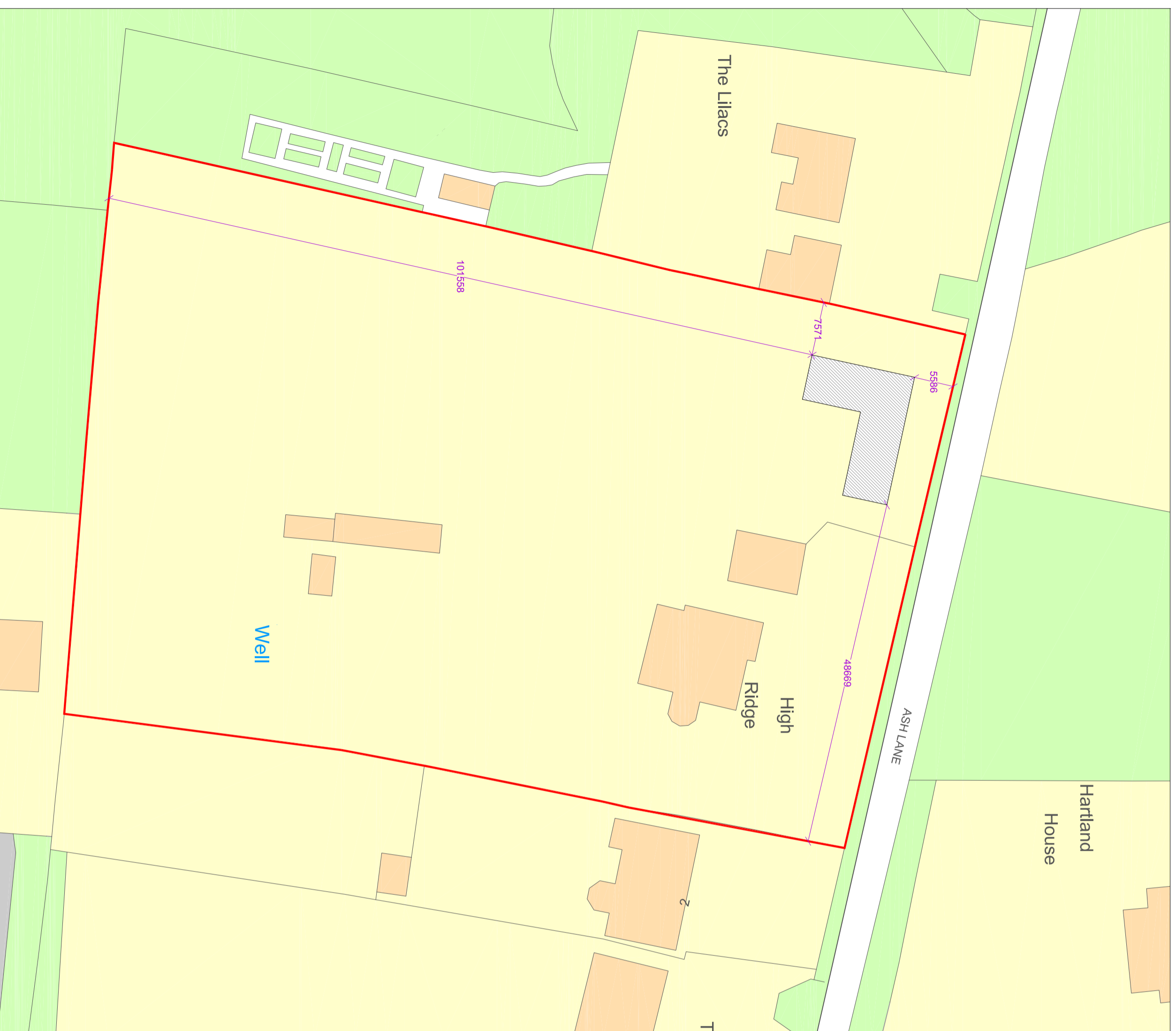
Proposed Block Plan @ 1 : 500

This drawing is copyright and may not be copied or reproduced without the written consent of Finola Brady Architectural Services. The contractor is responsible for setting out and must check all levels and dimensions prior to work being put in hand. This drawing should not be scaled. Only written dimensions are to be taken in respect of this project. The designer is to be immediately notified of any suspect omissions or discrepancies.