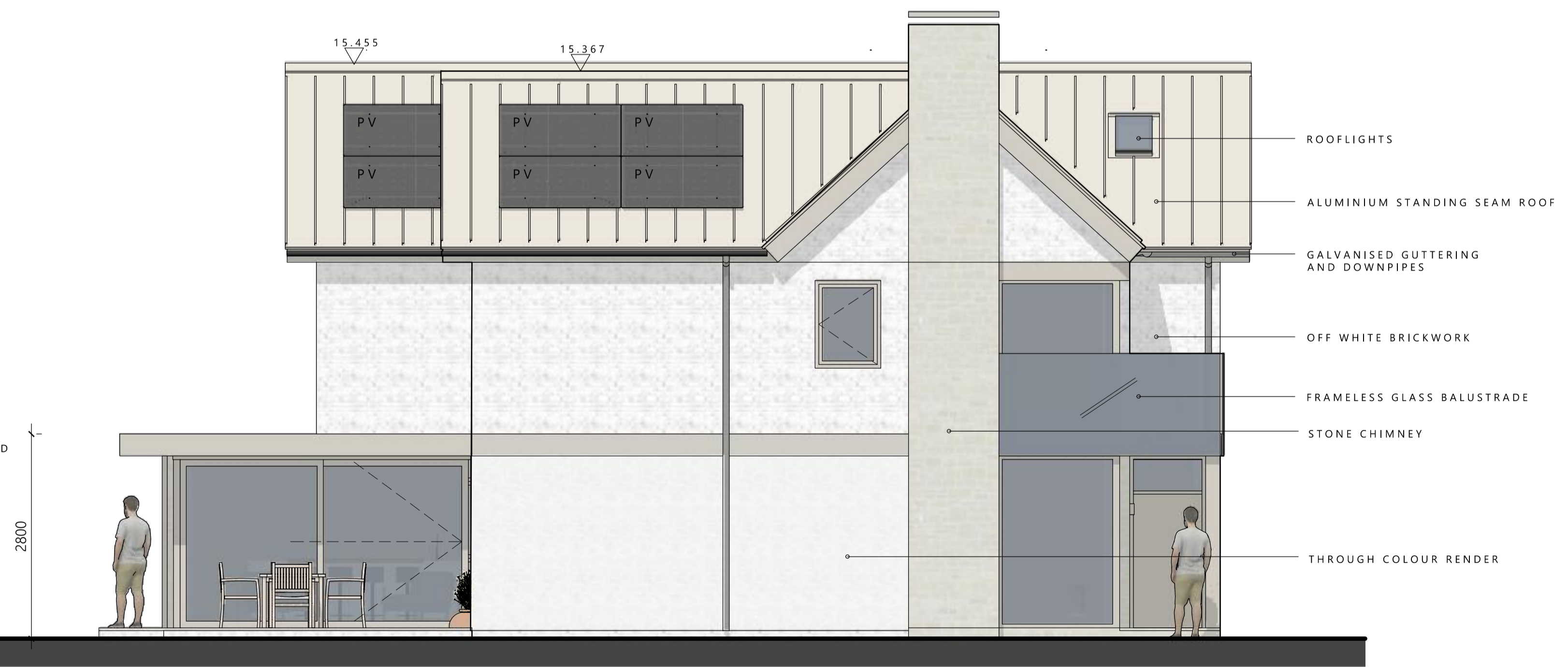
SOUTH FACING ELEVATION