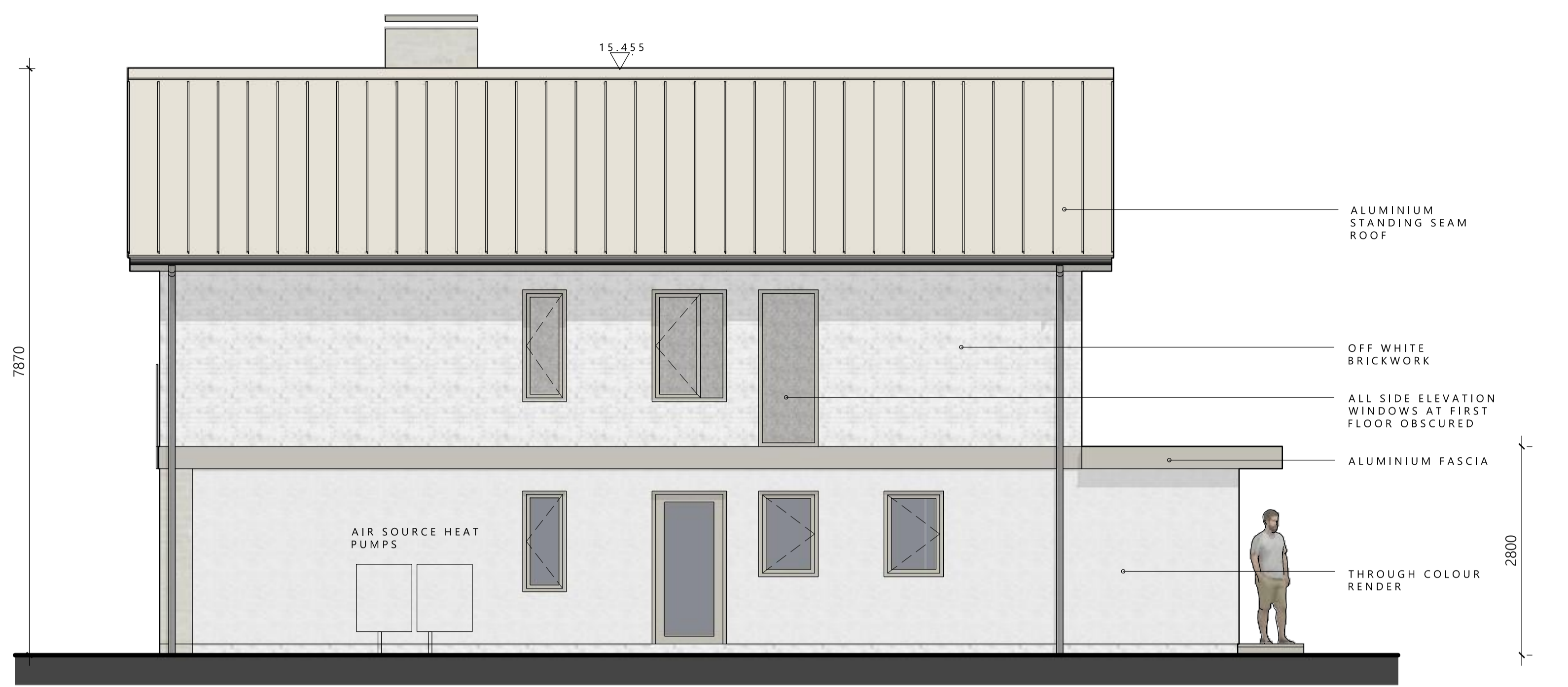
NORTH FACING ELEVATION