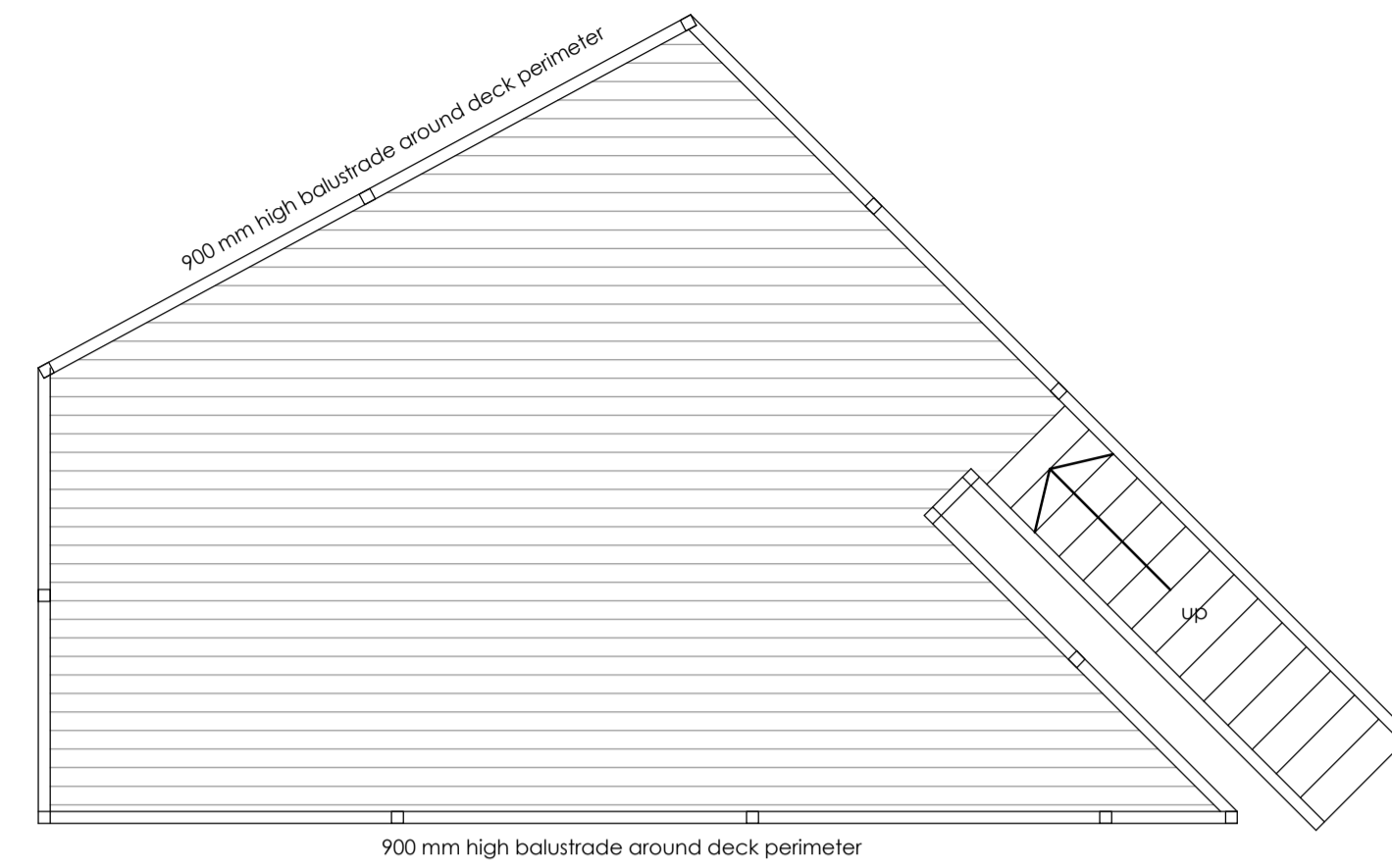
Plan of decking