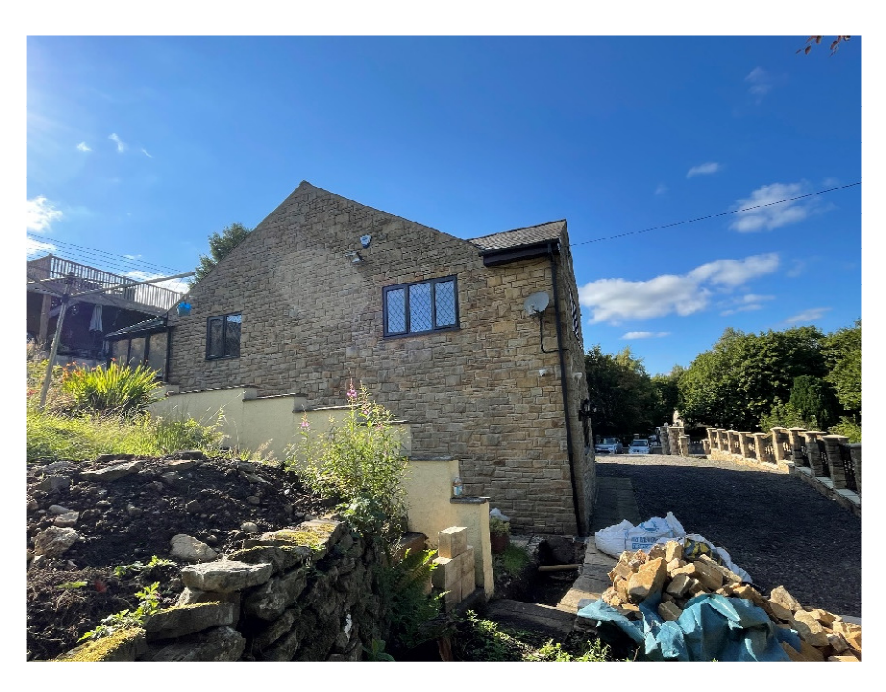
Shows level of ground behind boundary wall outside house and the newly constructed piers and fence to protect against fall