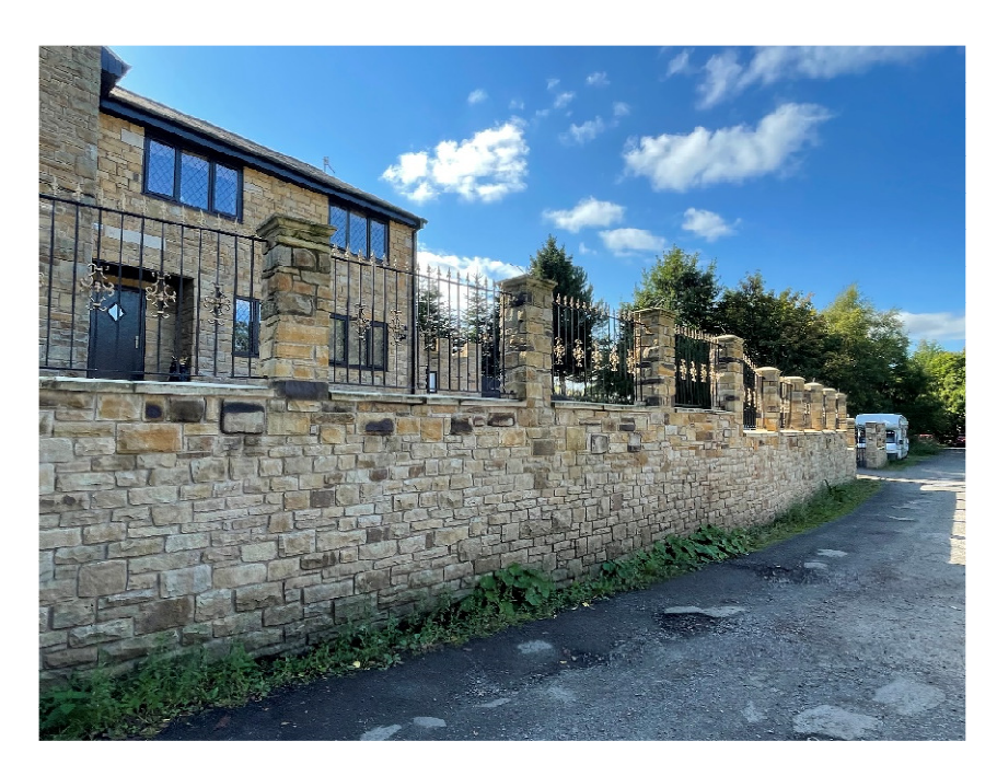
Boundary wall from Mill Lane, pillars and railings commenced March 2021 completed May 2021