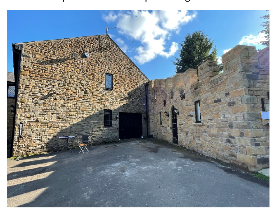
Street view of wall to rear yard/steps after facing in stone, facing commenced Sept 2021 and completed Oct 2021