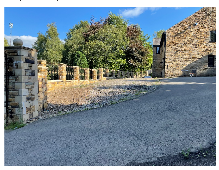
Boundary wall from house side from base of drive