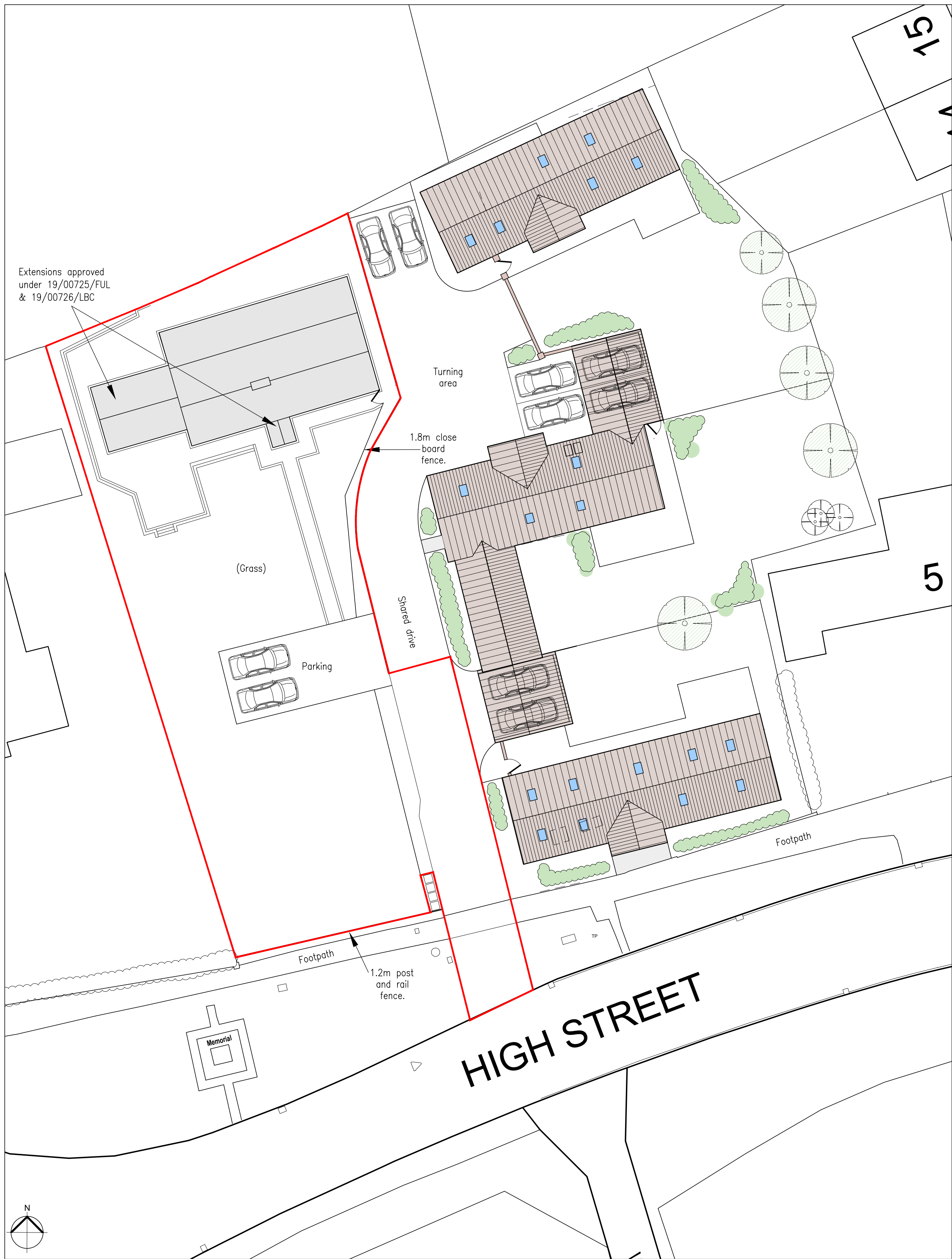
Existing Site plan 1:200