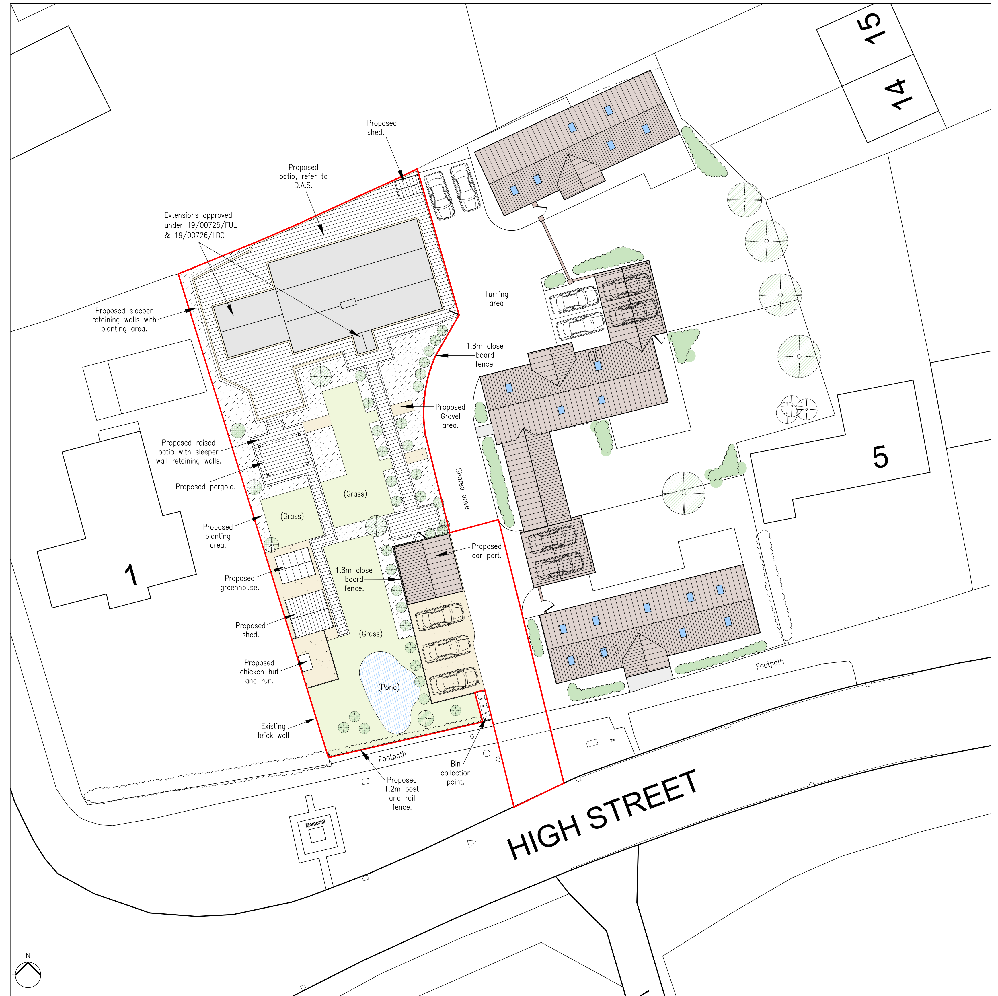
Proposed Site plan 1:200