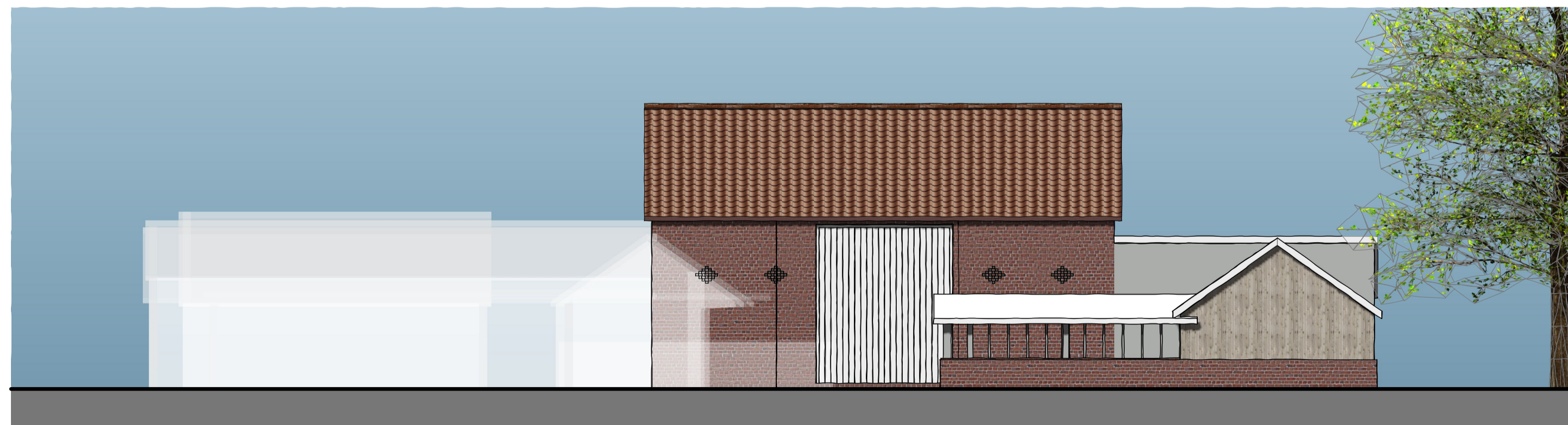
South Elevation 1:100