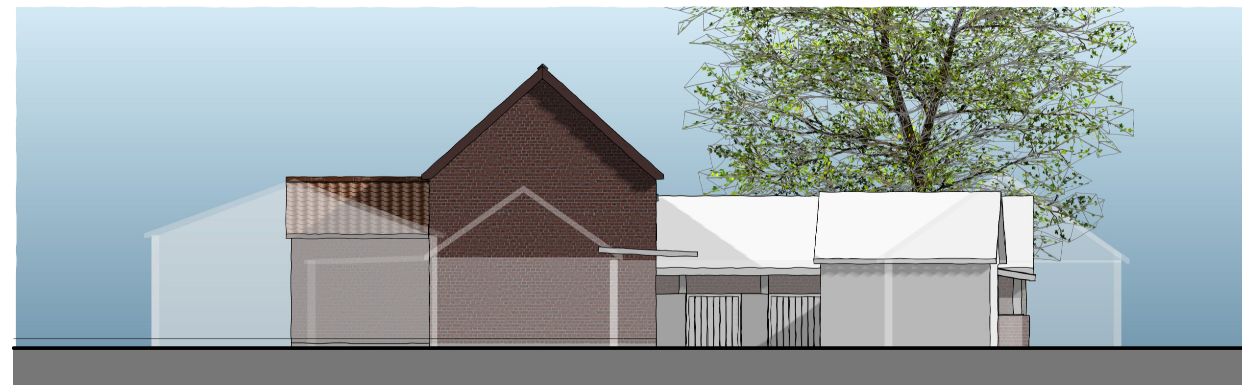
West Elevation 1:100