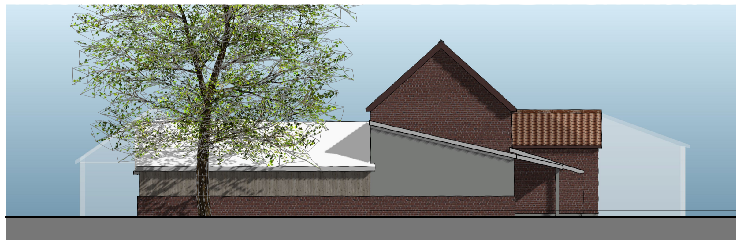
East Elevation 1:100