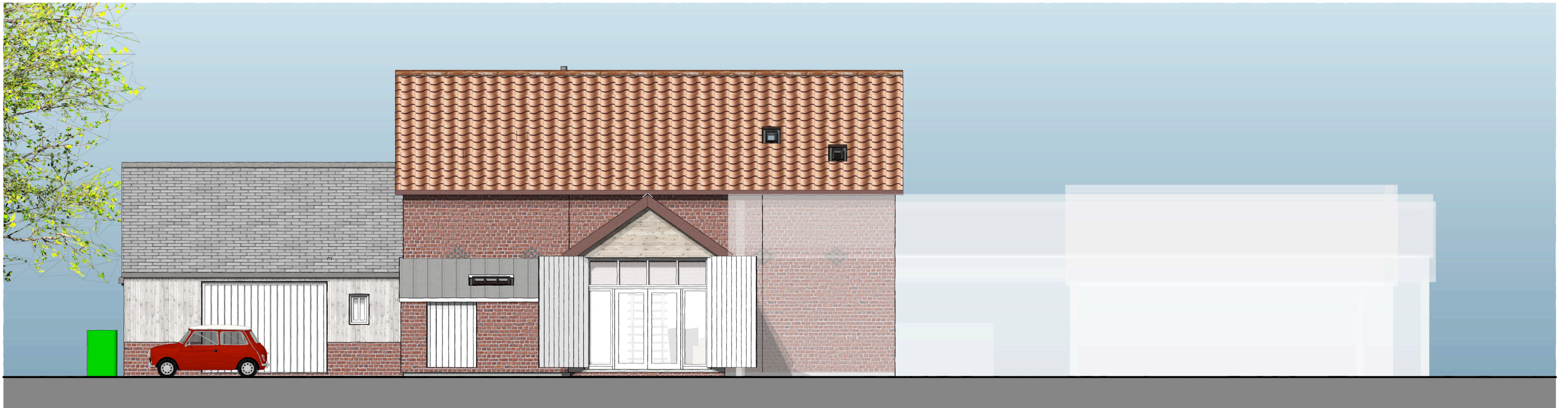
North Elevation Proposed Elevations (Buildings Retained shaded)