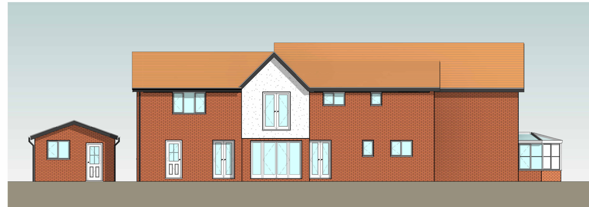
Rear Elevation - Proposed 1 : 100