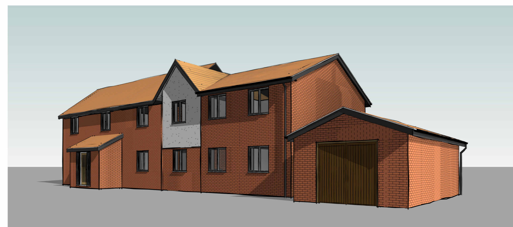
3D View 2