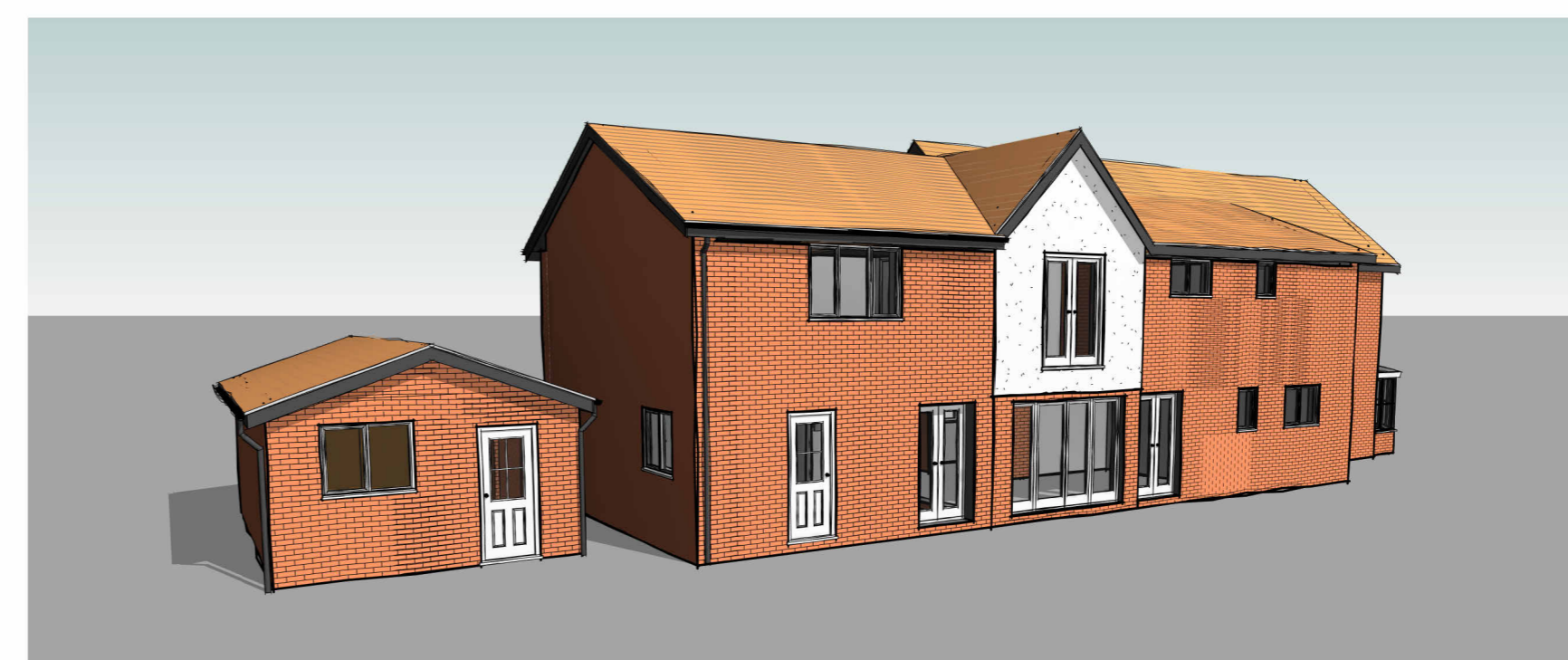
3D View 3

Revision: _____ Project: _____ The Carlings, Church Street, Worlingworth, Woodbridge, Suffolk, IP13 7NT Client: _____ Scott Sharp Drawing Title: _____ Proposed Plans Project Ref / Drawing No: _____ PP002 Scale: _____ Date: _____ Drawn: _____ 1 : 100 @A1 18.08.2022 RF