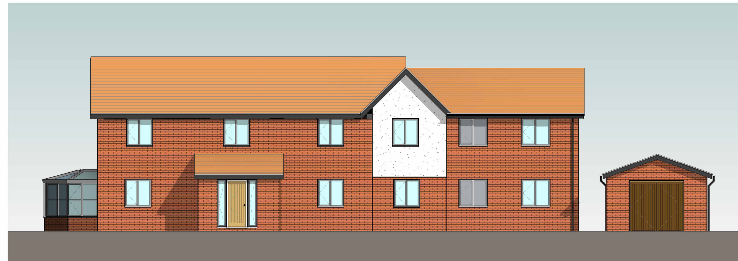
Front Elevation - Proposed 1 : 100