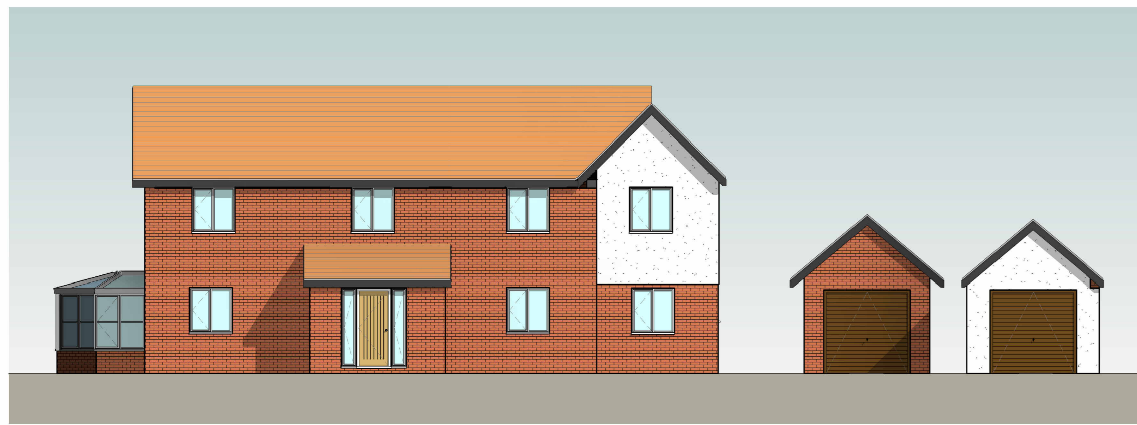
Front Elevation - Existing 1 : 100