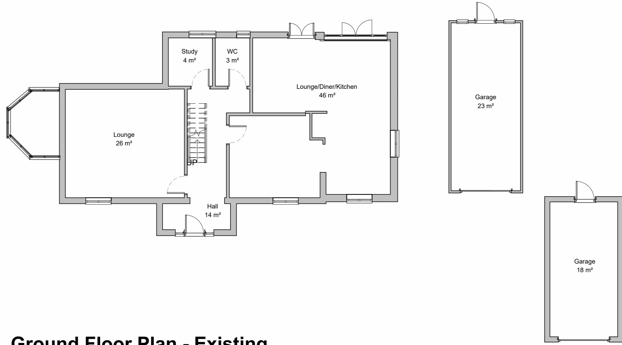
Ground Floor Plan - Existing 1 : 100