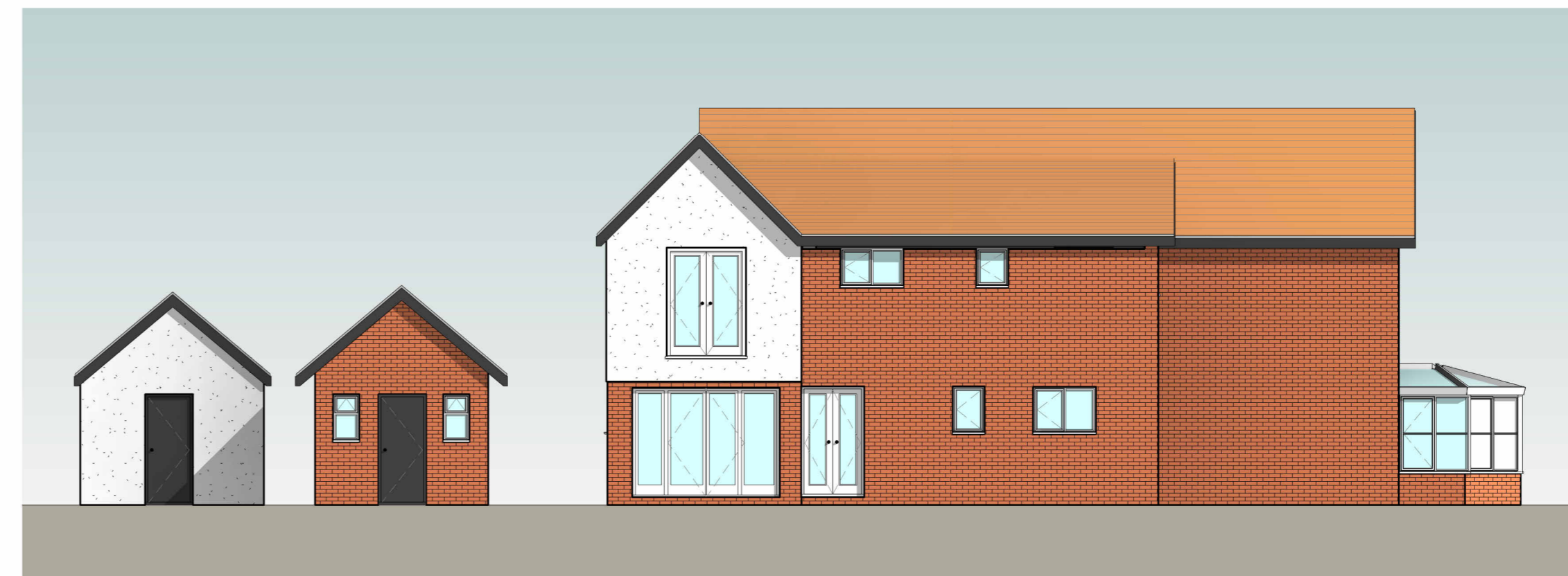
Rear Elevation - Existing 1 : 100