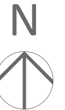
Plan Extract 1:200

Location of trenches shown dashed, dug 700mm deep with water + electrical ducting installed (see photo sheets)