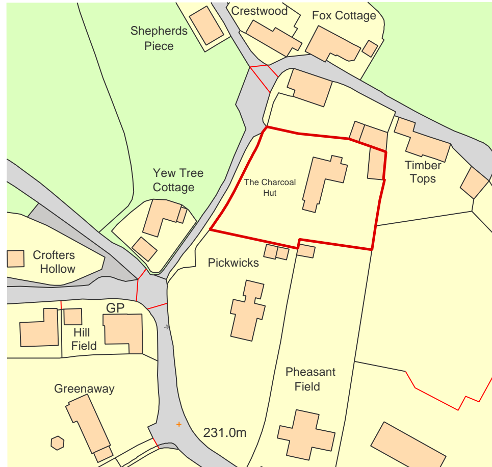
License number 0100031673

NOTES: 1) Responsibility is not accepted for errors made by others in scaling from this drawing. All construction information should be taken from figured dimensions only. 2) All dimensions to be checked on site. 3) Unless otherwise stated dimensions are in millimetres. 4) Drawings to be read in conjunction with all other project drawings. 5) Copyright Sense Architects.