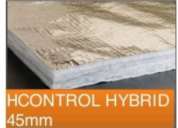
HCONTROL HYBRID 45mm