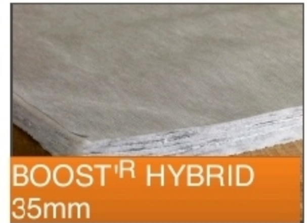
BOOST'R HYBRID 35mm