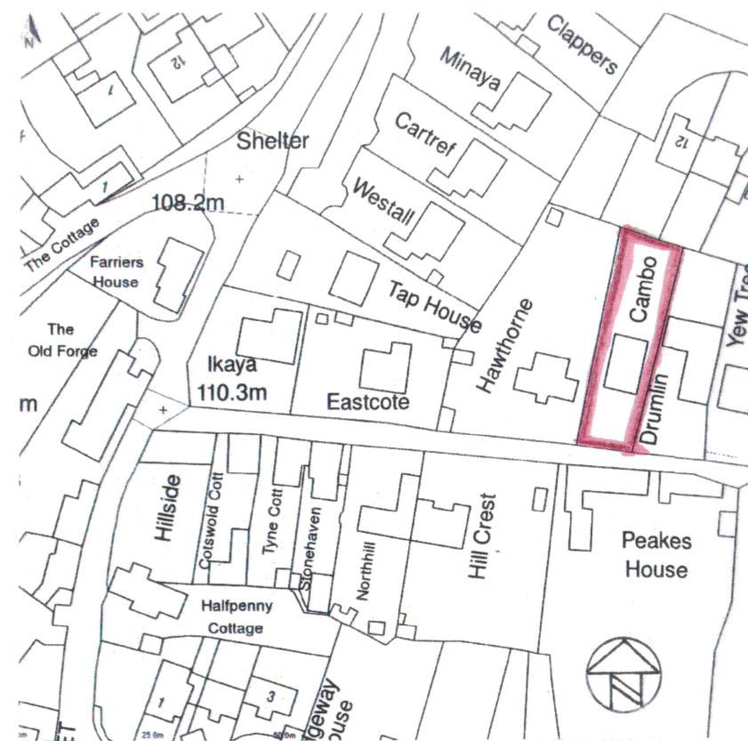
SITE LOCATION PLAN 1:1250 AT A3 SHEET SIZE