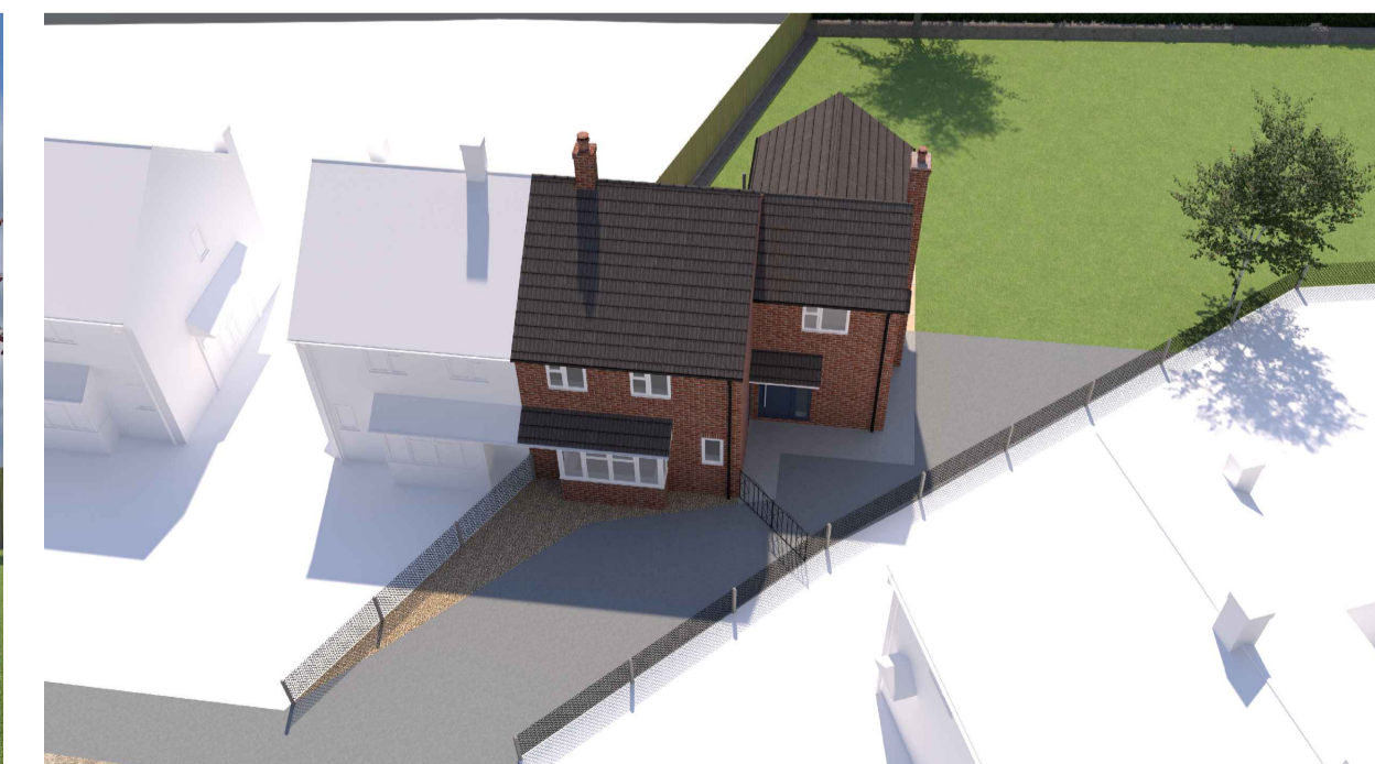
Proposed Visuals (n.t.s)