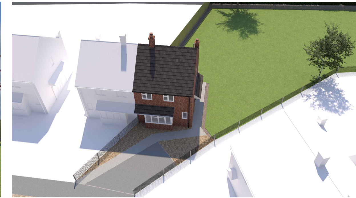
Existing Visuals (n.t.s)