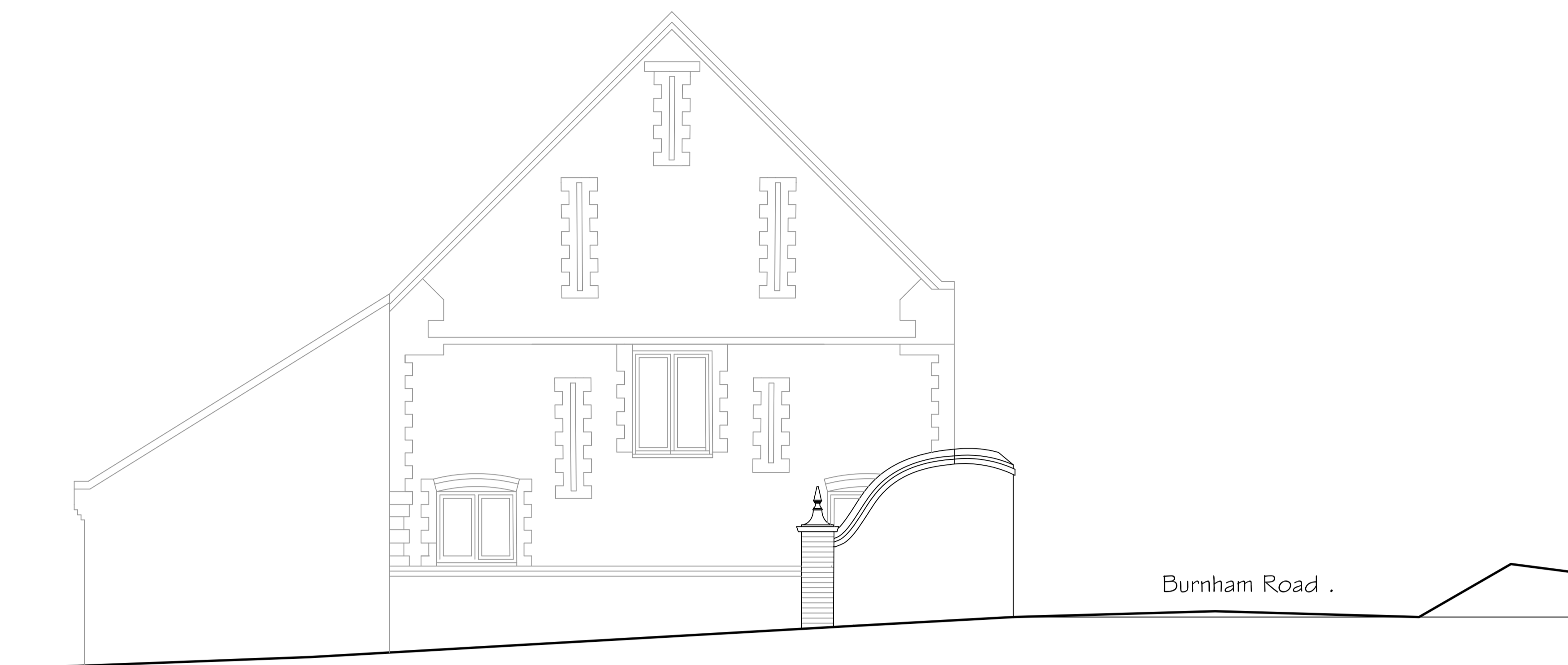
South Elevation through access towards converted barns 1:50 As Existing

Notes 1. The copyright of this drawing is the property of Ian H Bix Associates Ltd and must not be copied without their consent. 2. Measurements to be checked on site by the Contractors prior to commencement of works and any discrepancies brought to the attention of the Designer.