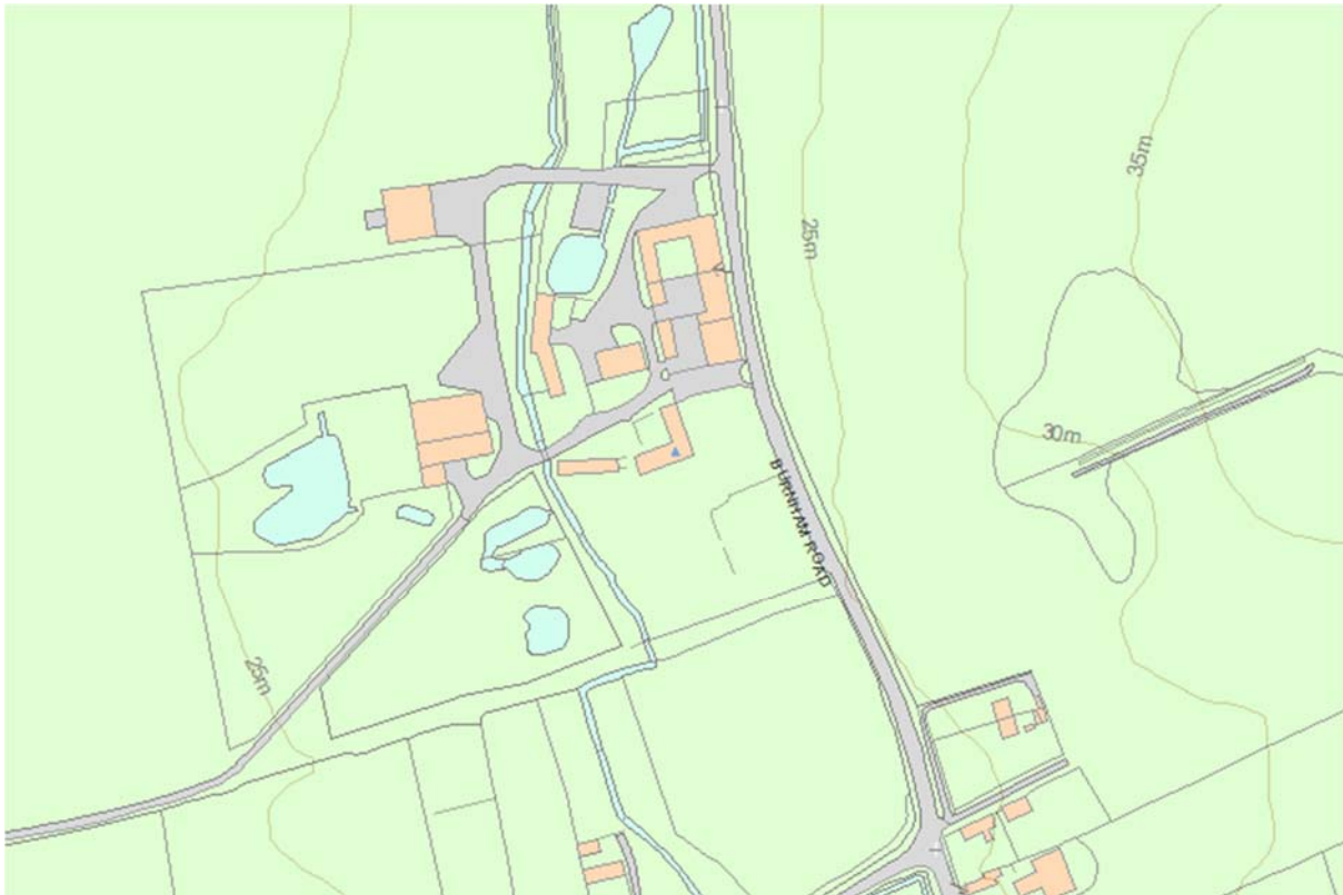
Map of the site from list description – Historic England website.

Relevant local and national planning policy and guidance:-