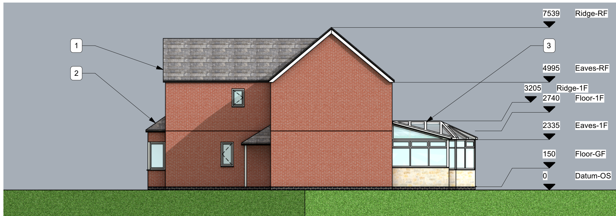
1 North Elevation - Existing Scale: 1:100