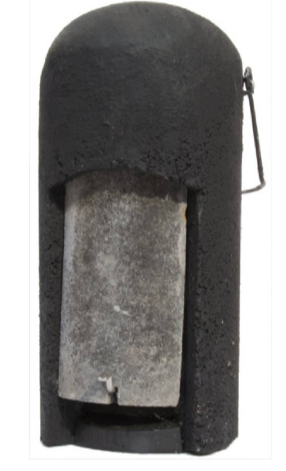
Schwegler 3FN small batt box