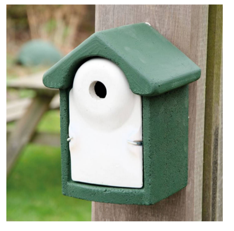
NATIONAL TRUST WOODSTONE 28mm NEST BOX - GREEN