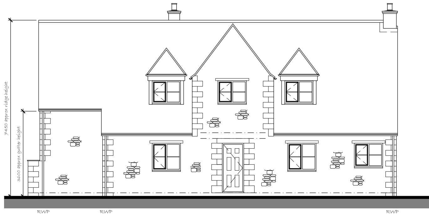
Front Elevation (west) @ 1:100