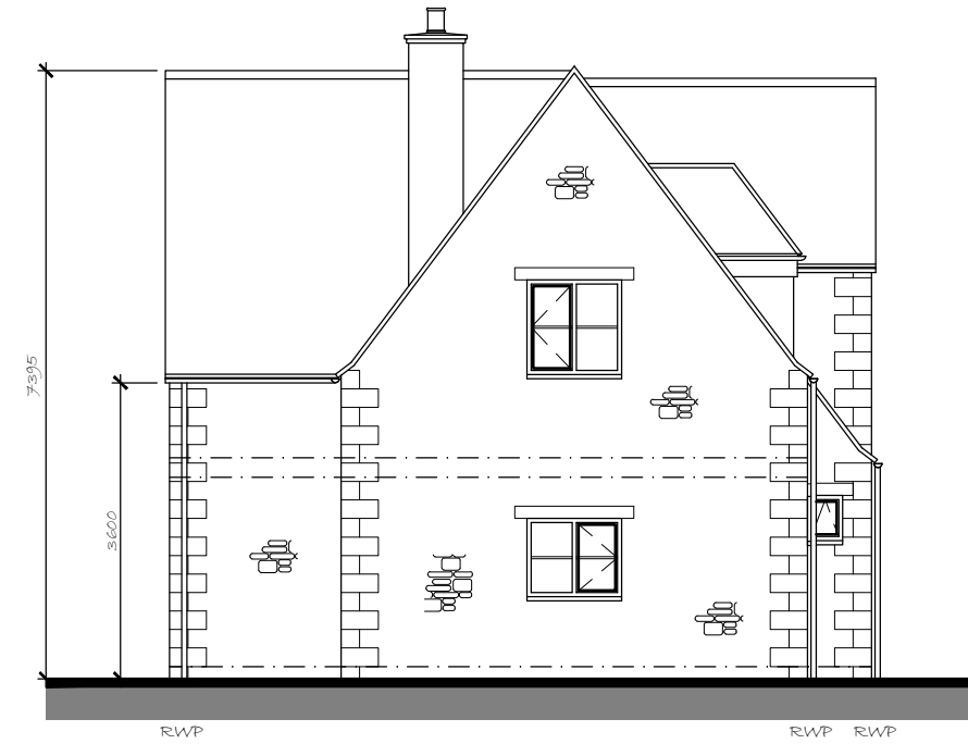
Side Elevation (north) @ 1:100