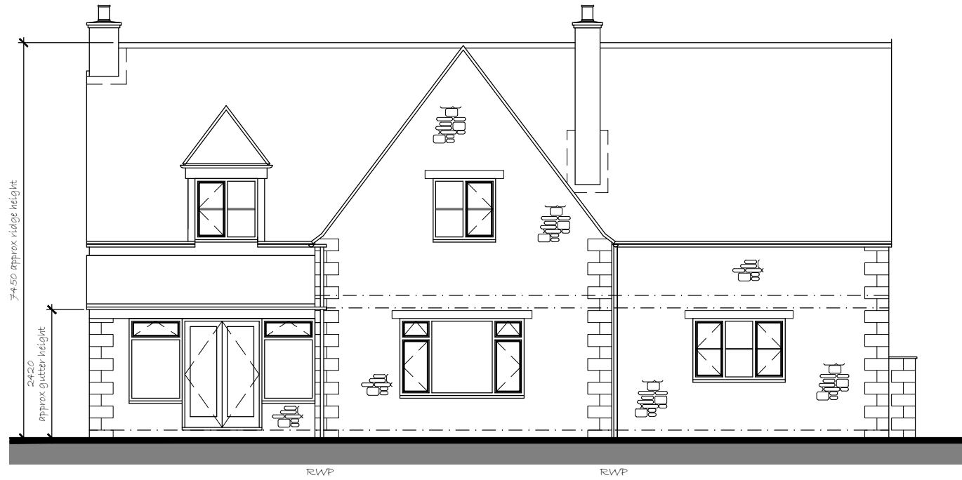
Rear Elevation (east) @ 1:100

NOTES: Dimensions and levels to be verified on site by the contractor. Any discrepancies are to be notified immediately. Copyright is reserved by Belvoir Architecture and the drawing is issued on the condition that it is not copied, reproduced, retained or disclosed to any unauthorised person, either wholly or in part without consent. If in doubt, ask.