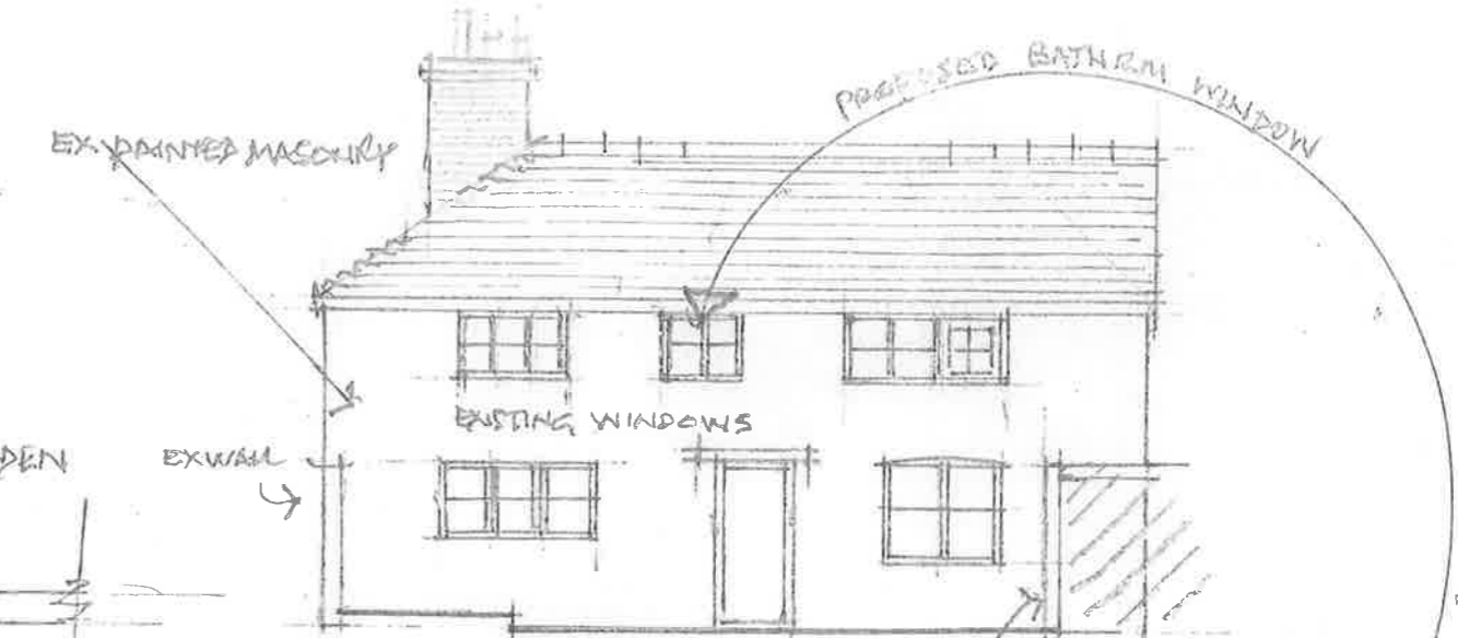
REAR ELEVATION [NORTH] SCALE: 1:100