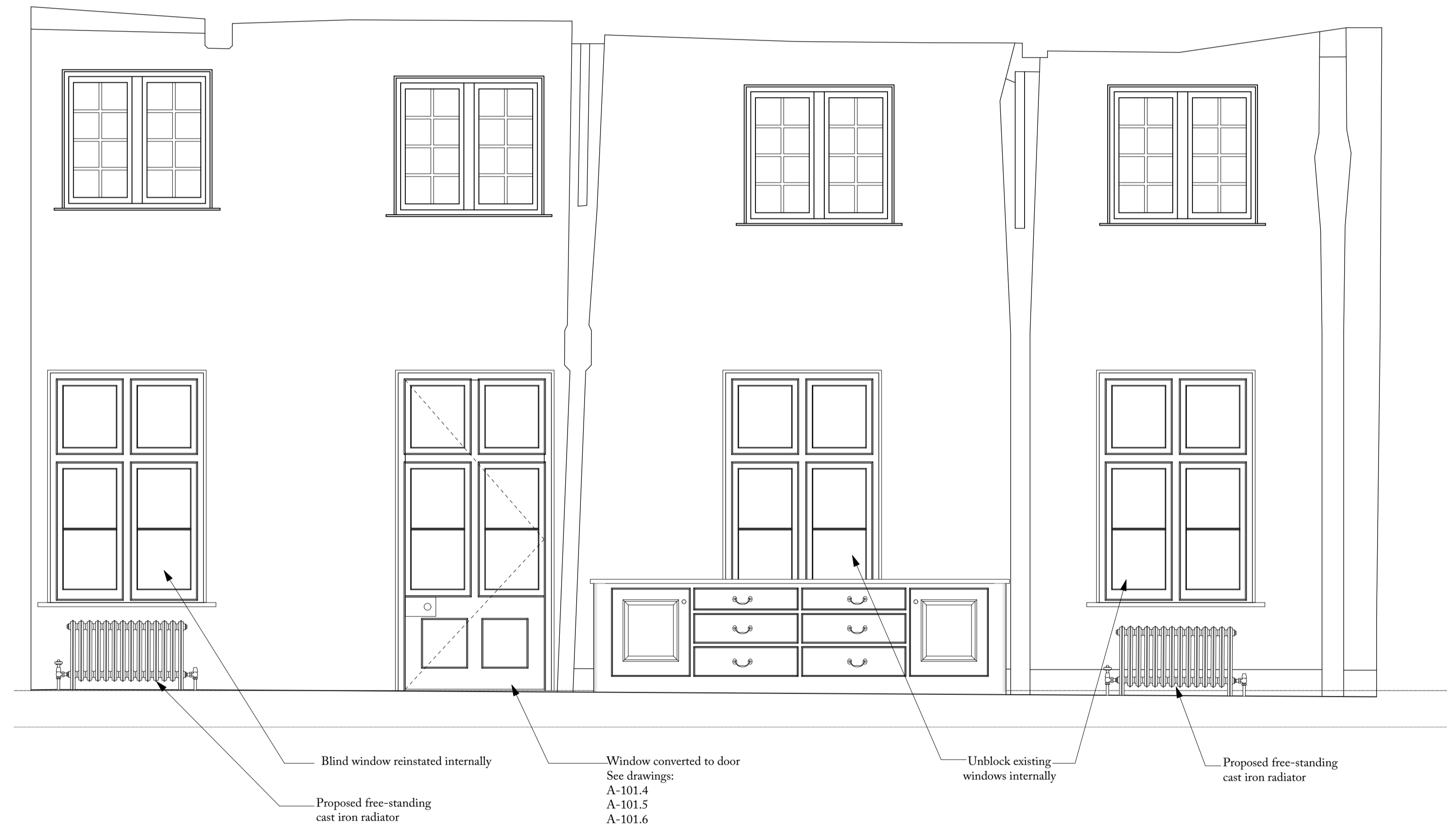
2 WEST ELEVATION