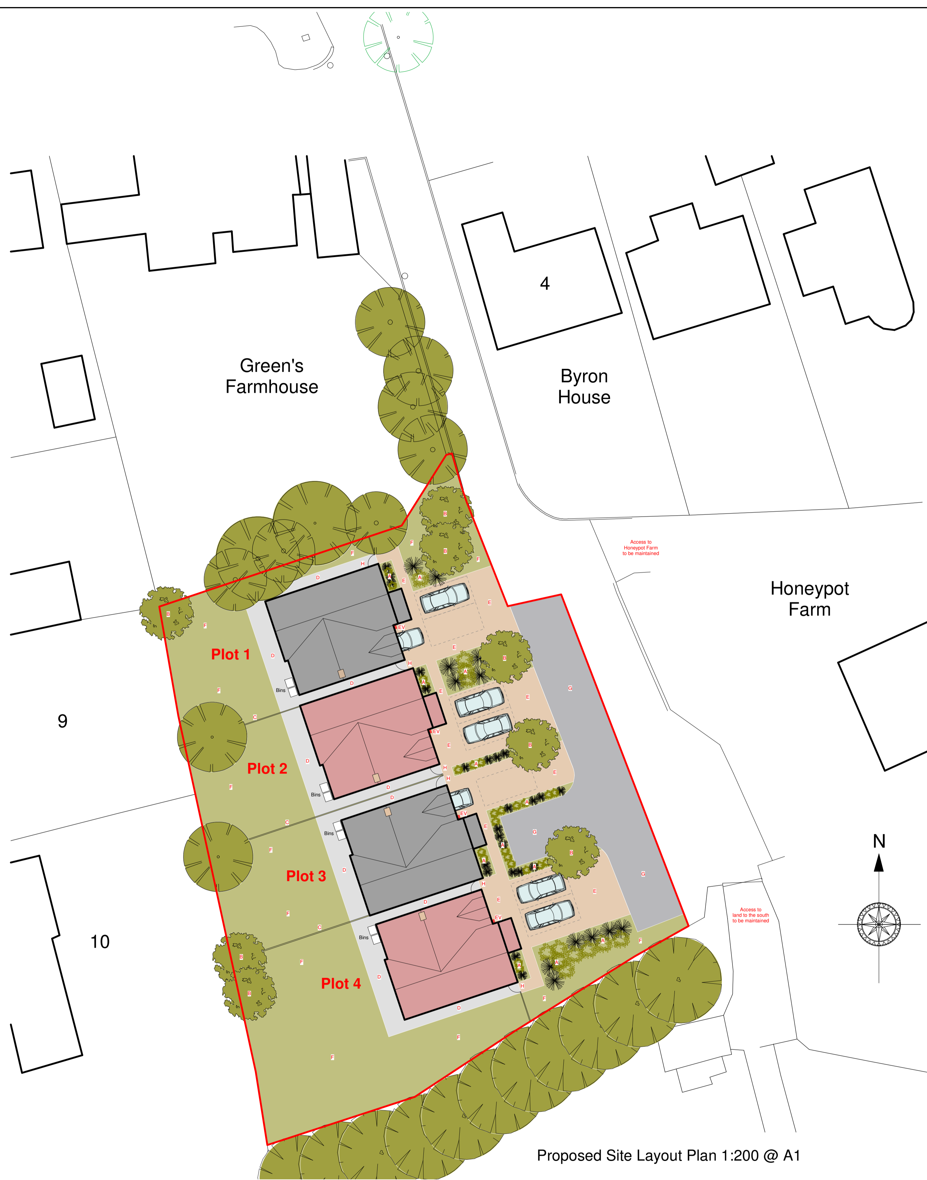
Proposed Site Layout Plan 1:200 @ A1