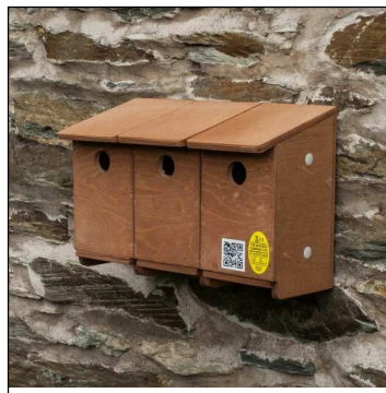
Sparrow Terrace Nest Box 376mm wide x 240mm high x 170mm deep