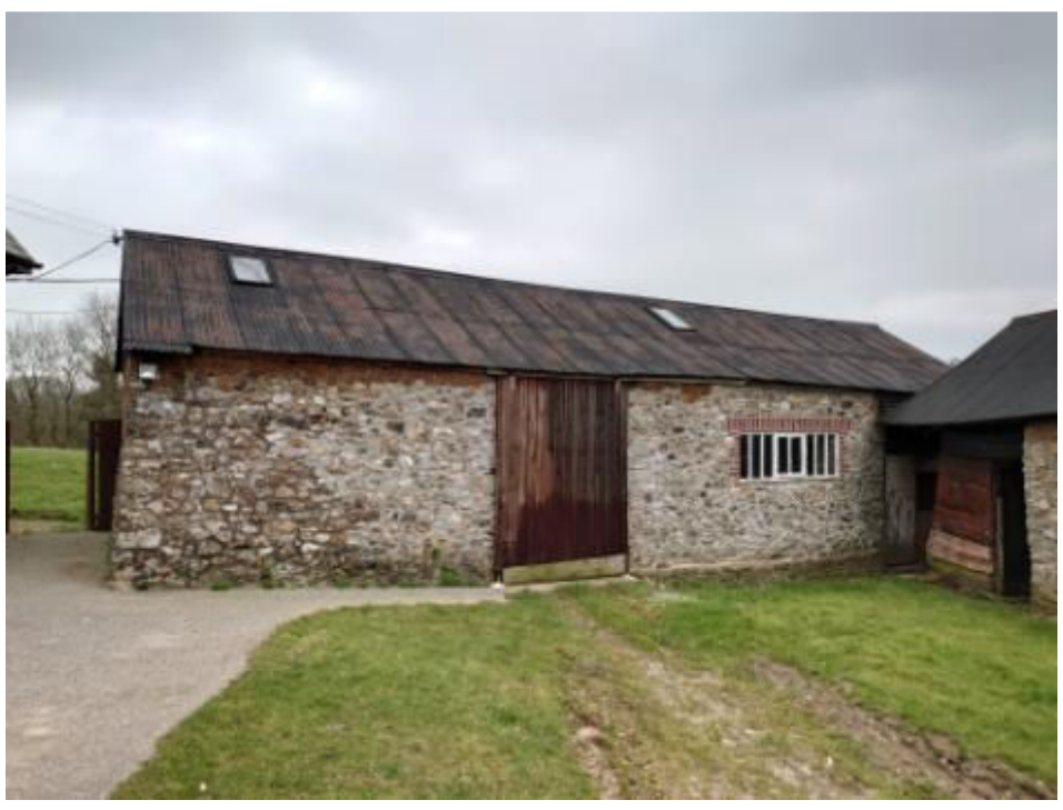
Fig.3 – Site Photo – View of NE barn from within courtyard.