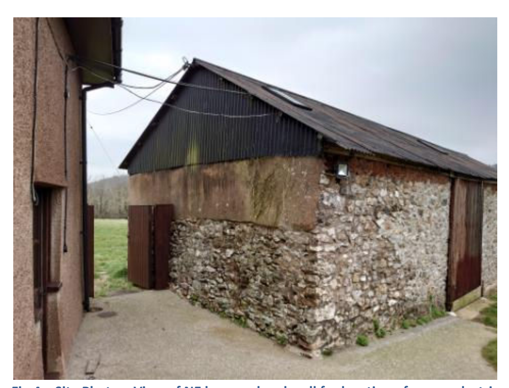
Fig.4 – Site Photo – View of NE barn and end wall for location of new pedestrian access door into proposed pump room.