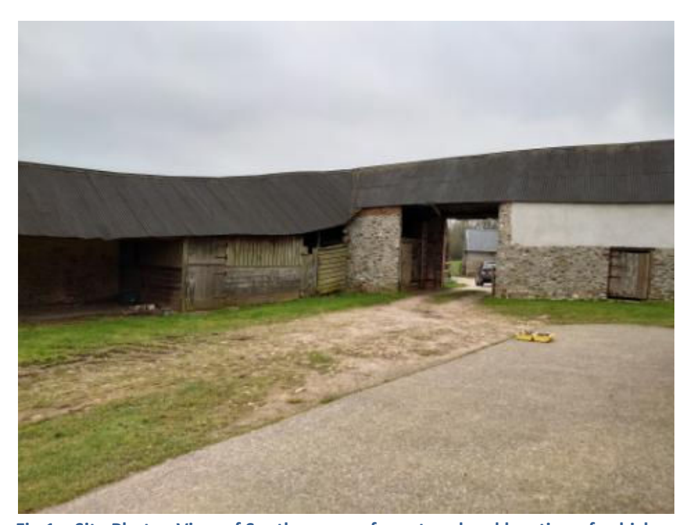
Fig.1 – Site Photo –View of South corner of courtyard and location of vehicle access.