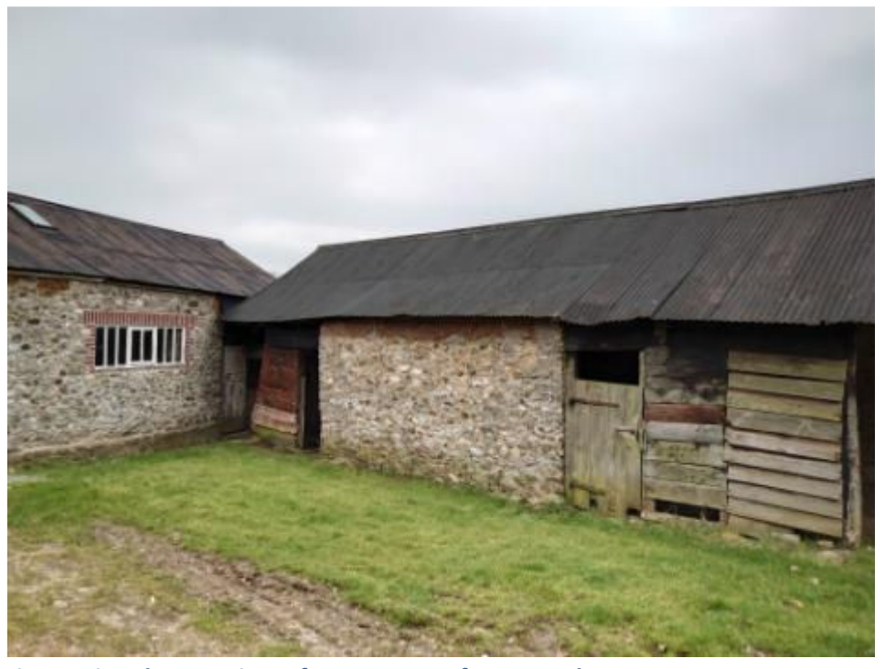
Fig.2 – Site Photo – View of East corner of courtyard.