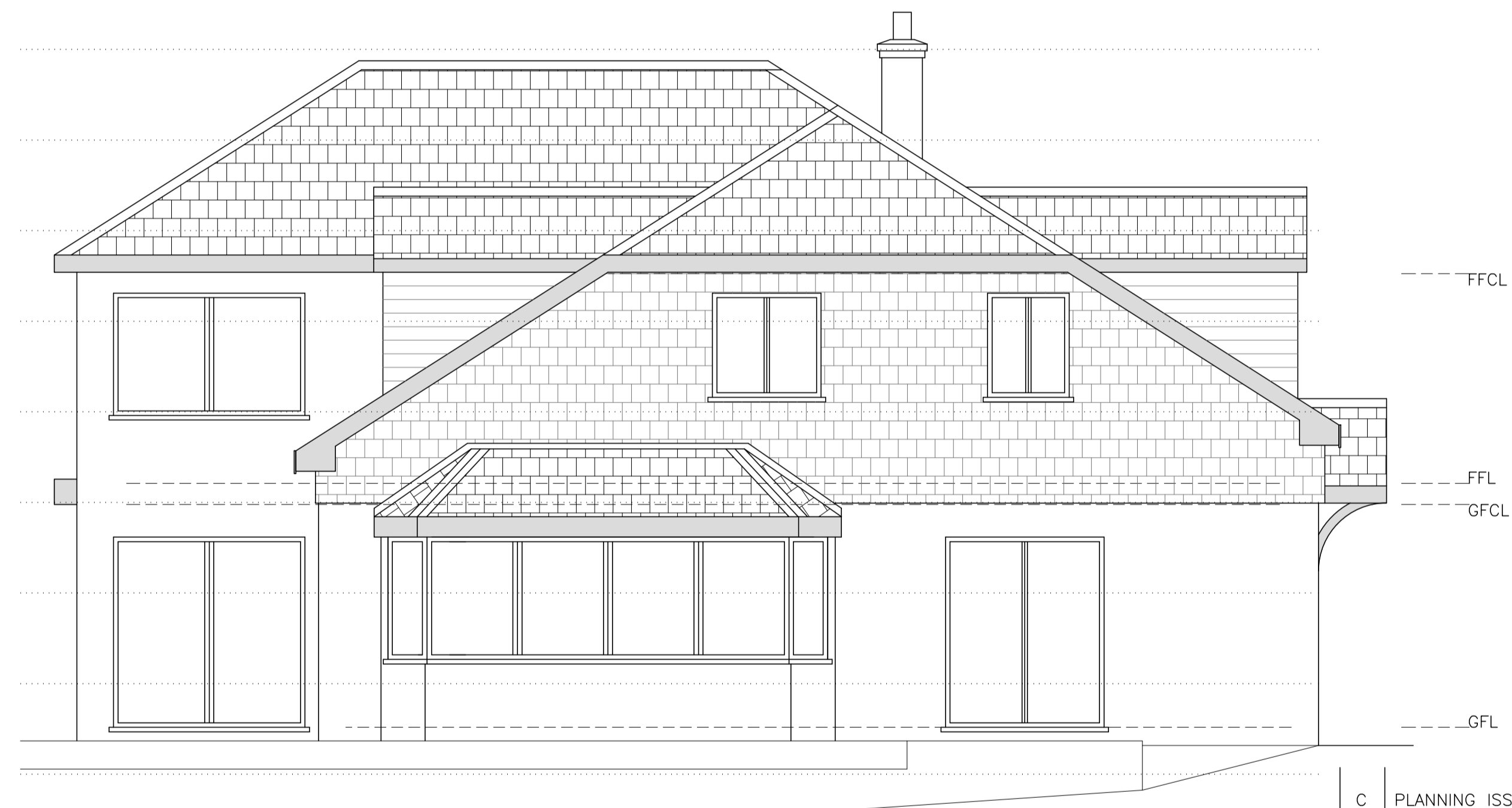
SOUTH WEST ELEVATION 1:50