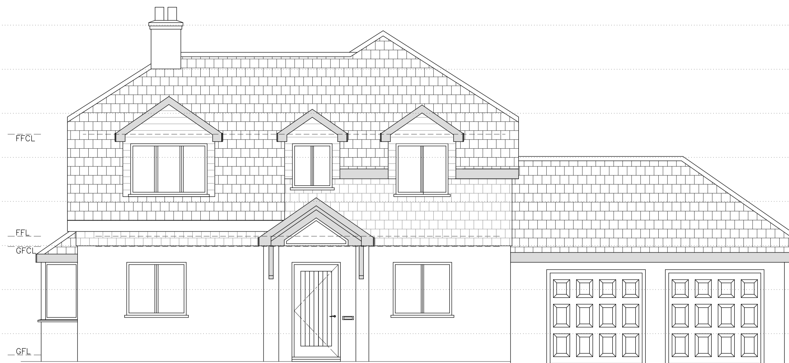
SOUTH EAST ELEVATION 1:50