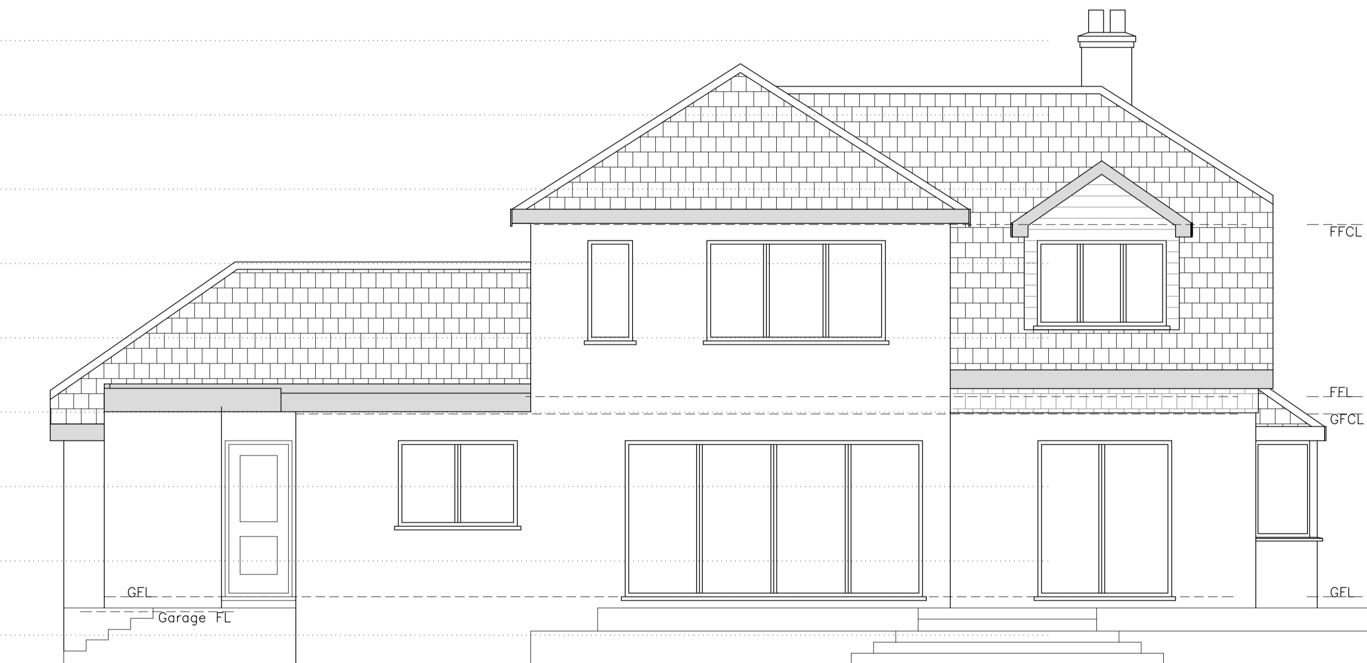
NORTH WEST ELEVATION 1:50