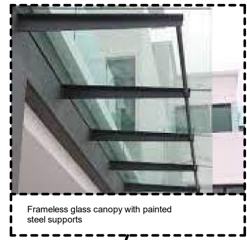
Frameless glass canopy with painted steel supports