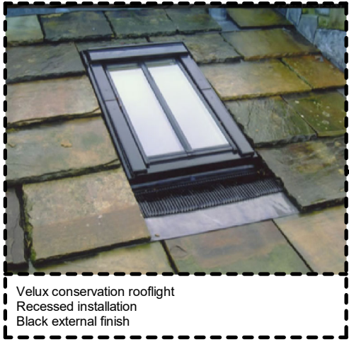
Velux conservation rooflight Recessed installation Black external finish