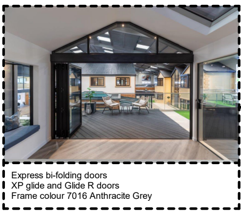
Express bi-folding doors XP glide and Glide R doors Frame colour 7016 Anthracite Grey