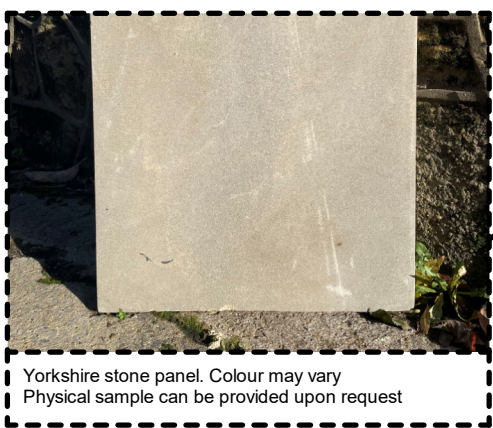
Yorkshire stone panel. Colour may vary Physical sample can be provided upon request