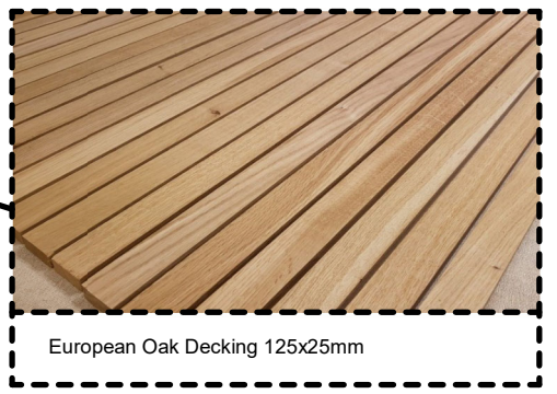
European Oak Decking 125x25mm