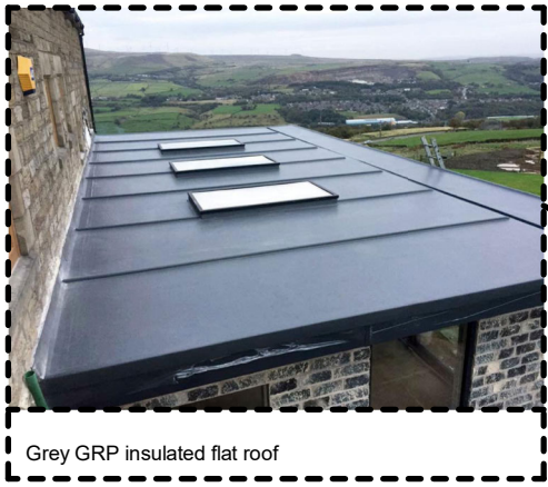
Grey GRP insulated flat roof