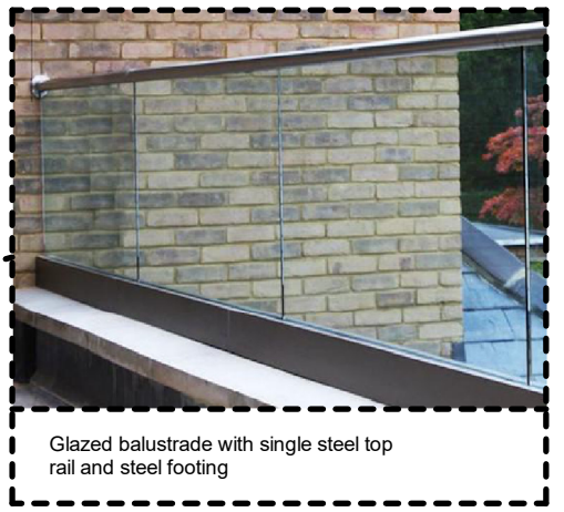
Glazed balustrade with single steel top rail and steel footing