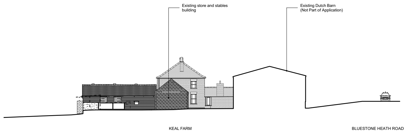
1 EXISTING EAST ELEVATION 01 1:200 (A1) / 1:400 (A3)