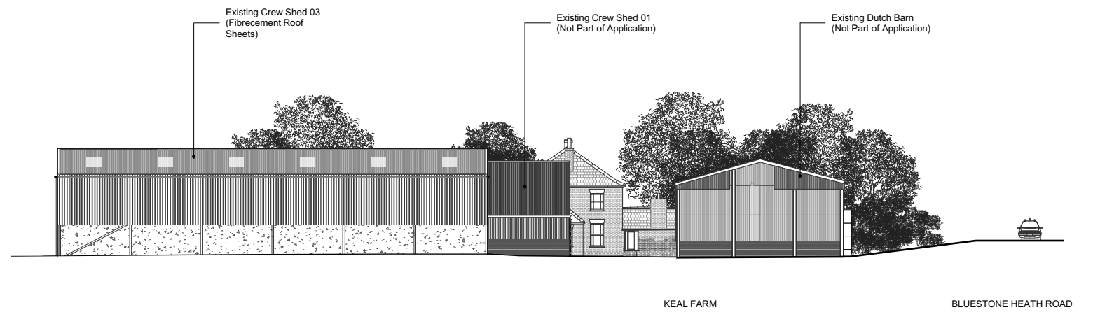
2 EXISTING EAST ELEVATION 02 1:200 (A1) / 1:400 (A3)