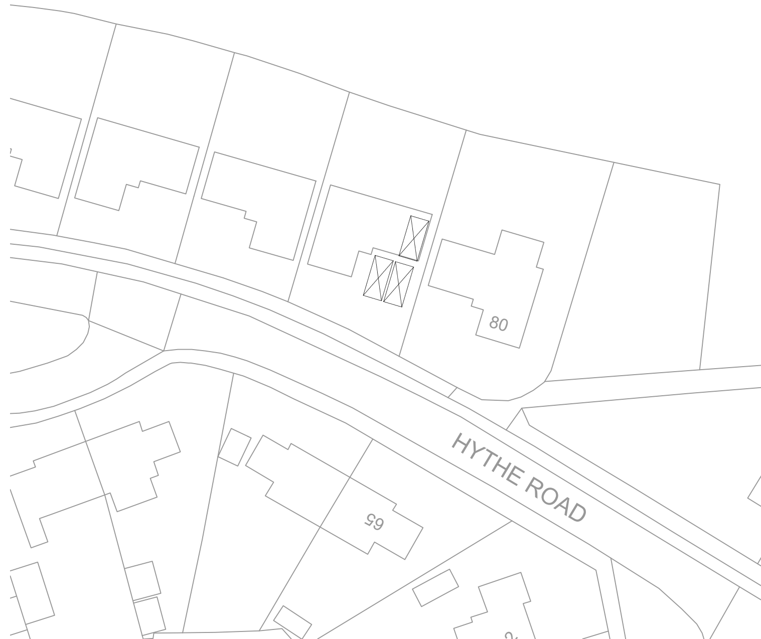
1:500 Proposed Site Plan