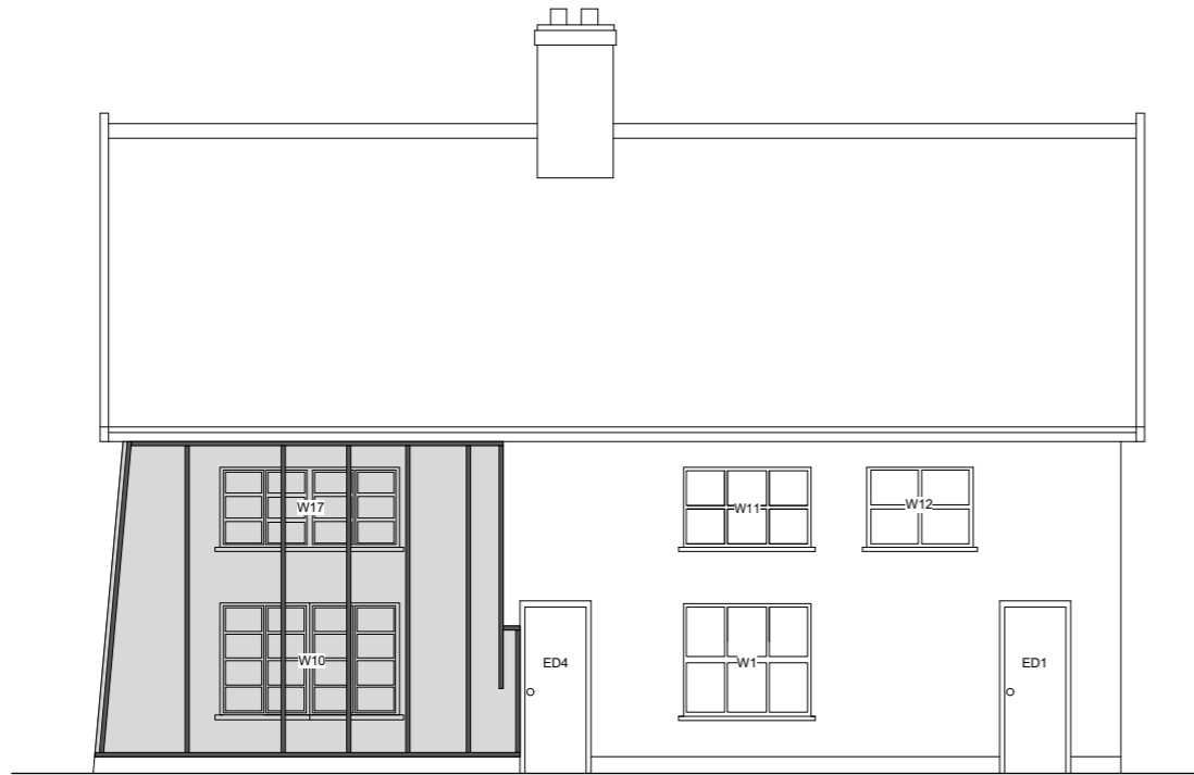
FRONT ELEVATION (PORTION IS BOARDED AND COVERED)