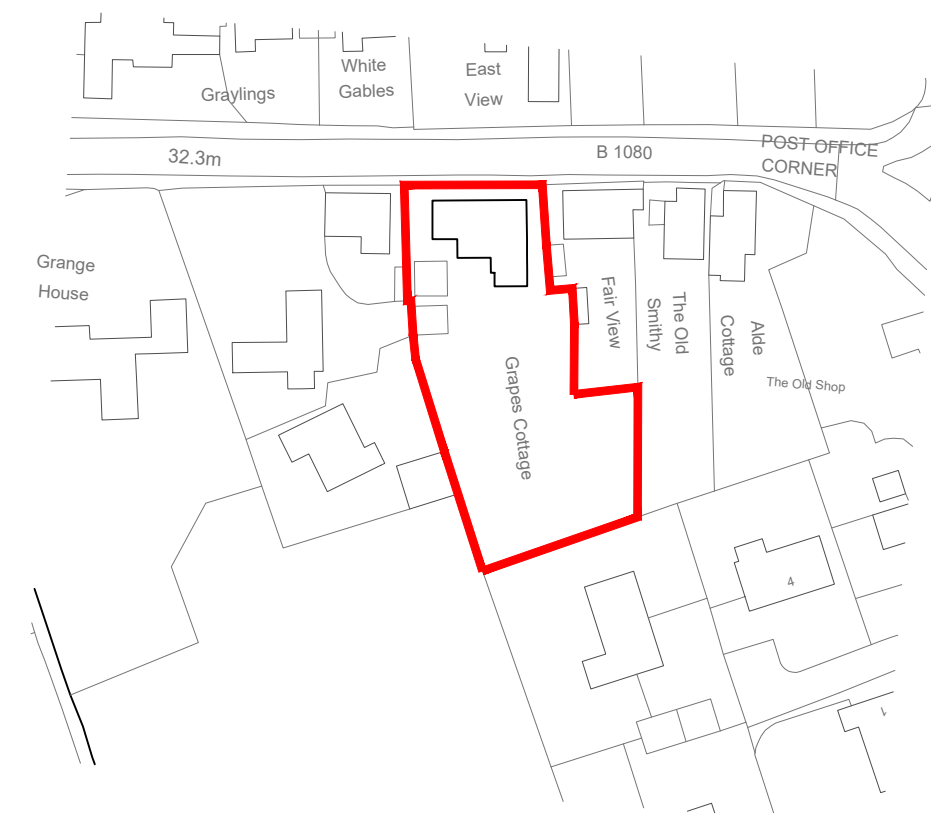
Site Location Plan Scale 1:1250