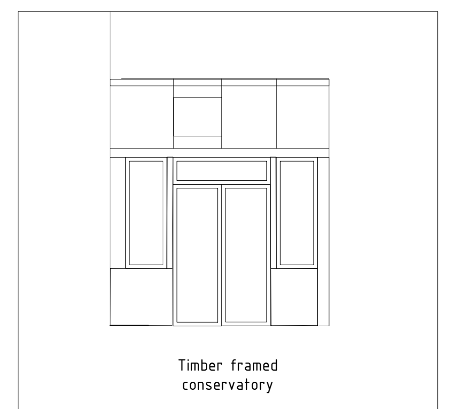
Timber framed conservatory