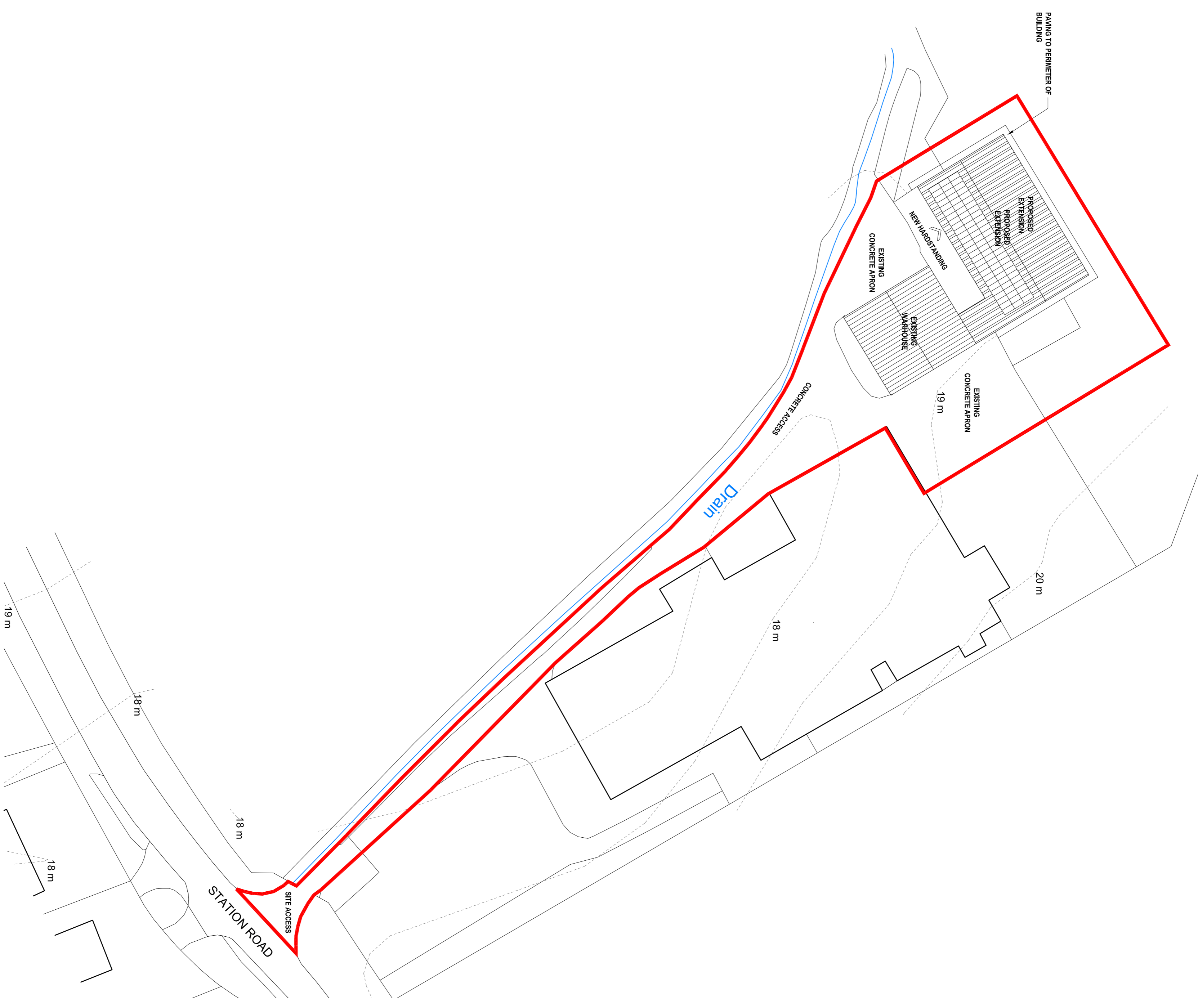
PROPOSED BLOCK PLAN Scale - 1:500