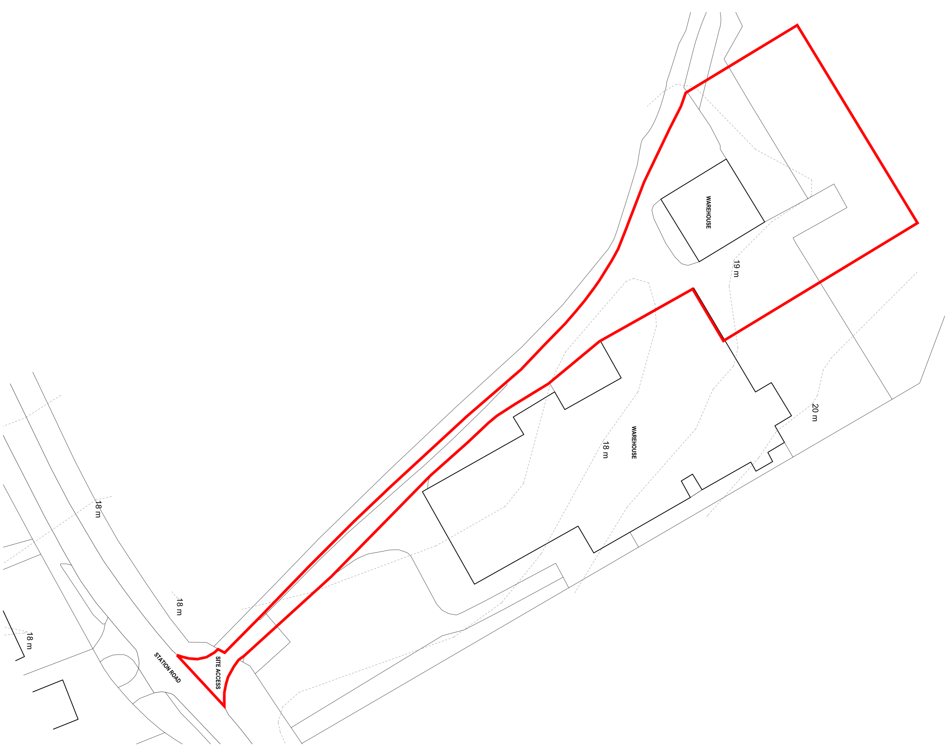
EXISTING BLOCK PLAN Scale - 1:500