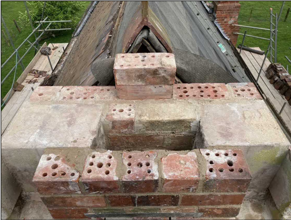
Photograph 3: Representative image showing the bat feature being constructed within the bell tower (April 2022).

In April 2022 the brickwork associated with the former bell tower was removed under supervision, no bats were found. The brickwork was repaired and a bat roost feature with access point was incorporated within the new brickwork. See images below;