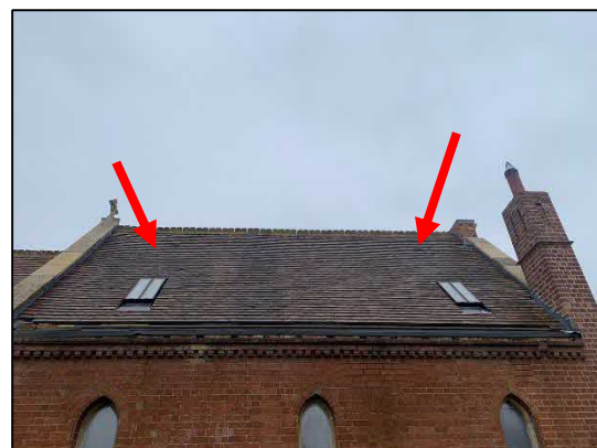
Photograph 2: Representative image showing the location of bat access points (front elevation).