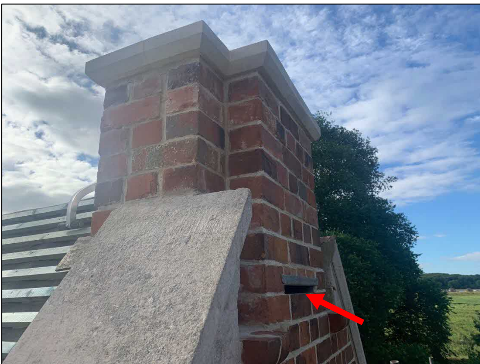
Photograph 4: Representative image showing the completed bat feature with access point indicated by red arrow (April 2022).