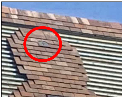
Photograph 1: Representative image showing the installation of bat access points.

Two lead bat access points were installed on the front and rear elevation. The following representative images show the construction and location;