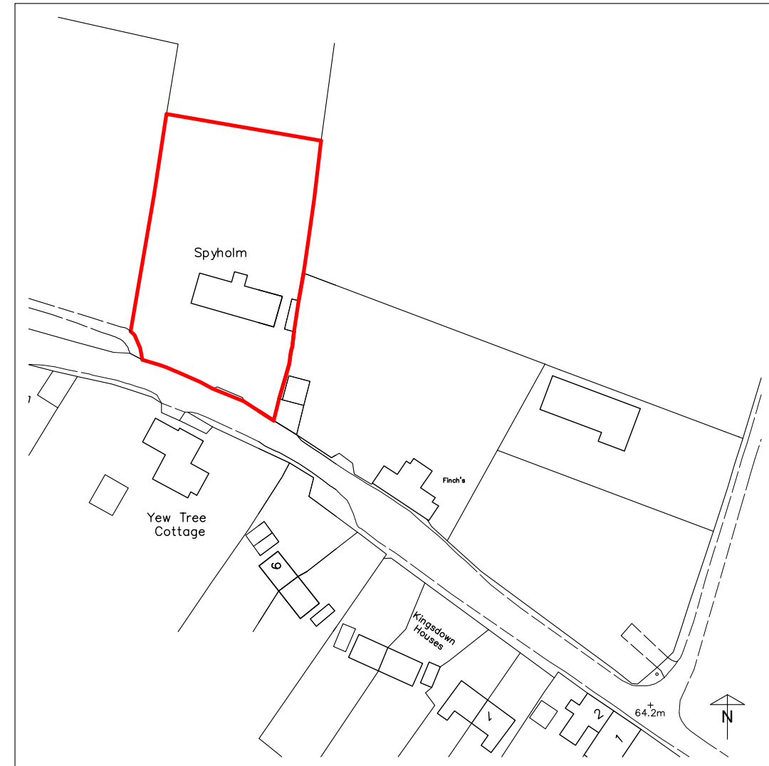
0m 10m 20m 30m 40m SCALE BAR 1:1250