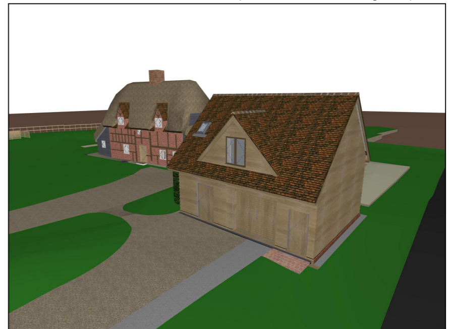
1 Proposed Front View