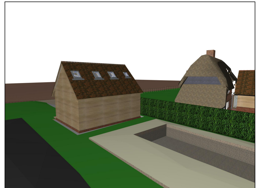
2 Proposed Rear View