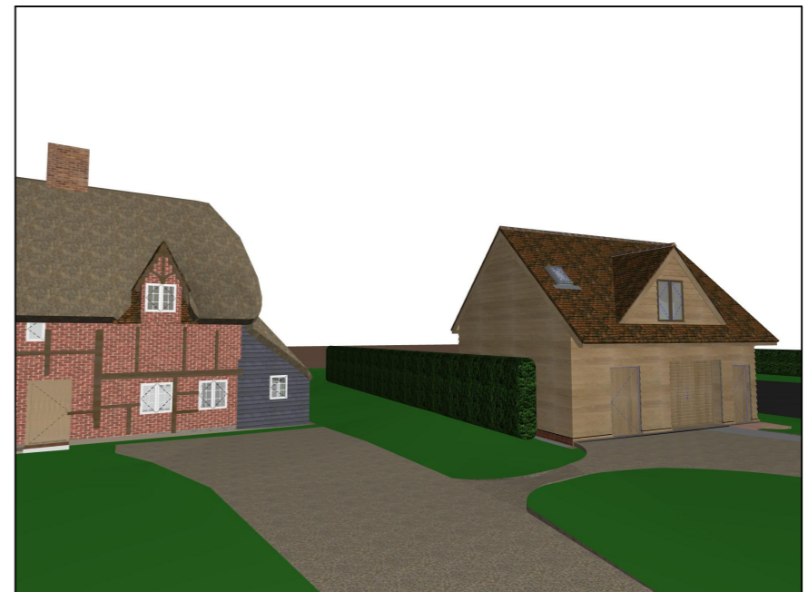
3 Proposed Front View