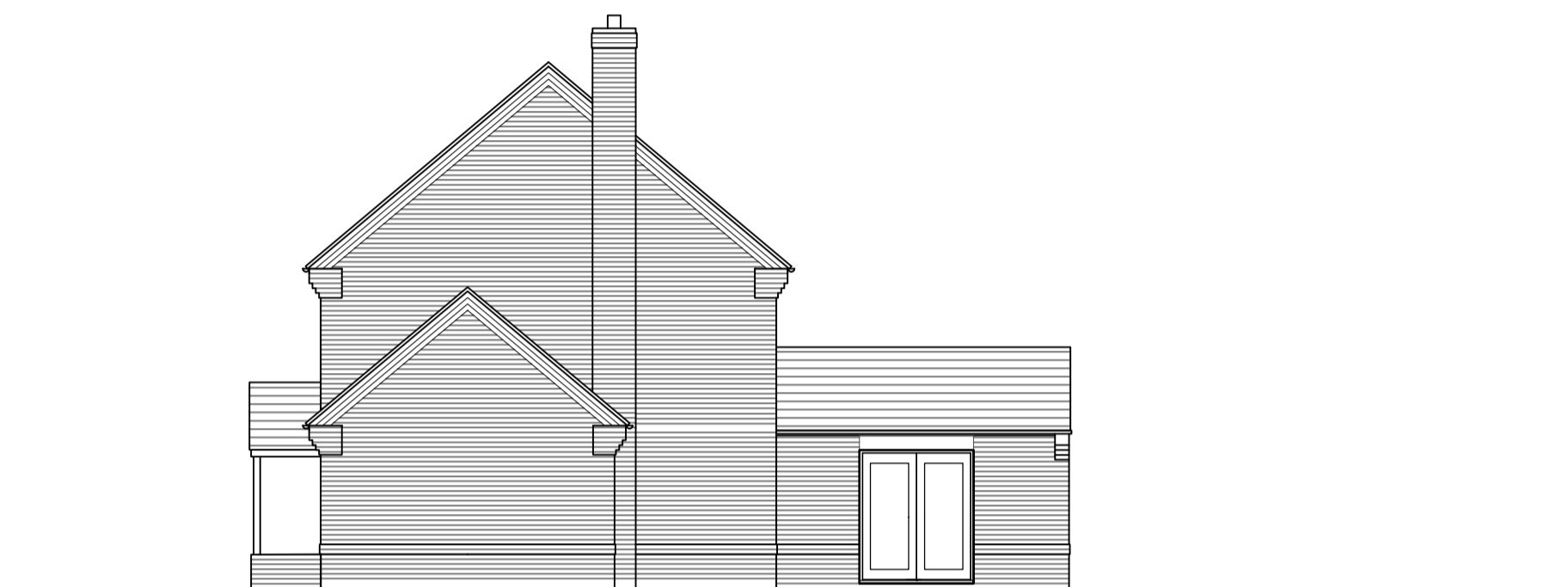
West Elevation Scale - 1:100