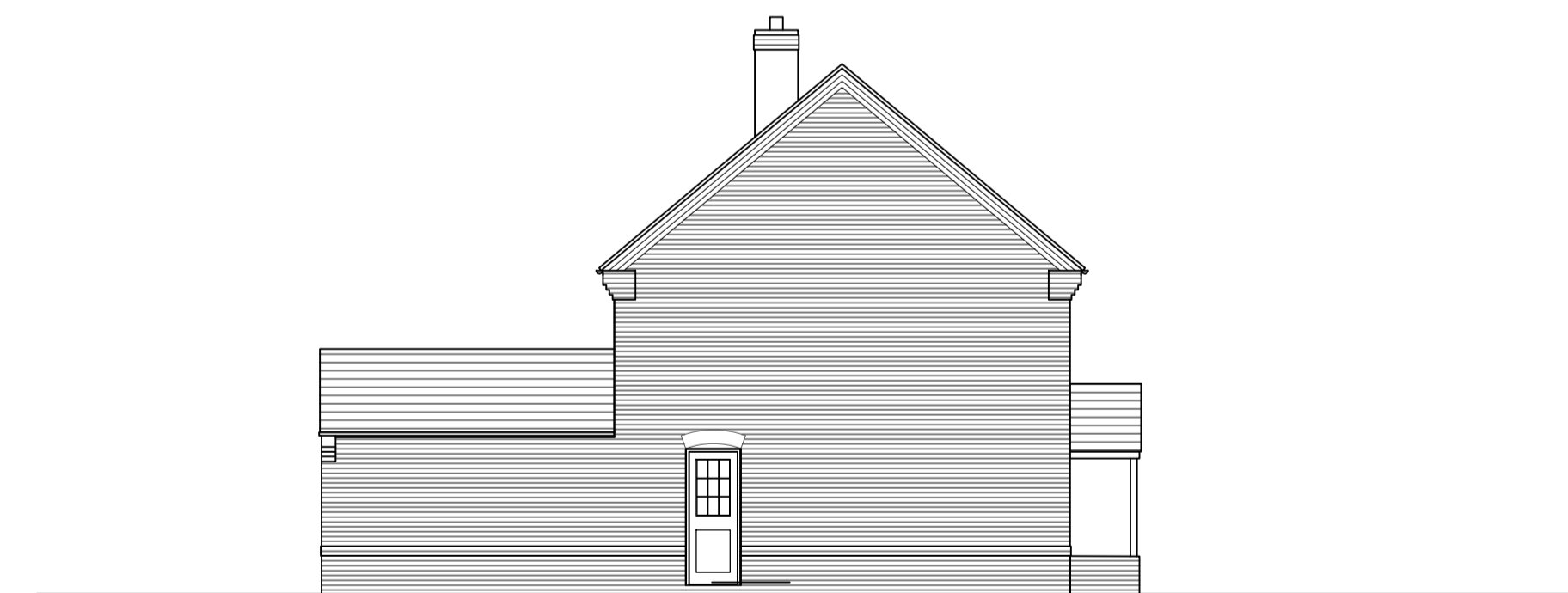
Side Elevation / Section Scale - 1:100