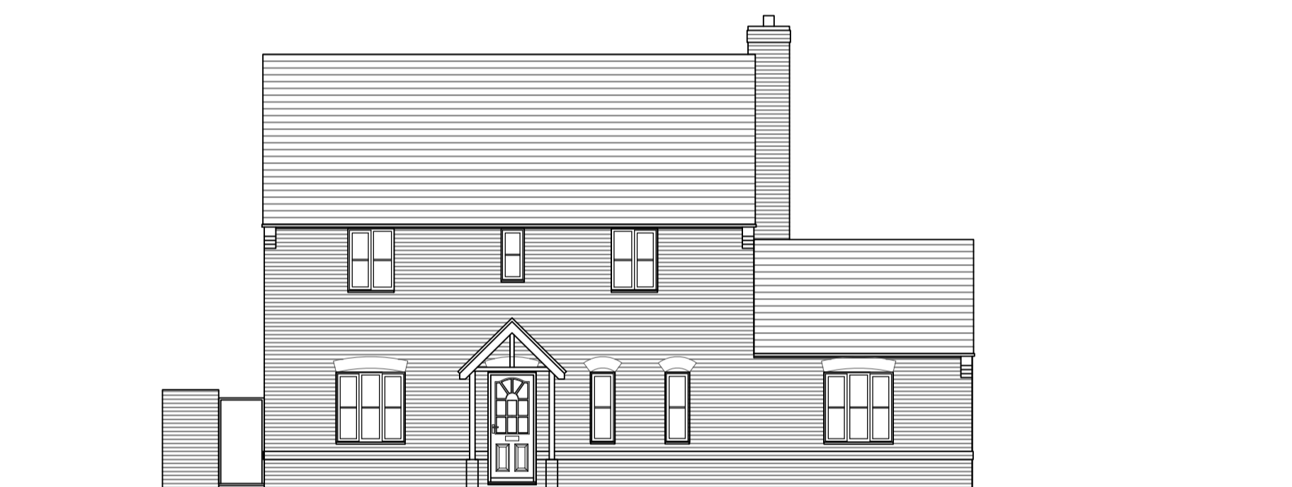
North Elevation Scale - 1:100