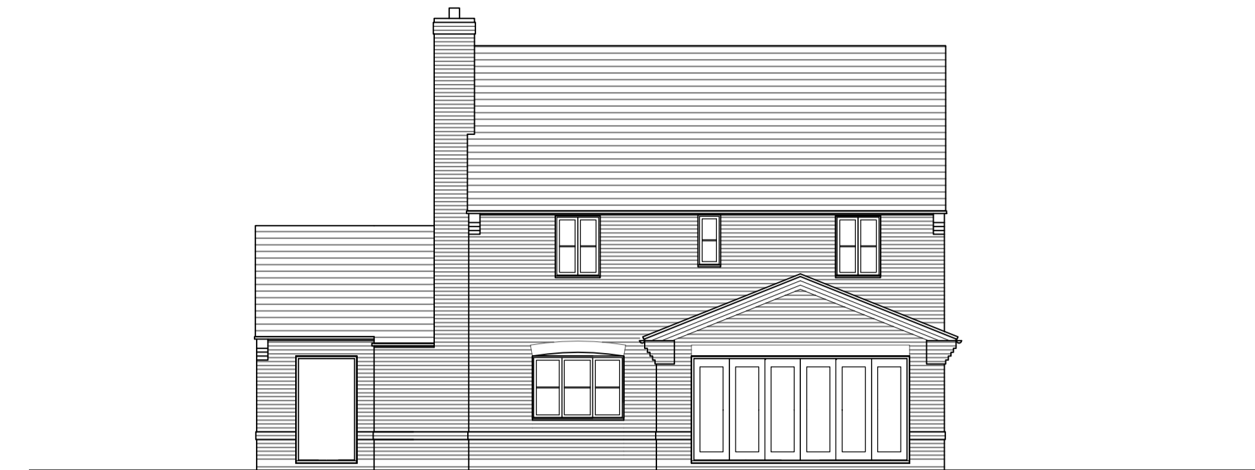
South Elevation Scale - 1:100

Boundary position to be confirmed before any building work is commenced and all landowners concerned are in agreement of location