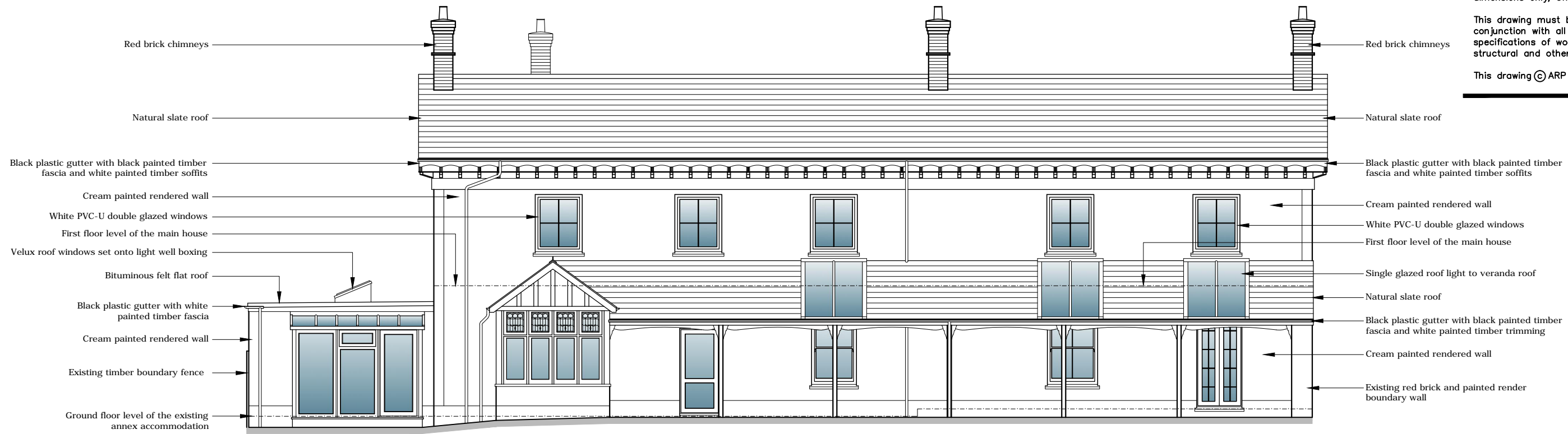
South East Elevation Scale 1:100