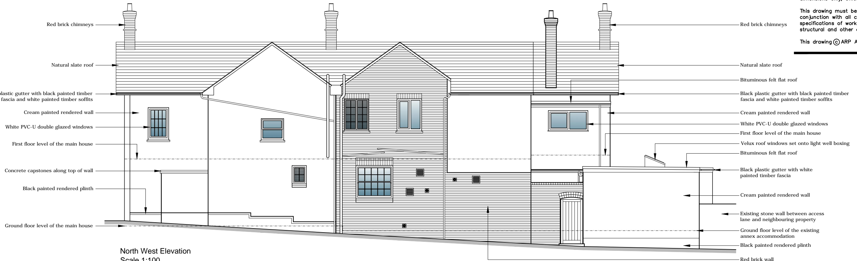
North West Elevation Scale 1:100