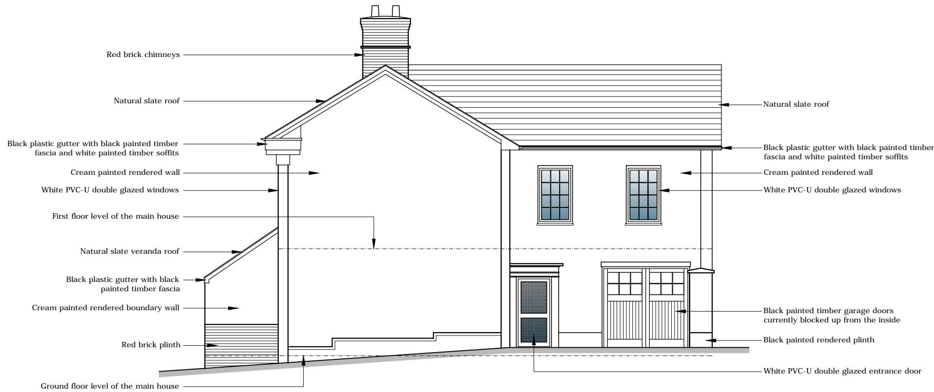
North East Elevation Scale 1:100