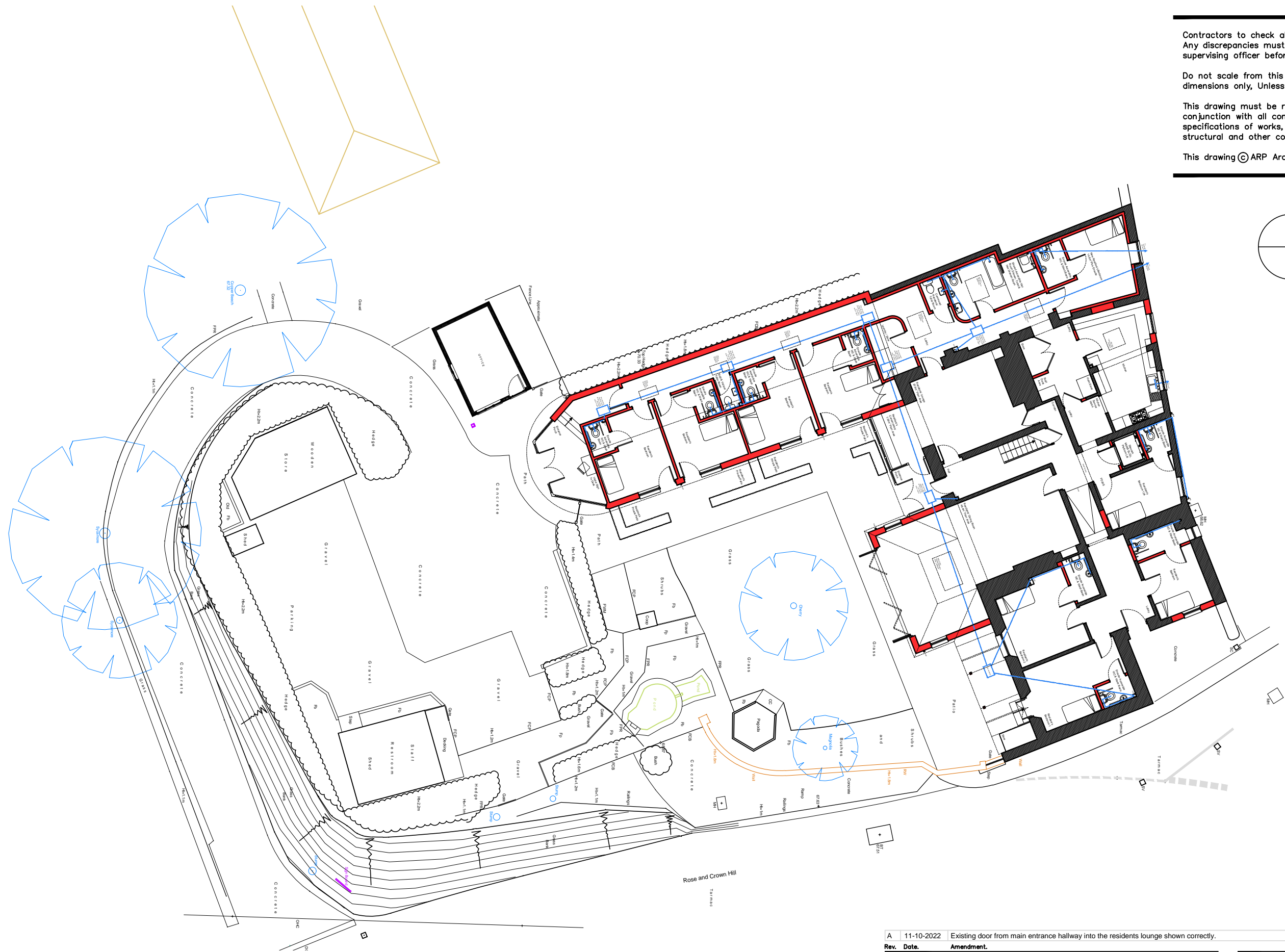
Site And Ground Floor Plan, As Proposed Scale 1:200