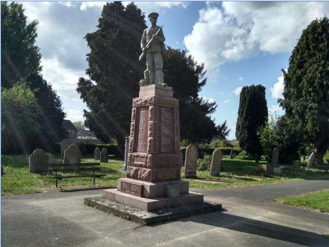
Plate 35: View of the Grade II Listed Walsoken Parish War Memorial (Asset 12), from the southeast