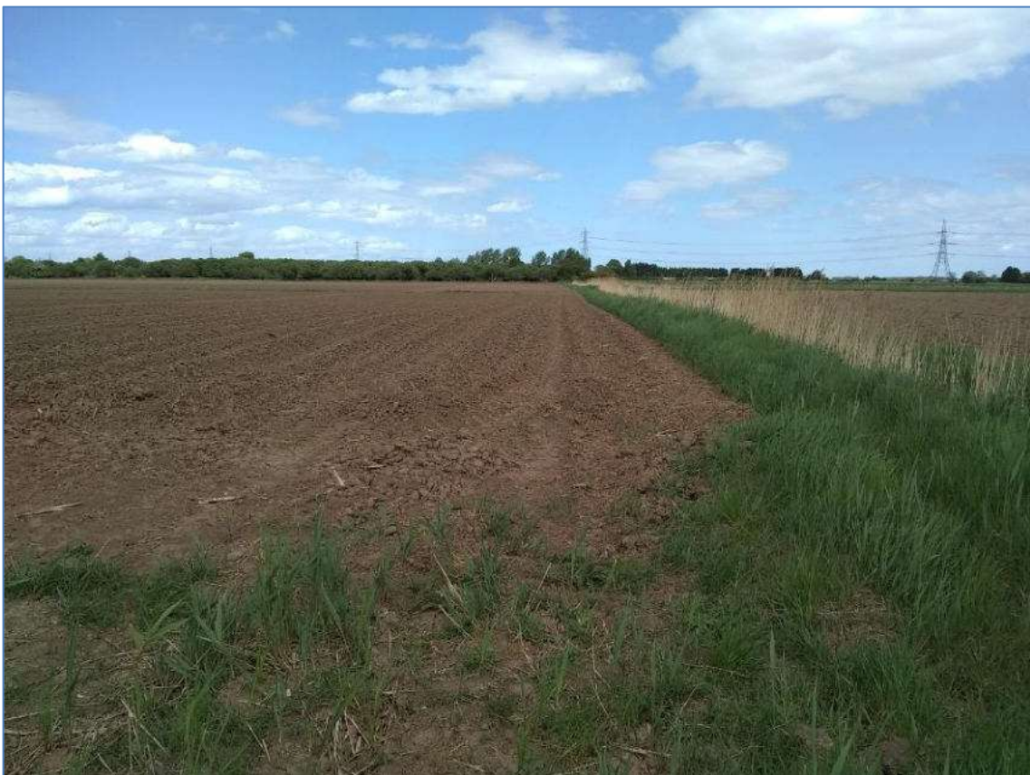
Plate 14: View of the boundary between Field 3 and Field 1, from the southeast