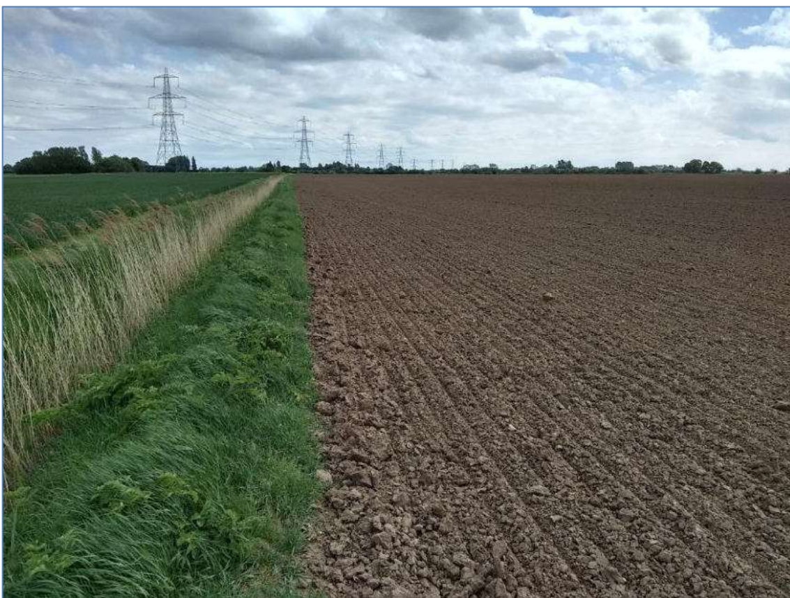
Plate 24: View of Field 5 and its northeastern boundary, from the northwest