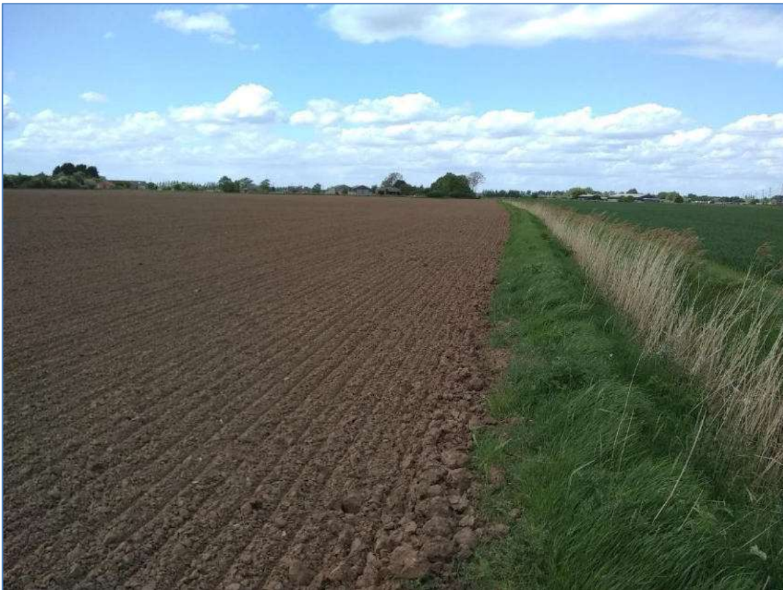
Plate 23: View of Field 5 and its northeastern boundary, from the southeast