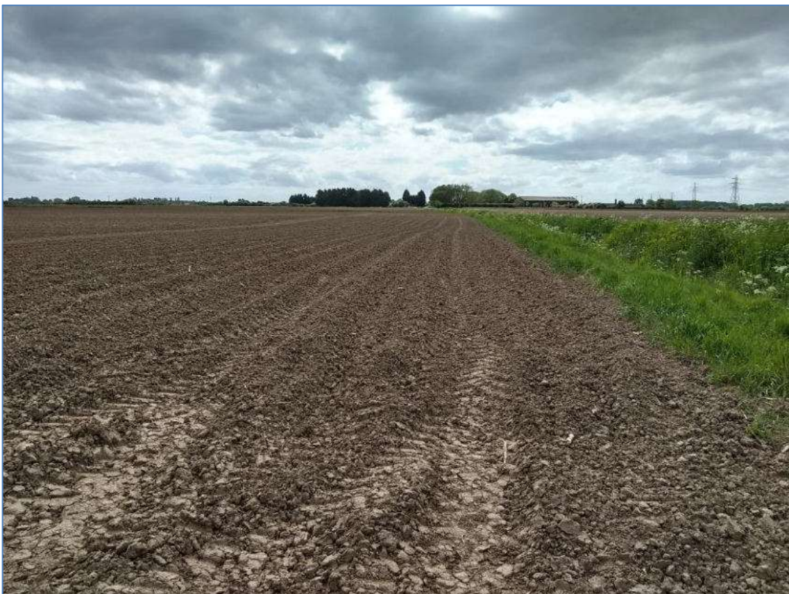
Plate 20: View of Field 4 and its northwestern boundary, from the northeast