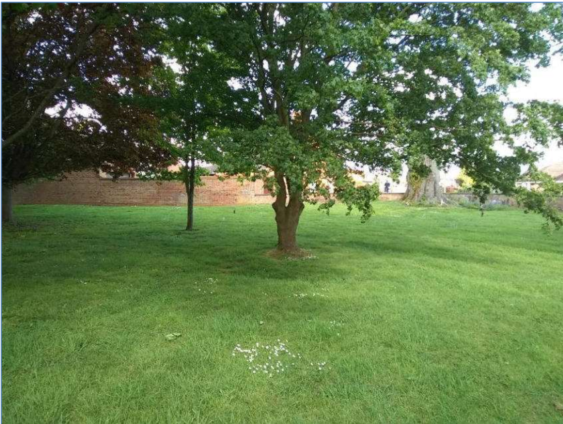
Plate 36: View towards the Site from the churchyard of All Saints Church (Asset 5), from the west