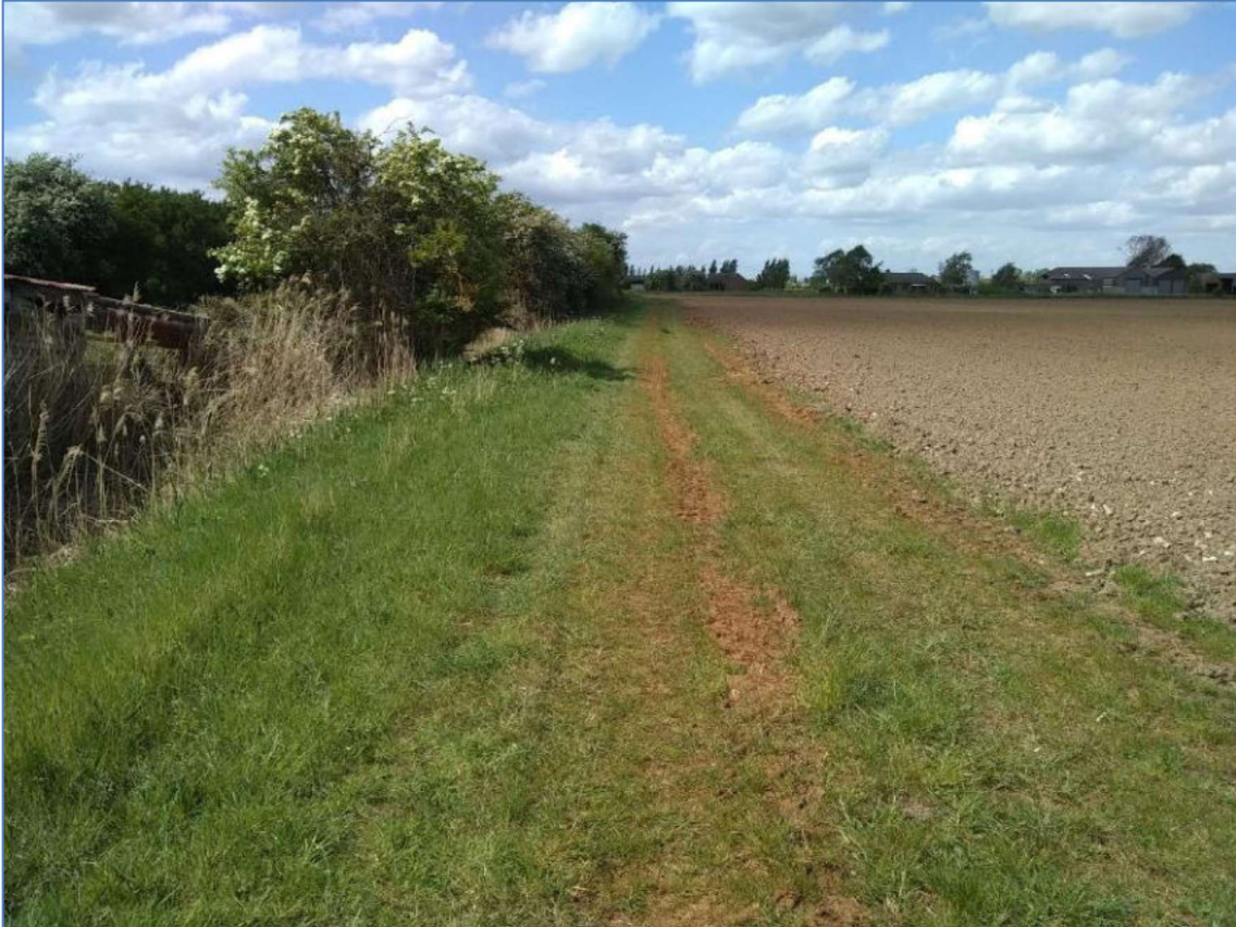
Plate 29: View of Field 5 and its southwestern boundary, from the southeast