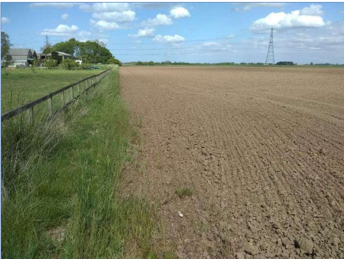
Plate 22: View of Field 5 and its northwestern boundary, from the southwest