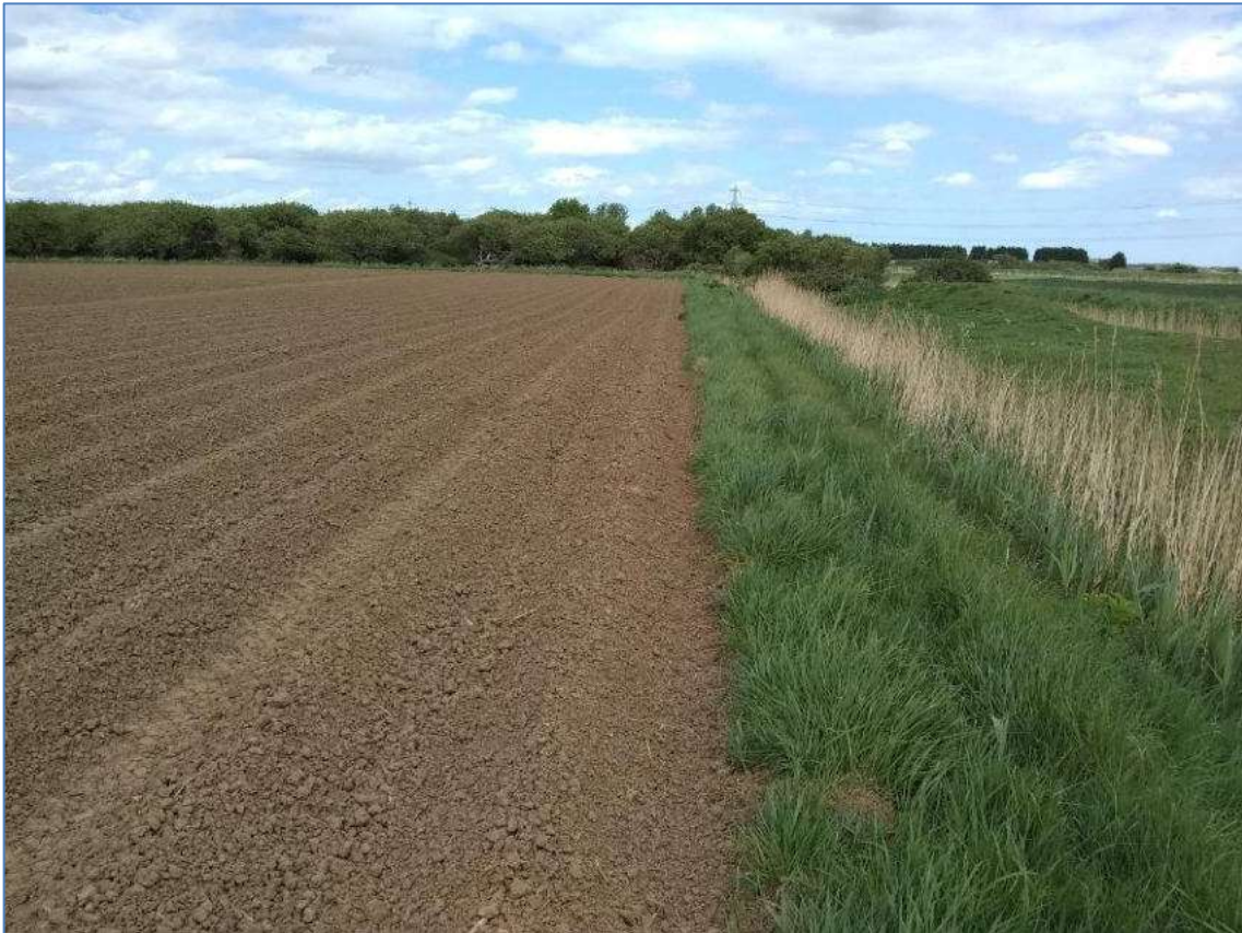
Plate 17: View of Field 4 and its southeastern boundary, from the southwest