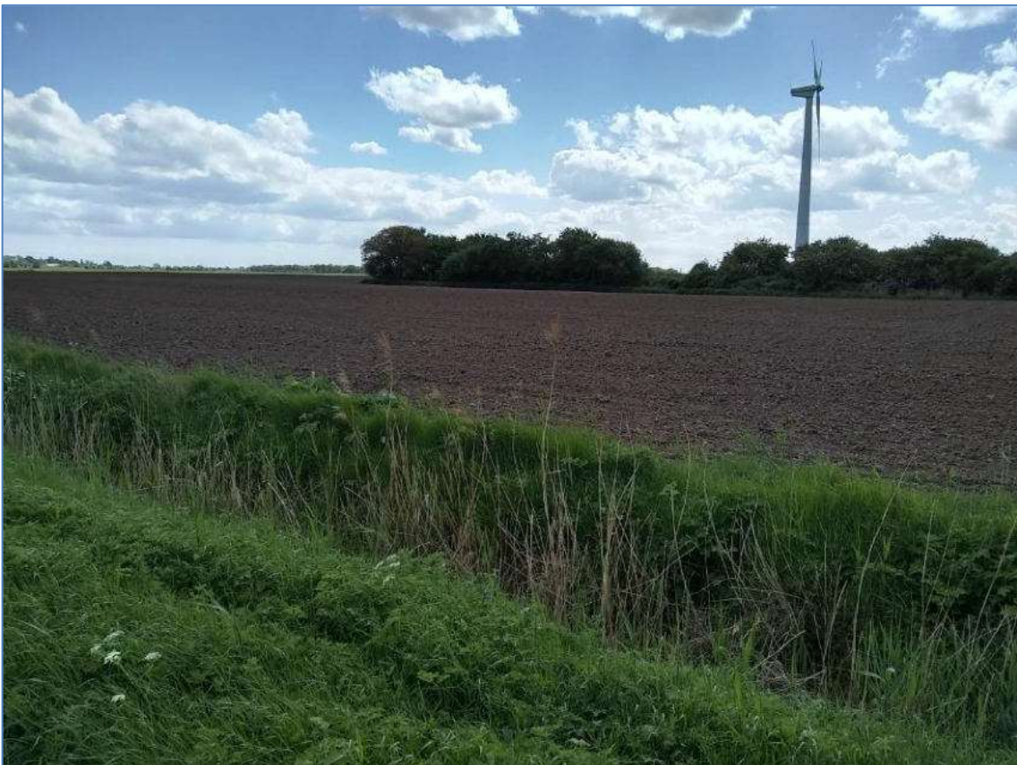
Plate 30: View of Field 6 and its northwestern boundary, from the east