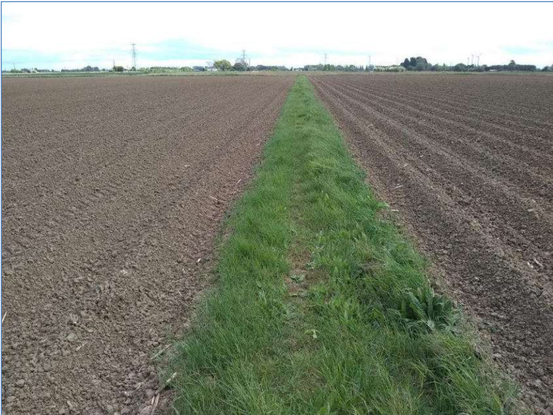
Plate 15: View of the boundary between Field 3 and Field 4, from the southeast