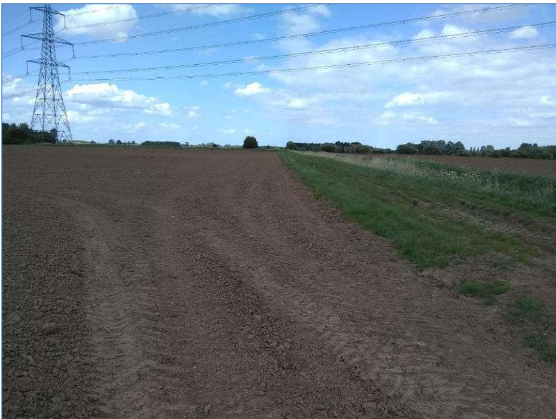
Plate 26: View of Field 5 and its southeastern boundary, from the southwest