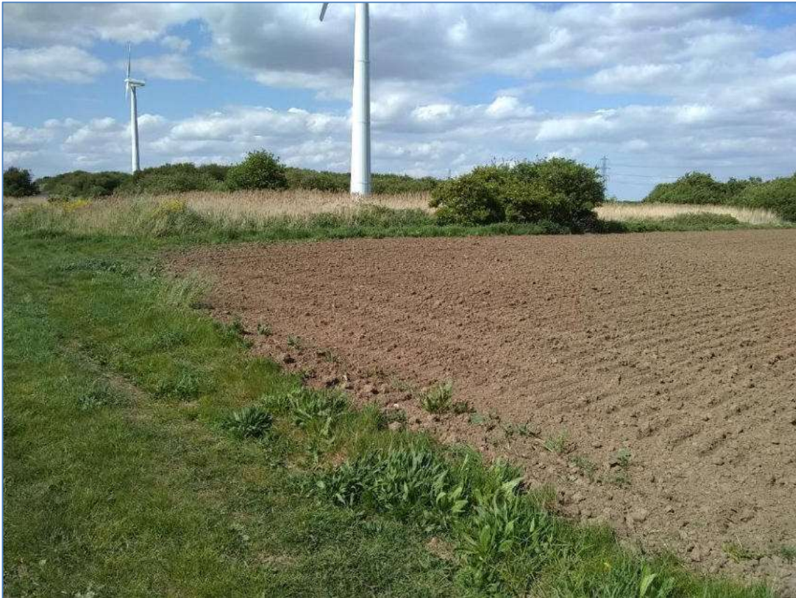
Plate 31: View of Field 6 and its northwestern boundary, from the south