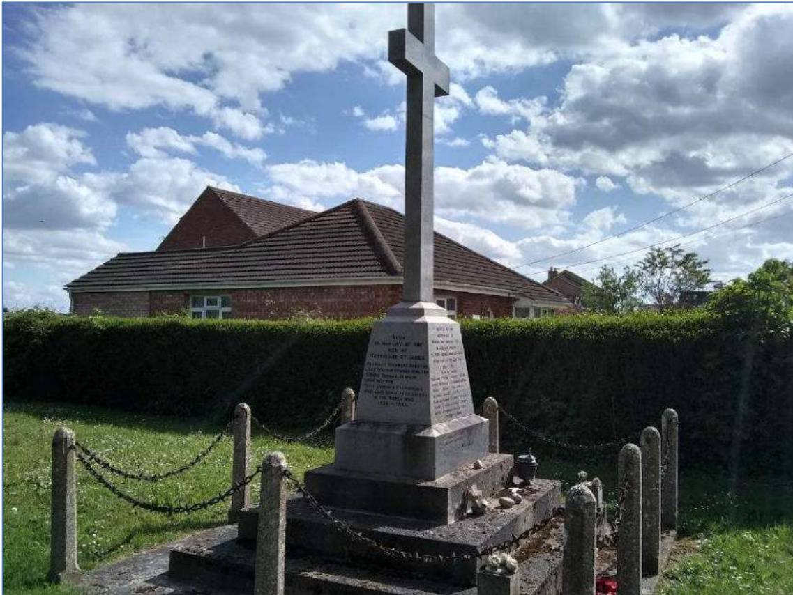
Plate 39: View of the Grade II Listed Marshland Smeeth and Fen War Memorial (Asset 2), from the north