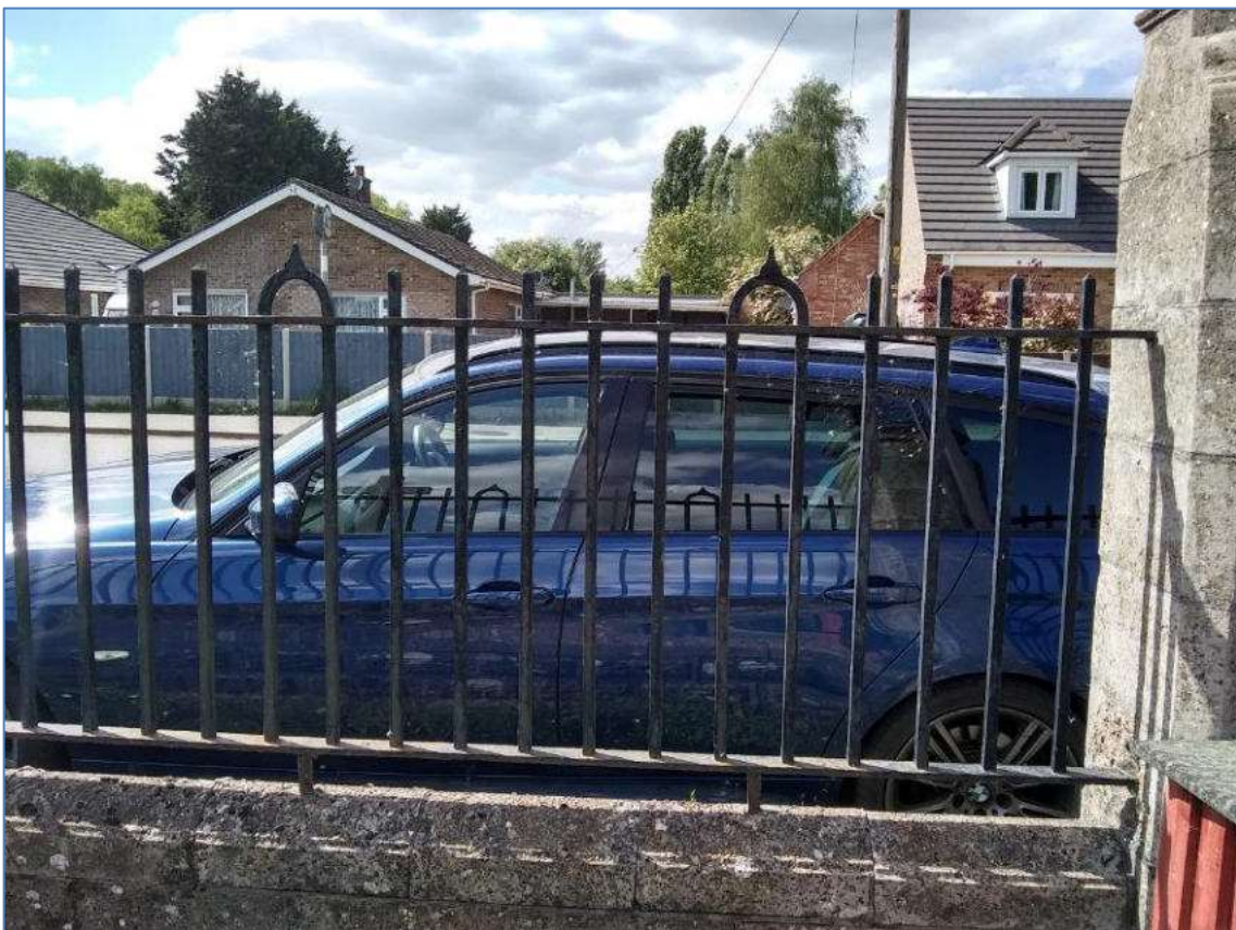
Plate 40: View towards the Site from near to the Grade II Listed Marshland Smeeth and Fen War Memorial (Asset 2), from the southeast