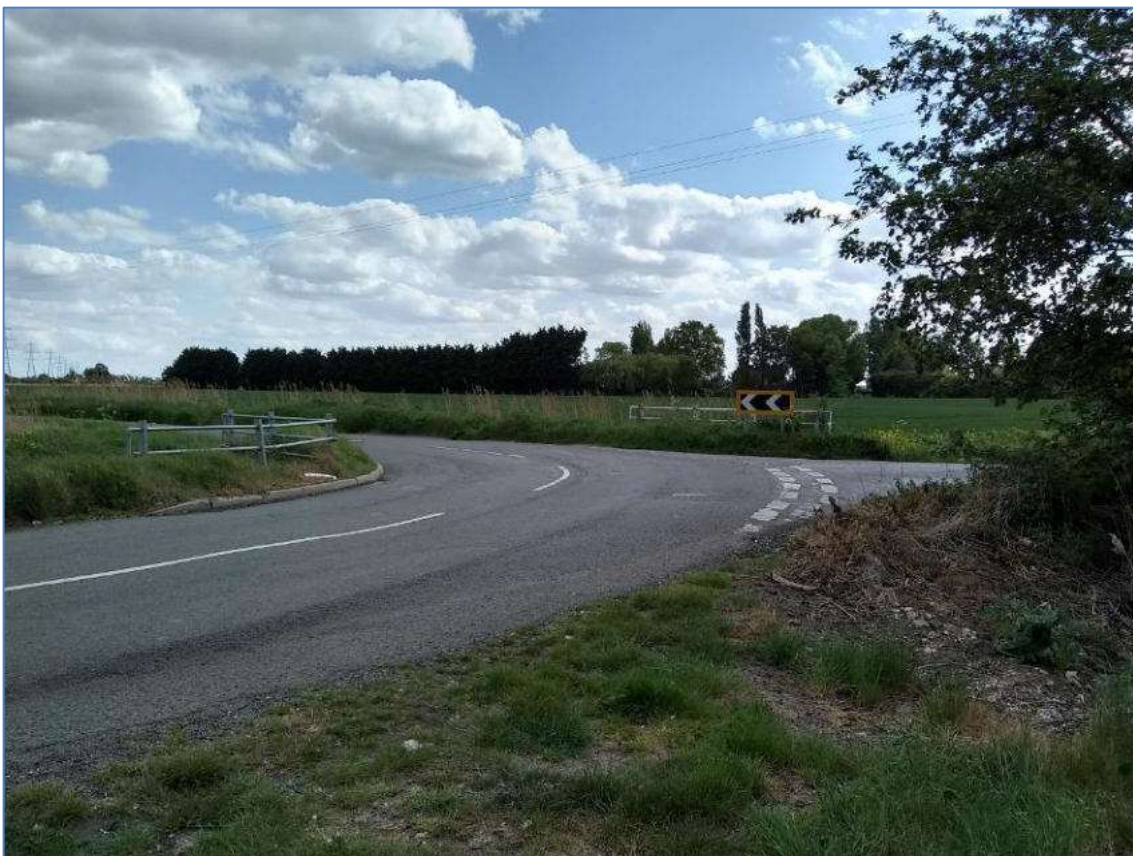
Plate 38: View towards the Site from near to the Grade II Listed Mill House (Asset 1), from the northeast