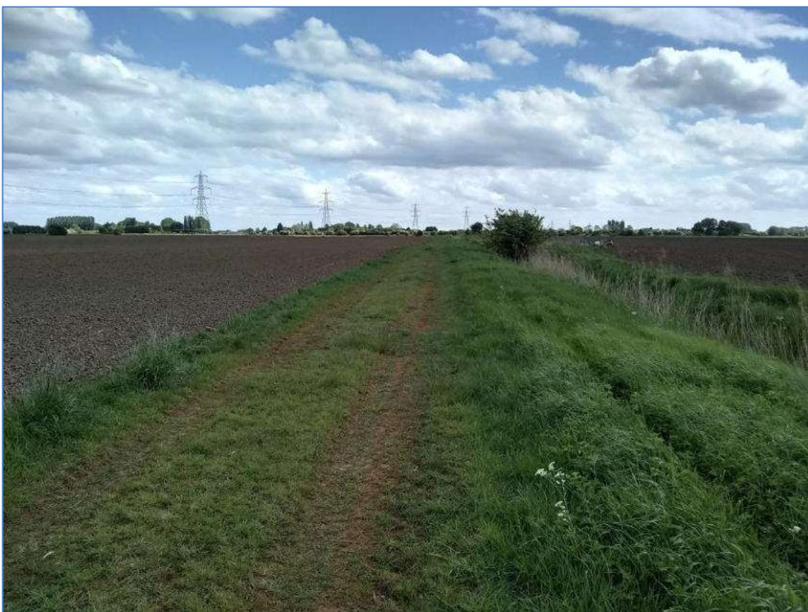
Plate 28: View of the boundary between Field 5 and Field 6, from the northwest