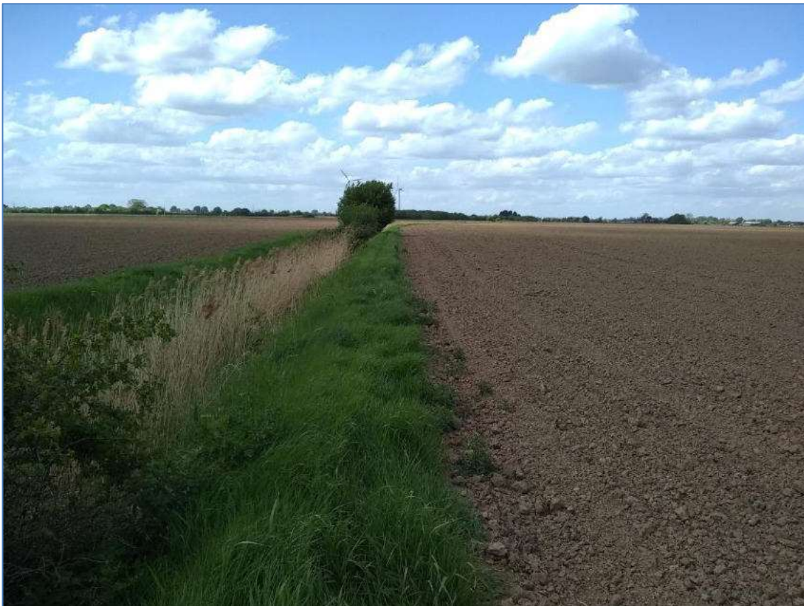
Plate 27: View of the boundary between Field 5 and Field 6, from the southeast