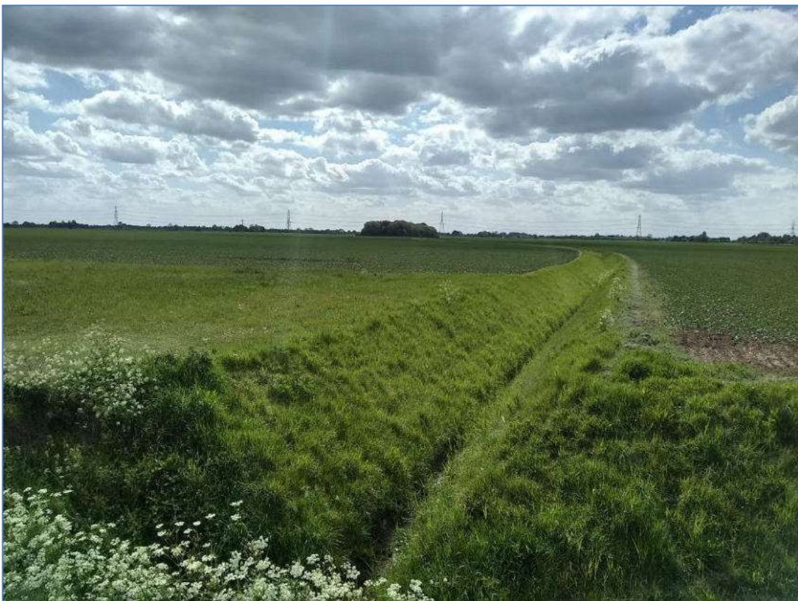
Plate 42: View towards the Site from near to the Grade II Listed Trinity House (Asset 8), from the northeast