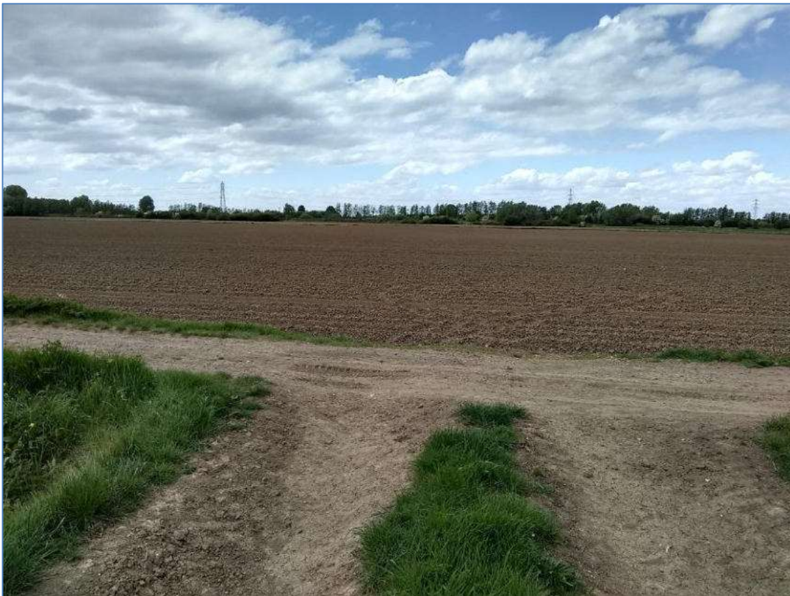
Plate 37: View towards the A47 from the northwestern boundary of the Site, from the east