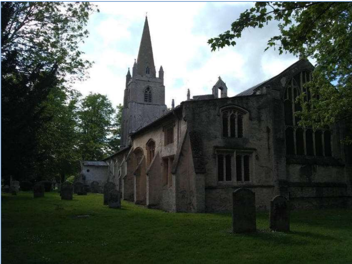
Plate 34: View of the Grade I Listed Church of All Saints (Asset 5), from the east