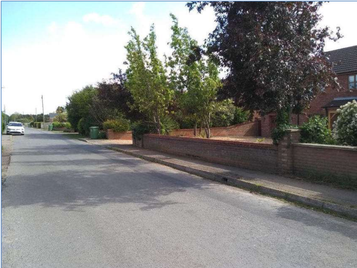
Plate 41: View towards the Site from near to the Grade II Listed Old Post Office (Asset 7), from the northwest