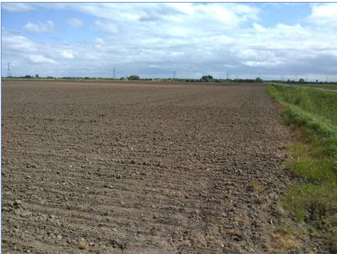
Plate 12: View of Field 2 and its southwestern boundary, from the northwest