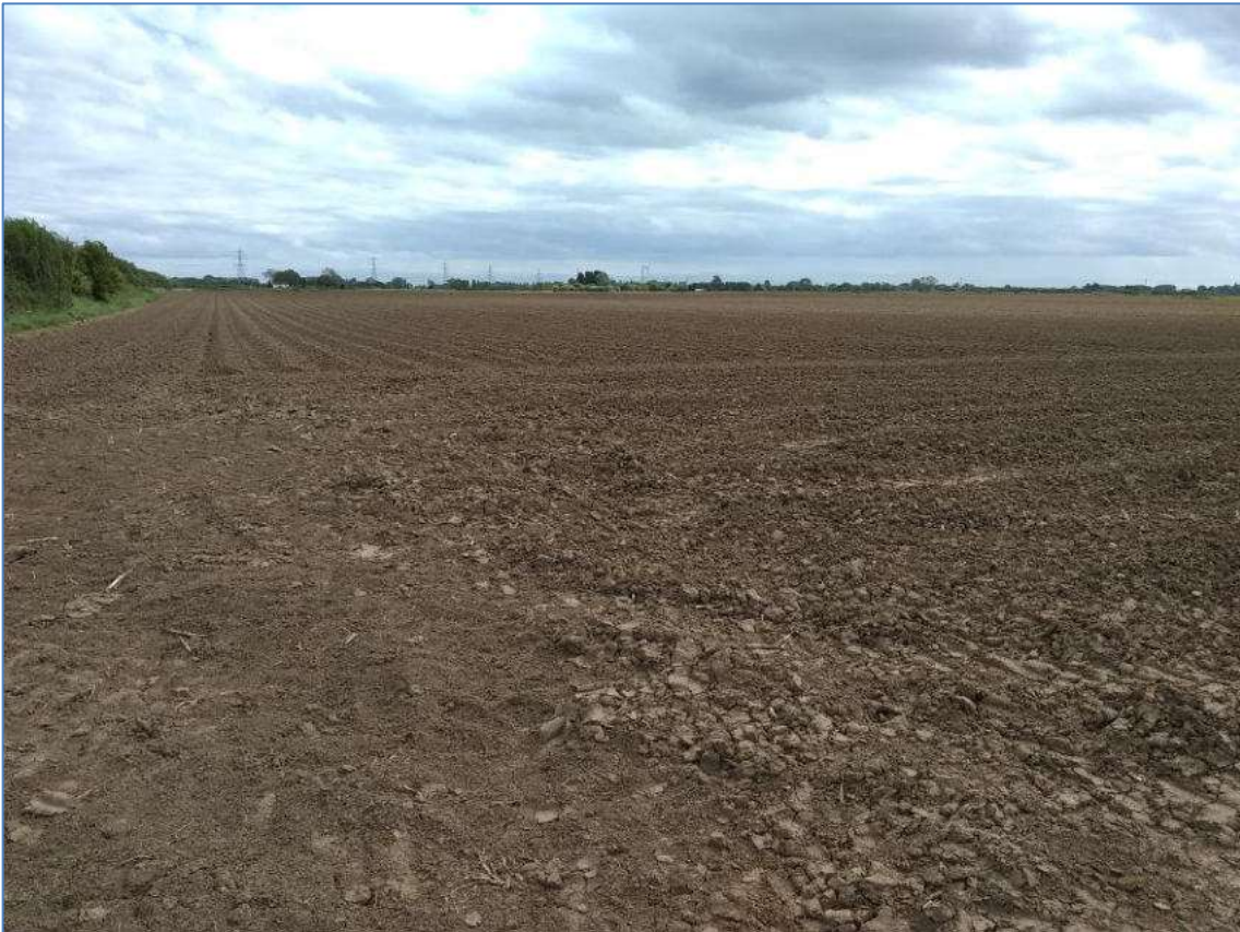
Plate 21: View across Field 4, and the slightly raised area, from the northwest