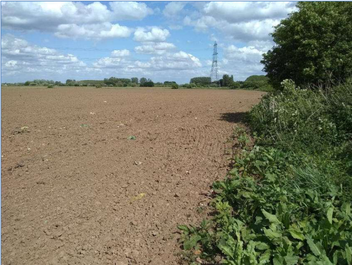
Plate 33: View of Field 6 and its southeastern boundary, from the southwest