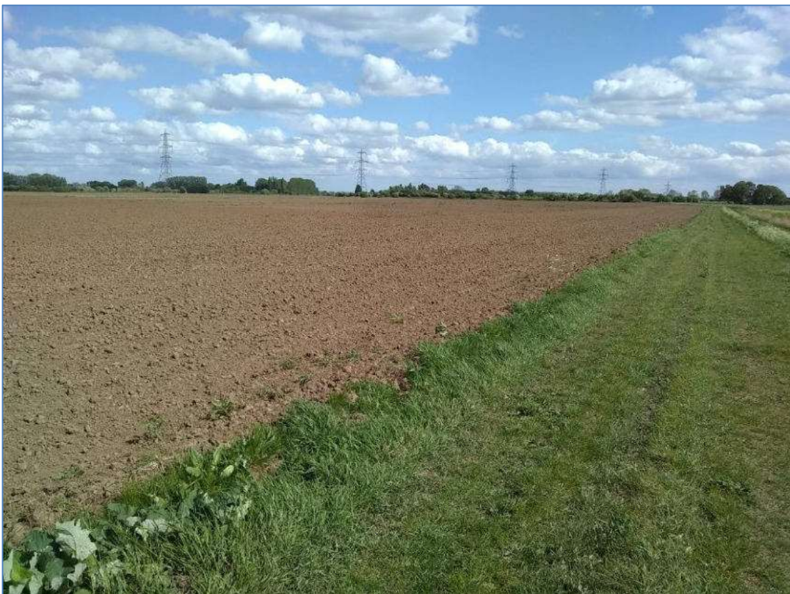
Plate 32: View of Field 6 and its southwestern boundary, from the northwest