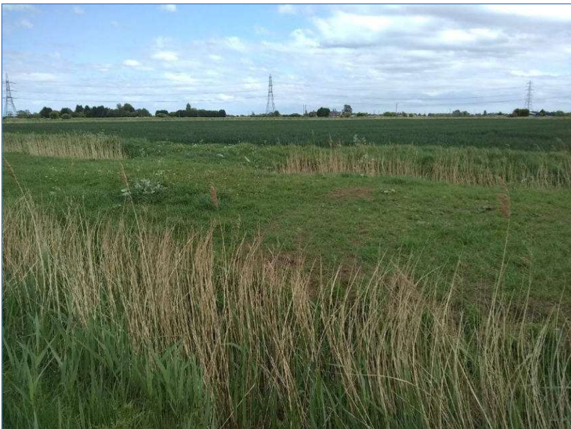
Plate 18: View of the overgrown trackway to the southeast of Field 4, from the west