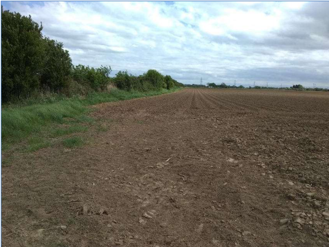
Plate 19: View of Field 4 and its northeastern boundary, from the northwest