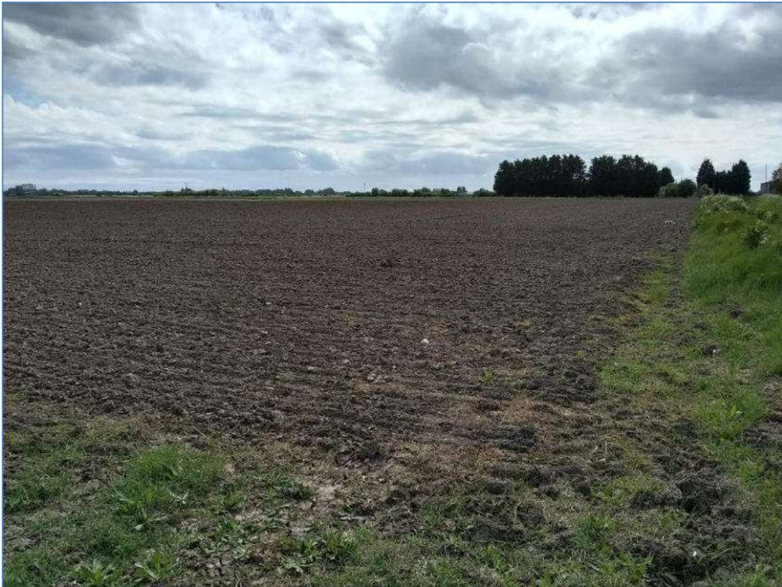
Plate 13: View of Field 2 and its northwestern boundary, from the northeast