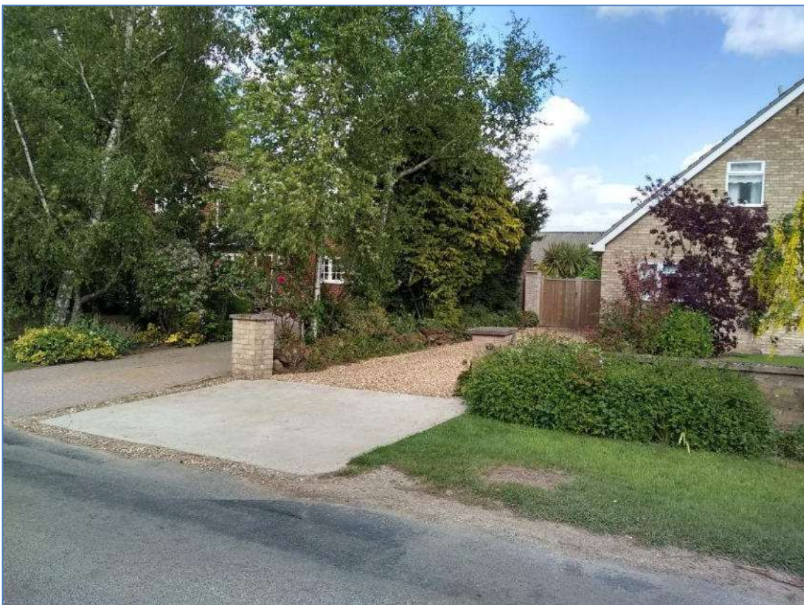
Plate 44: View towards the Site from near to the Grade II Listed Austin House (Asset 10), from the west