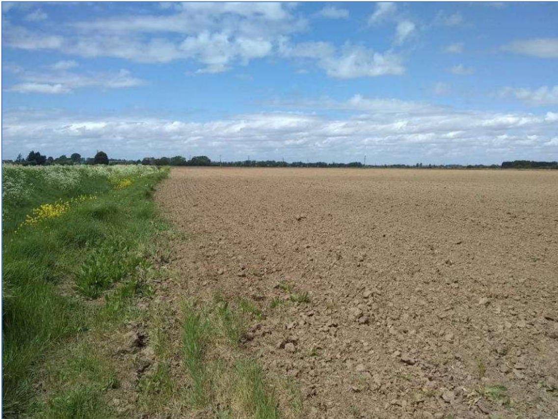
Plate 11: View of Field 2 and its southwestern boundary, from the southeast