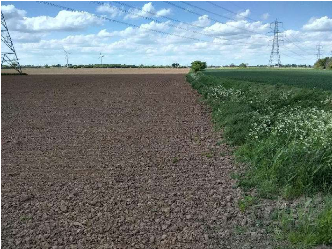
Plate 25: View of Field 5 and its northeastern boundary, from the southeast