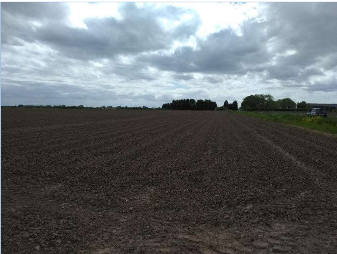
Plate 16: View of Field 3 and its northwestern boundary, from the northeast