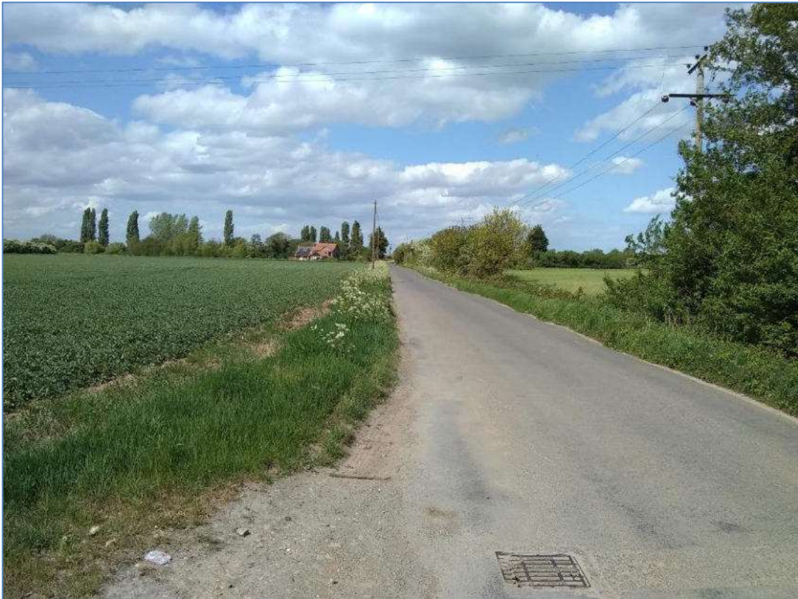
Plate 43: View towards the Site from near to the Grade II Banyer Hall (Asset 9), from the southwest