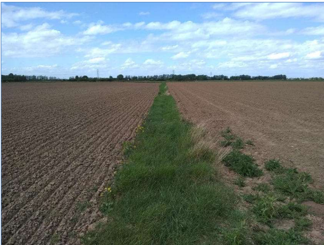
Plate 8: View of the straight section of the boundary between Fields 2 and 3, from the southeast