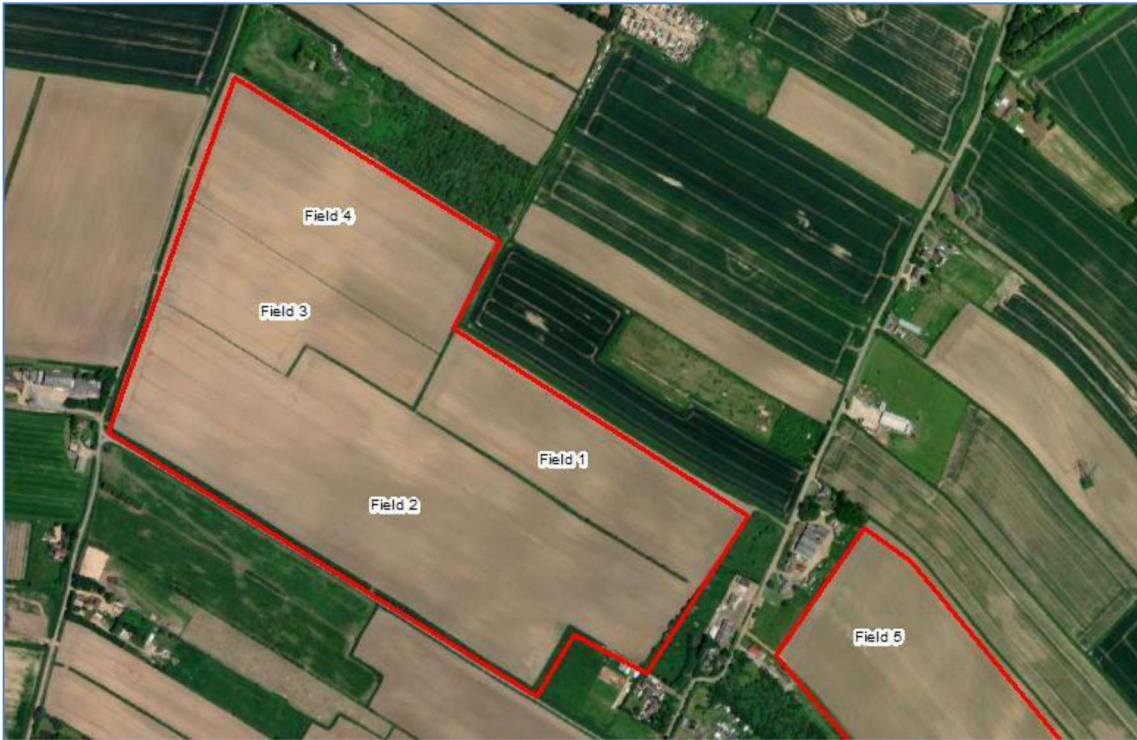
Plate 1: Field numbers in the western part of the Site