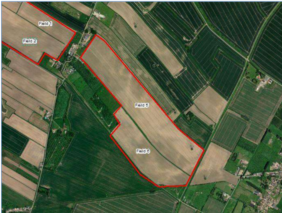
Plate 2: Field numbers in the eastern part of the Site