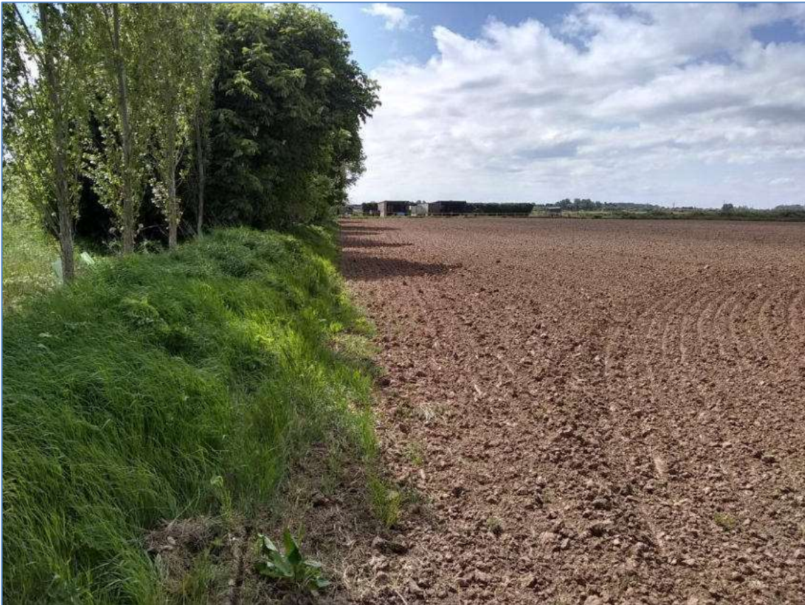
Plate 9: View of Field 2 and part of its southeastern boundary, from the northeast