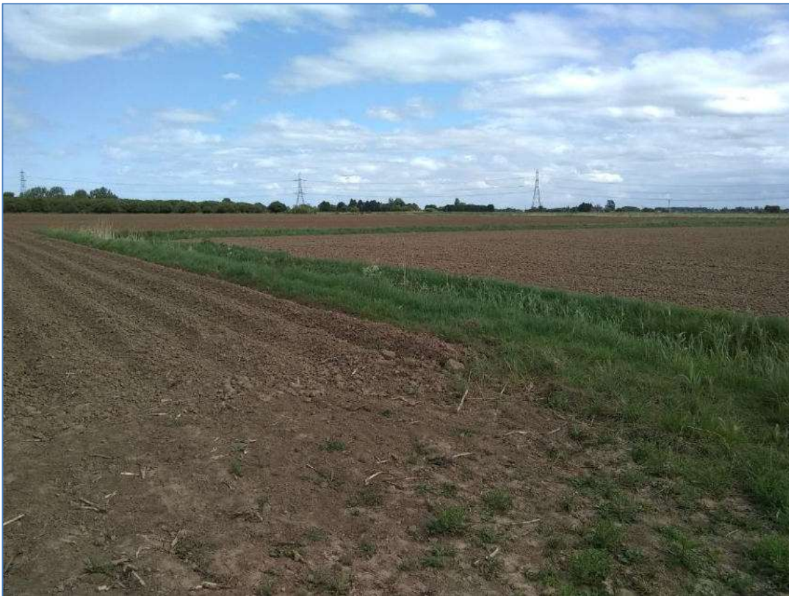
Plate 7: View of the L-shaped section of the boundary between Fields 2 and 3, from the southwest