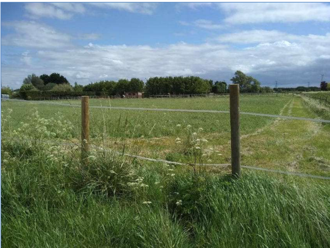
Plate 10: View beyond part of the southeastern boundary of Field 2 the from the northwest