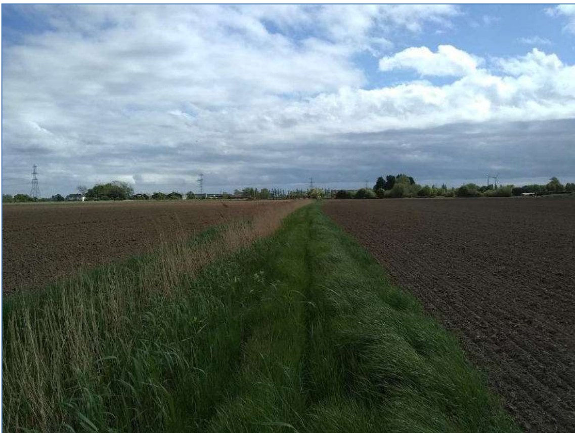
Plate 6: View along the boundary between Fields 1 and 2, from the northwest