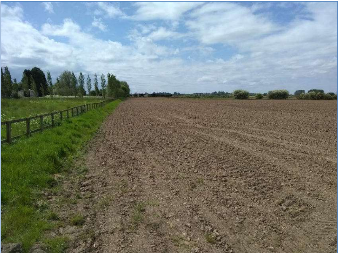
Plate 4: View of Field 1 and its southeastern boundary, from the northeast