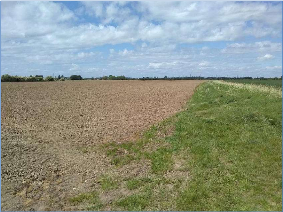
Plate 3: View of Field 1 and its northeastern boundary, from the east