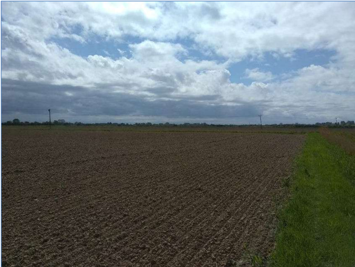
Plate 5: View of Field 1 and its northwestern boundary, from the northeast