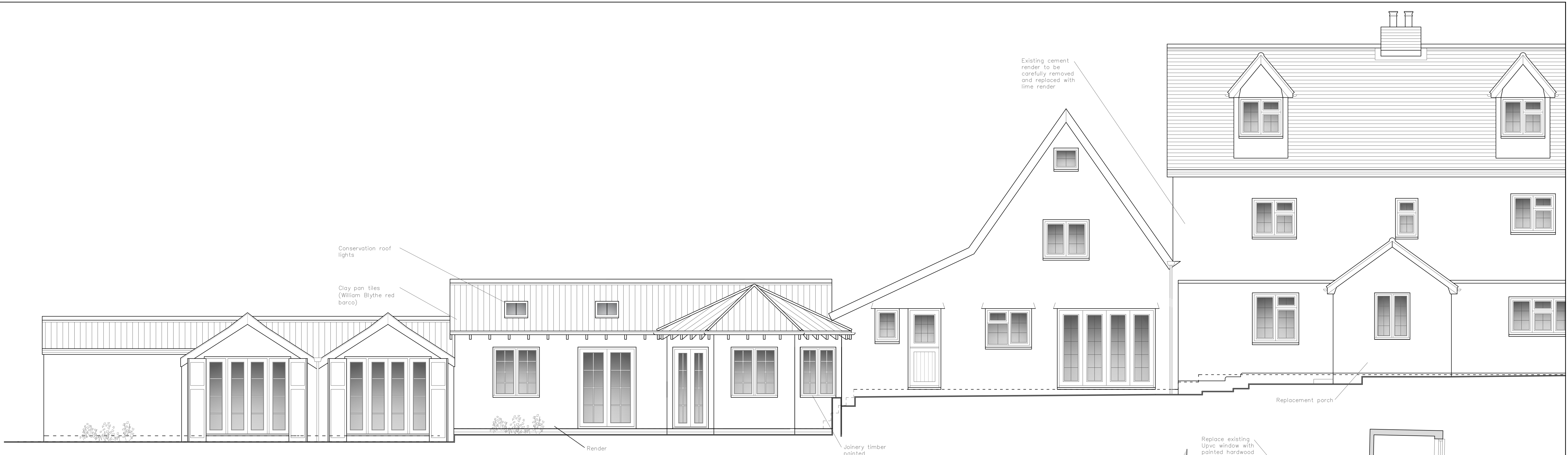
Proposed Front (S-W) Elevation