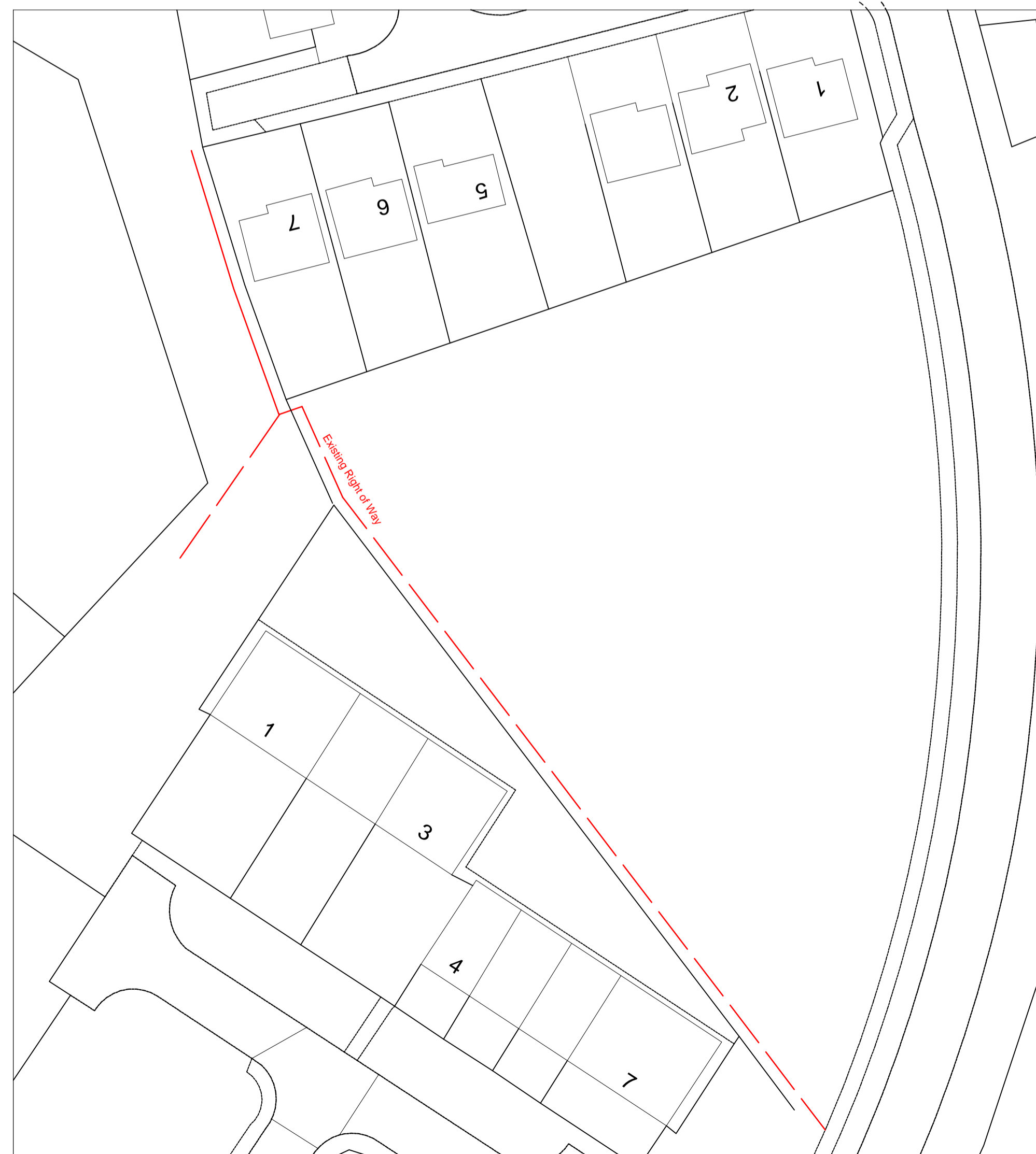
Site Plan as Existing at 1:500