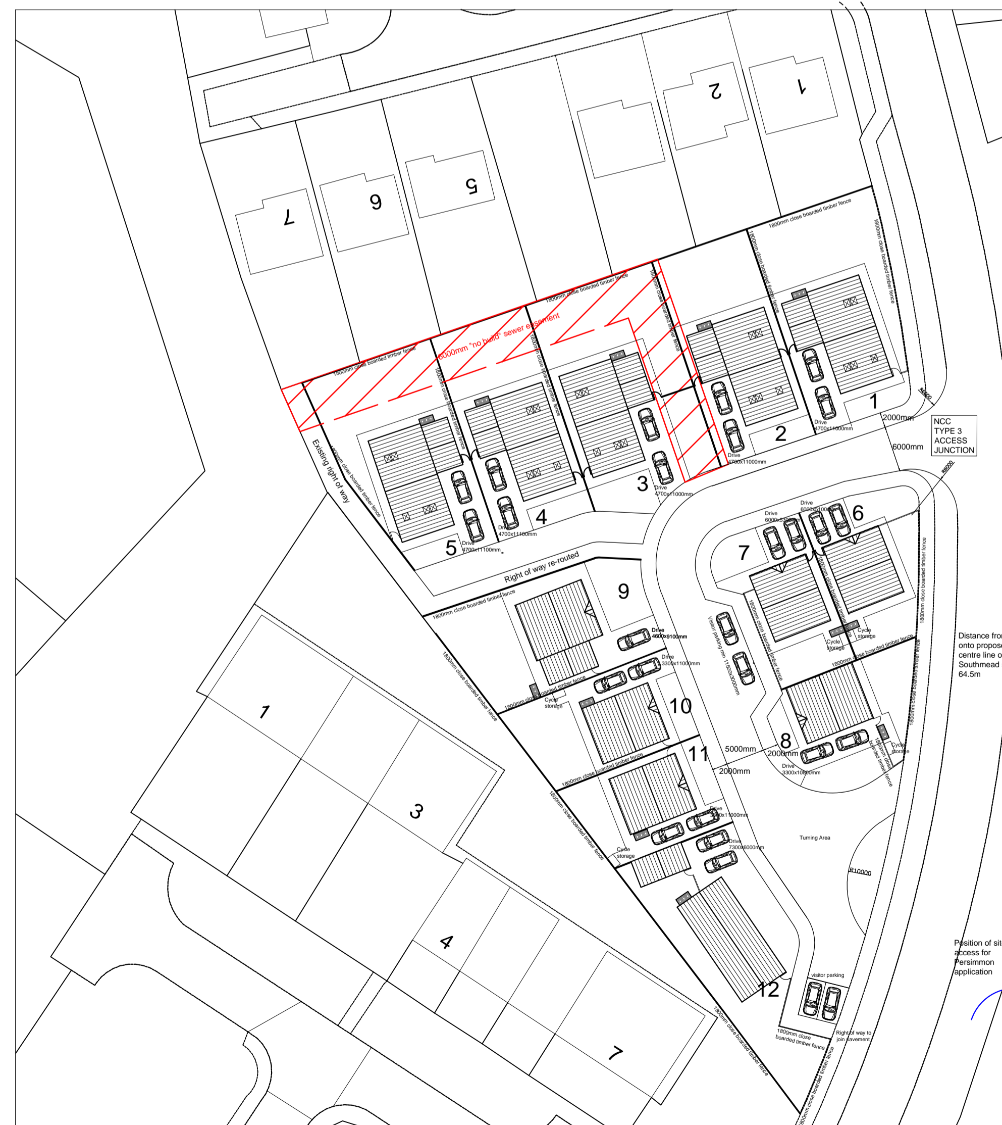
Site Plan as Proposed at 1:500