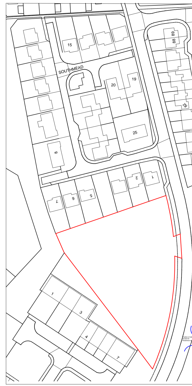
Location Plan at 1:1250

All dimensions to be checked on site. Do not Scale from the drawing. Any discrepancies to be reported to the Project Surveyor before the commencement of any works.