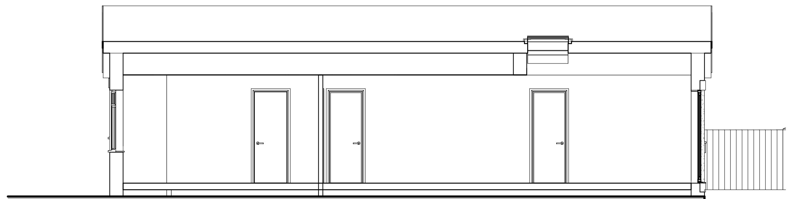
Section B-B 1 : 50

GENERAL NOTES ALL WORK TO BE CARRIED OUT IN STRICT ACCORDANCE WITH THE BUILDING REGULATIONS AND TO THE SATISFACTION OF THE LOCAL AUTHORITY TOWN, COUNTRY PLANNING, BUILDING CONTROL AND DRAINAGE DEPARTMENTS. APPOINTED CONTRACTOR RESPONSIBLE FOR NOTIFYING LOCAL AUTHORITY BUILDING CONTROL DEPARTMENT UPON COMMENCEMENT OF BUILDING WORKS ON SITE. DIMENSIONS ALL TO SITE CHECK. DISCREPANCIES (IF ANY) TO BE BROUGHT TO THE IMMEDIATE ATTENTION OF THE DESIGNER. THESE PLANS HAVE BEEN PREPARED FOR SUBMISSION TO THE LOCAL AUTHORITY FOR TOWN & COUNTRY PLANNING AND (OR) BUILDING REGULATION PURPOSES ONLY AND DO NOT CONSTITUTE FULL WORKING DRAWINGS. INFORMATION NOTED ON THE PLANS OR ACCOMPANYING DOCUMENTS / DETAILS IS NOT EXHAUSTIVE AND CONTRACTOR TO CHECK WITH CLIENT AS TO ANY ADDITIONAL WORK NOT SPECIFICALLY NOTED OR IMPLIED. ALL MATERIALS ARE TO BE USED IN STRICT ACCORDANCE WITH THE RECOMMENDATIONS OF THE MANUFACTURERS. ANY WORK COMMENCING ON SITE PRIOR TO BUILDING REGULATIONS APPROVAL IS NOT RECOMMENDED AND IS ENTIRELY THE RESPONSIBILITY OF THE CLIENT.