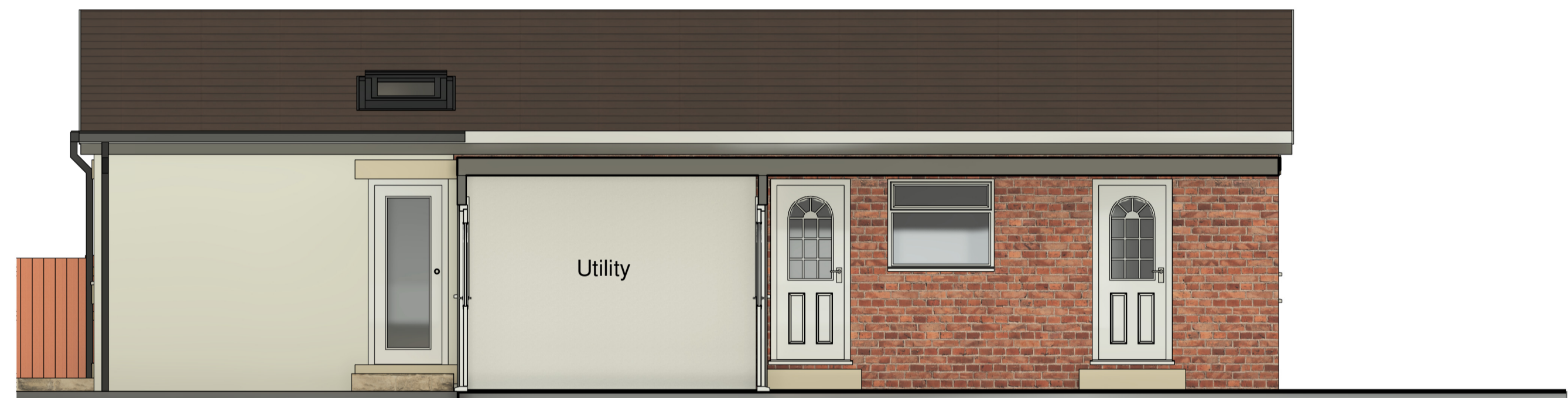
Proposed North Elevation 1 : 50