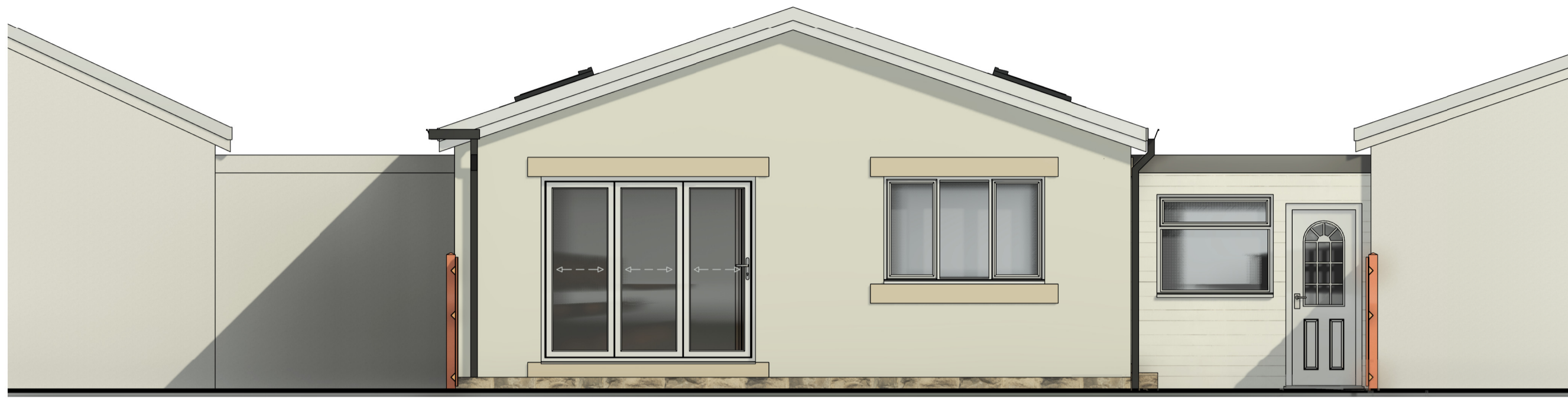
Proposed East Elevation 1 : 50