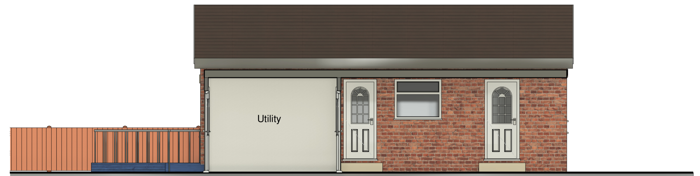
Existing North Elevation 1 : 50