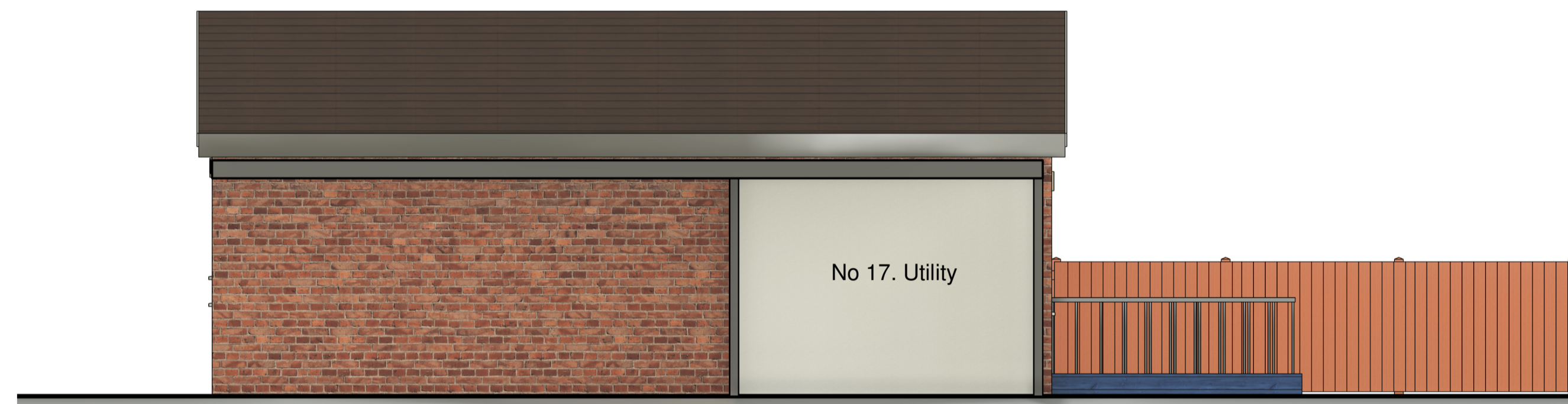
Existing South Elevation 1 : 50