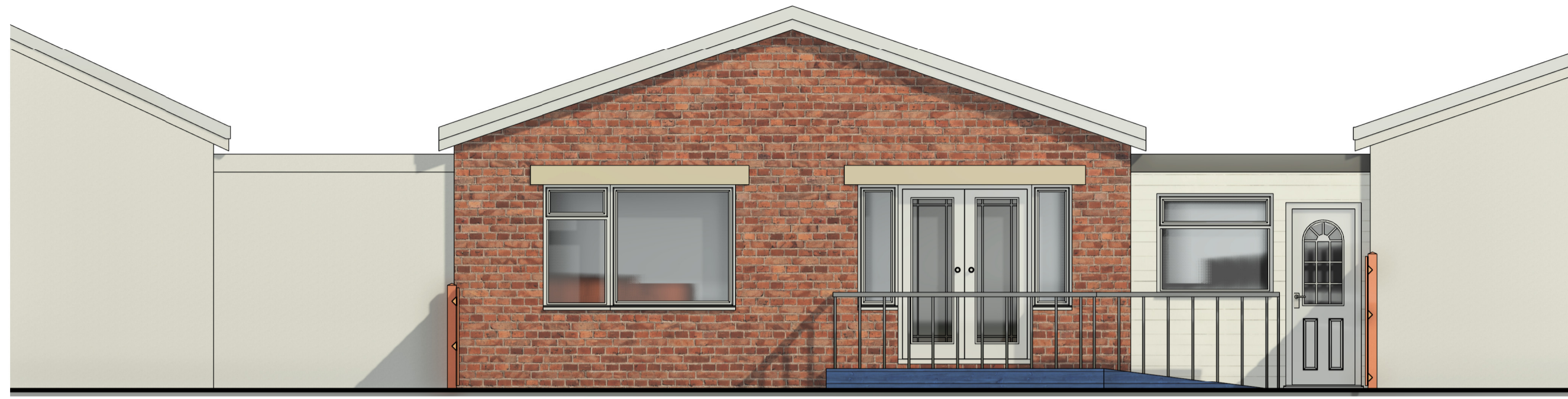
Existing East Elevation 1 : 50