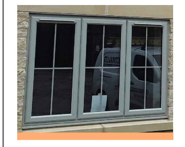
NOT TO SCALE WINDOW TYPE: STANDARD CASEMENT COLOUR ONLY INDICATIVE AND TO BE CONFIRMED