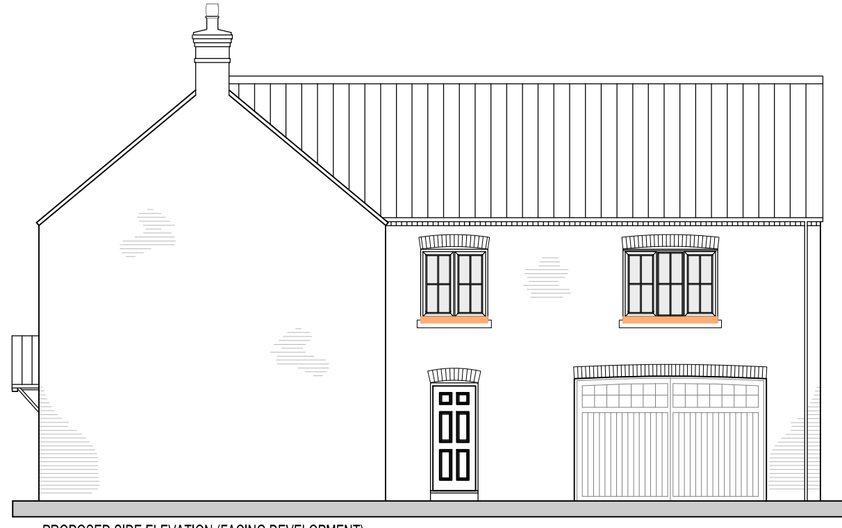
PROPOSED SIDE ELEVATION (FACING DEVELOPMENT)