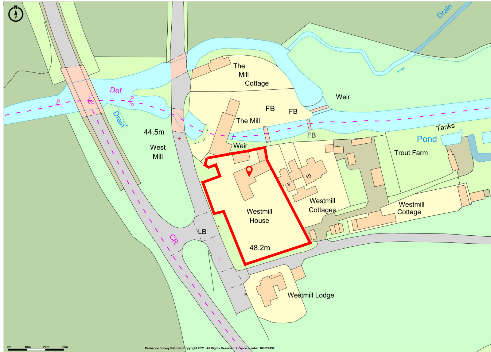
① Location Plan 1:1250